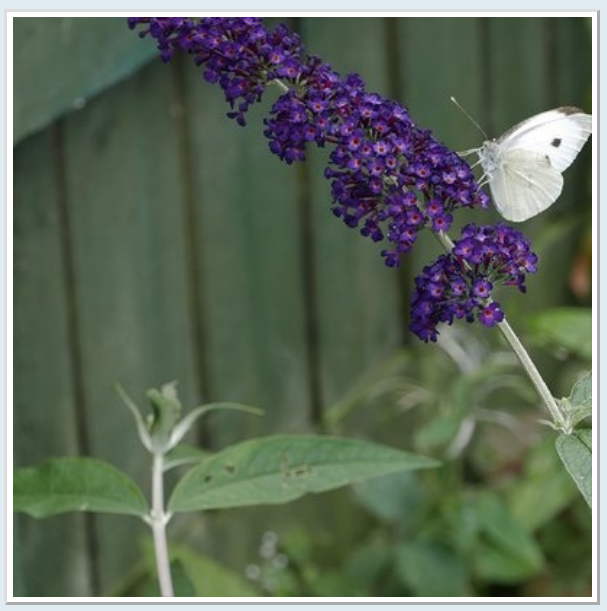
Taken with my compact.

It was a much cloudier and changeable day in Bristol yesterday and threatened rain for most of the day, which eventually realised about 4pm. There are so many whites about at the moment, although not many are coming to rest in my garden, although I did manage to just about snap one on the breezy buddleia.