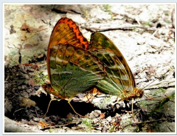
Bernwood, Oxon – 6th July 2018 Olympus E-M1-ii with 100-400mm lens – 1/250s@f/13 ISO640 I found it interesting to observe how they regularly flew between different perches, while remaining coupled. I even noted one with its proboscis extended, presumably feeding or taking up moisture, while coupled.

Bernwood, Oxon - 6th July 2018 Olympus E-M1-ii with 100-400mm lens - 1/1000s@f/8 ISO640 It was here that we saw our first mating pair of Silver-washed Fritillaries and this continued to be a theme for the rest of our walk. The day seemed to be "mating day" for this species and we had seen around six pairs in cop by the end of our walk.