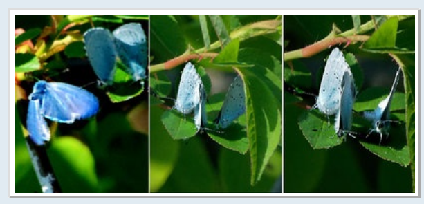
garden, Abingdon – 20th April 2018 Olympus E-M1 Mk.ii with 100-400mm lens Although the photos were taken through glass at rather a long range (~ 5 m), I believe that they show some interesting aspects of behaviour.