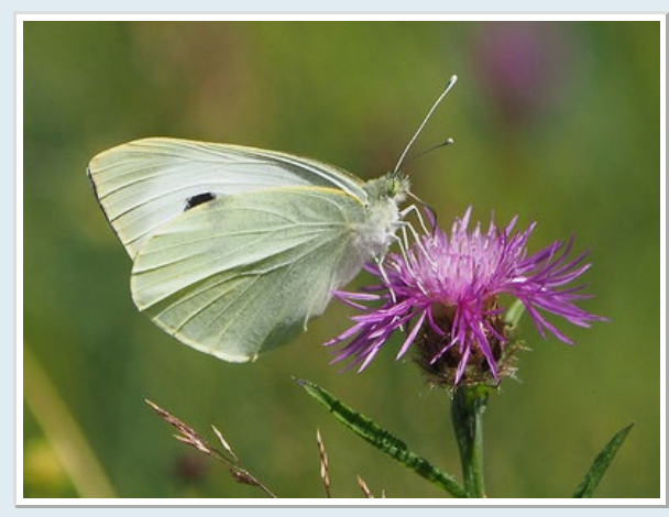
Bernwood Meadow, Oxon - 6th July 2018 Olympus E-M1 with 400mm lens - 1/1600s@f/8 ISO640 Mike