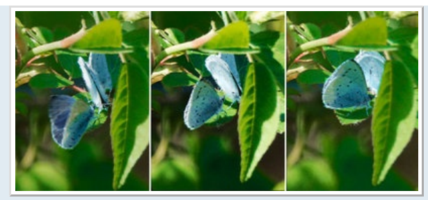
garden, Abingdon – 20th April 2018 Olympus E-M1 Mk.ii with 100-400mm lens