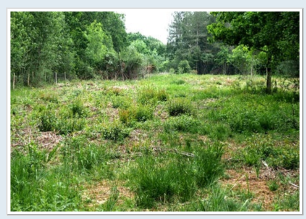
Somerford Common, Wilts. - 29th May 2018 Olympus E-M1 Mk.ii with 12-50 mm lens - 1/160s@f/8 ISO640

I happened to be in the area again, so looked in, to see what was happening there now. There appears to be management work in progress, with the original open area having been cleared and surrounded by a fence.