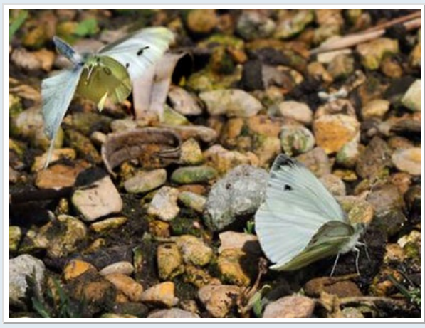
Nuneham Garden Centre, Oxon - 2nd July 2018 Olympus E-M1-ii with 40-150mm lens - 1/2000s@f/8 ISO640

It was interesting to watch how each burst of activity started with one or two and then others arrived to join in, until a passing shopper made them scatter and re-form somewhere else. As the following (none too sharp) photos show, they often arrived with the proboscis already unfurling.