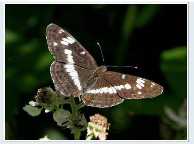
Bucknell Wood, Northants – 3rd July 2018 Olympus E-M1-ii with 100-400mm lens – 1/640s@f/8 ISO640