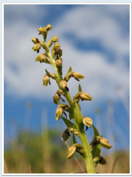
Bald Hill, Oxon - 31st July 2018 Olympus E-M1-ii with 12-50mm lens - 1/800s@f/11 ISO 640

One of my main reasons for visiting the site was to see how the Frog Orchids had fared through the hot weather. The answer was 'not well' and I found only two flower spikes, both looking rather scorched.