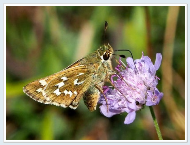
Bald Hill, Oxon - 31st July 2018 Olympus E-M1-ii with 100-400mm lens - 1/1600s@f/11 ISO 640

Soon, however, I realised that the slope was buzzing with Silver-spotted Skippers, keeping low as they zoomed between Scabious flowers.