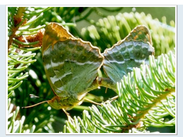
Bernwood, Oxon - 6th July 2018 Olympus E-M1-ii with 100-400mm lens - 1/125s@f/8 ISO640

One photographic tip is to use 'fill in' flash to soften the contrasts between light and shade in these harsh sunlight conditions. The small pop-up flash on many cameras is sufficient for this or, in my own case, I used the small flash attachment that Olympus supplied with my camera.