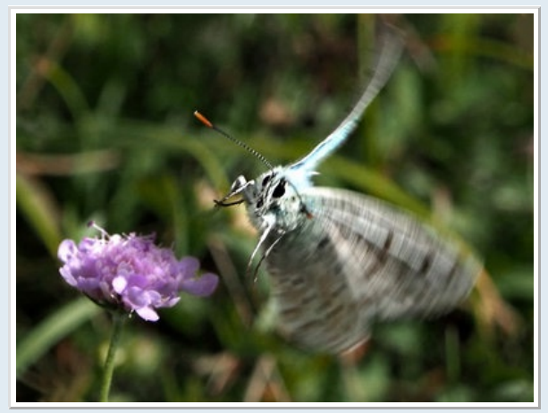
Bald Hill, Oxon - 31st July 2018 Olympus E-M1-ii with 100-400mm lens - 1/1000s@f/11 ISO 640

Bald Hill, Oxon - 31st July 2018 Olympus E-M1-ii with 100-400mm lens - 1/640s@f/10 ISO 640 I took several 'regular' shots but rather liked this one, where the butterfly took off at the end of a short burst of photos.