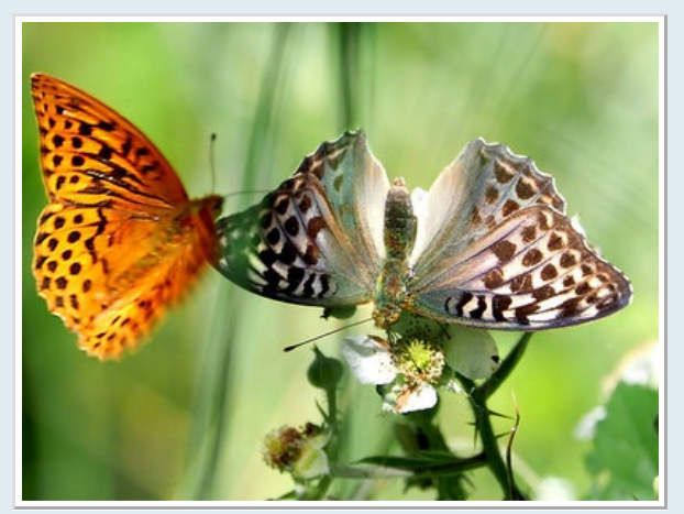
Bucknell Wood, Northants - 3rd July 2018 Olympus E-M1-ii with 100-400mm lens - 1/640s@f/8 ISO640 There were at least two valesina females present in the same area, one with some wing damage that provided identification, but there may have been more.

and, although I didn't realise it at the time, I found afterwards that some of my shots included these 'fly-bys'. The following photo brings out the profound difference between the 'normal' male colour and the valesina female.