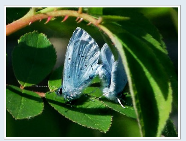
garden, Abingdon – 20th April 2018 Olympus E-M1 Mk.ii with 100-400mm lens – 1/640s@f/10 ISO 640 Mike