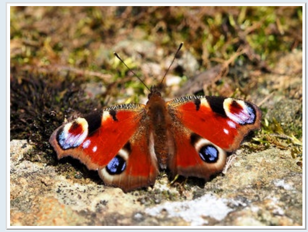
Dry Sandford Pit, Cothill, Oxon - 5th April 2018 Olympus E-M1 Mkii with 100-400mm lens - 1/1000s@f/8 ISO 640 One of my shots of a Peacock illustrates how intimidating such a dramatic eyed-creature might look to a potential predator.

Dry Sandford Pit, Cothill, Oxon - 5th April 2018 Olympus E-M1 Mkii with 100-400mm lens - 1/640s@f/10 ISO 640 The Peacocks were also enjoying the warmth from the stones at the base of the cliff. I am always surprised how bright they look after having spent the Winter in hibernation: