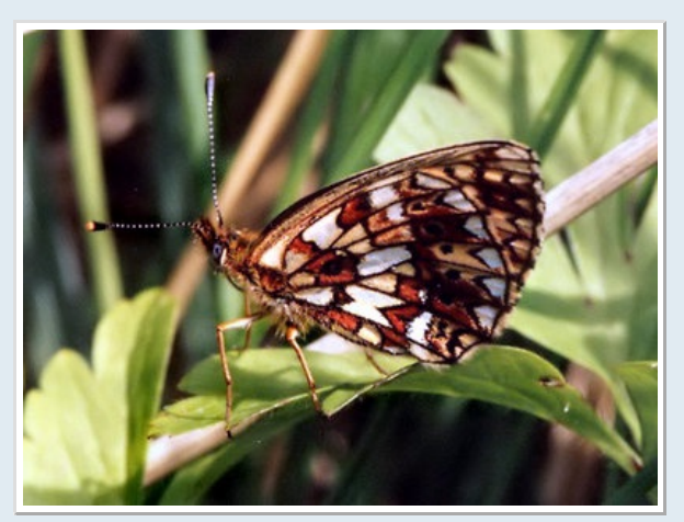
Somerford Common, Wilts. - June 1992 (historical) digital copy from Fuji Negative

Many years ago, my son and I used to make regular butterflying trips to Somerford Common , just to the west of Swindon. In those days (early 1990s), there were both Small and regular Pearl-Bordered Frits, Marsh Frits, and Duke of Burgundy, all to be found there. And then, sadly, they all disappeared around the Millennium. It was also a good location for several orchid species.