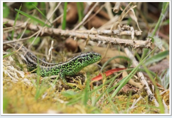
Male & Female sand lizard