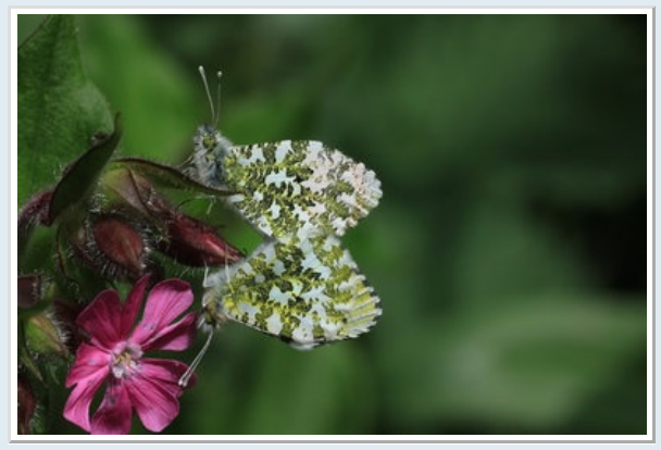
Orange-tip - Anthocharis cardamines