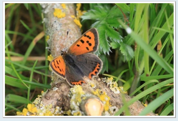
Small Copper – Lycaena phlaeas