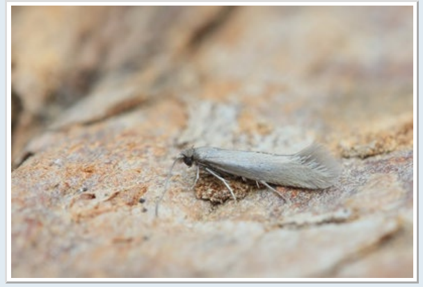
15.063 [BF 0341] Phyllonorycter maestingella