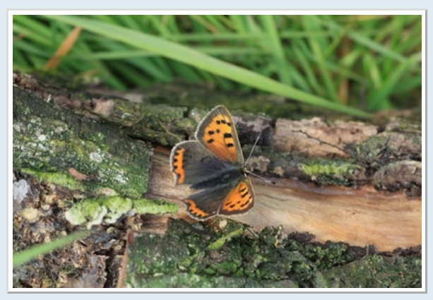
Small Copper – Lycaena phlaeas