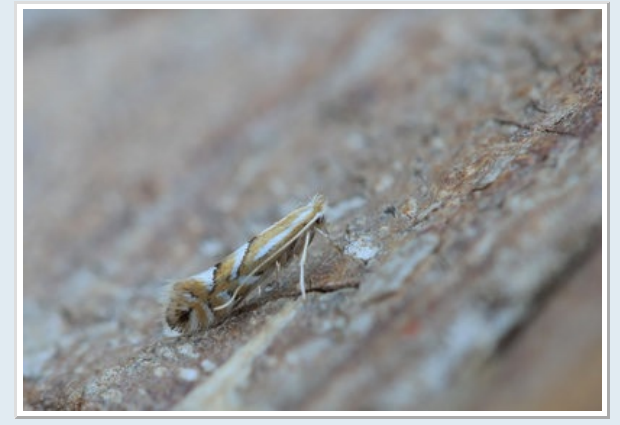
28.019 [BF 0649] Esperia sulphurella