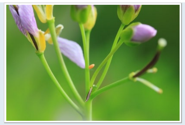
Orange-tip - Anthocharis cardamines - Ovum