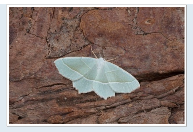
Sill to identify moth ovum (Better picture this time)