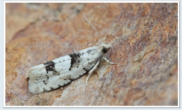
62.010 [BF 1449] Elegia similella - Nationally scarce (Nb)