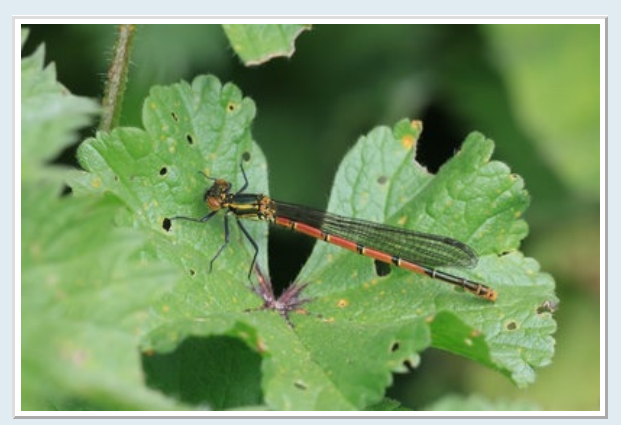
Large Red Damselfly – Pyrrhosoma nymphula