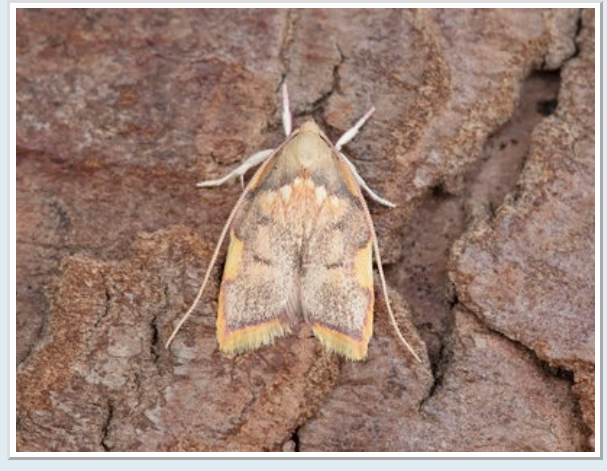
Common White Wave (Cabera pusaria)