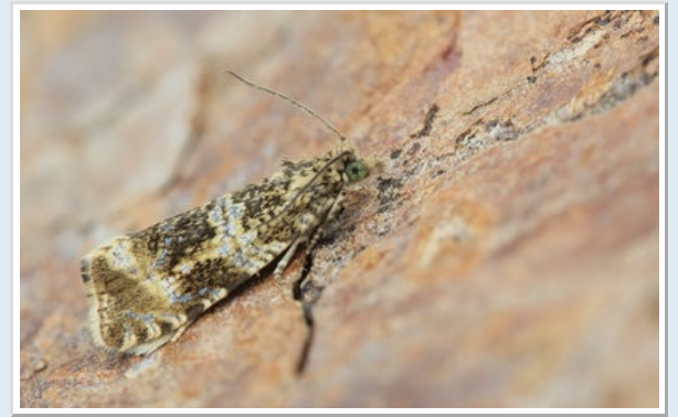
49.254 [BF 1133] Epinotia bilunana