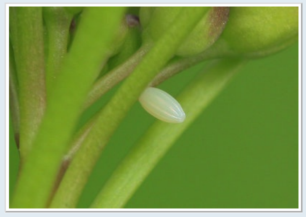
Orange-tip - Anthocharis cardamines - Fresh Ovum 1 cropped