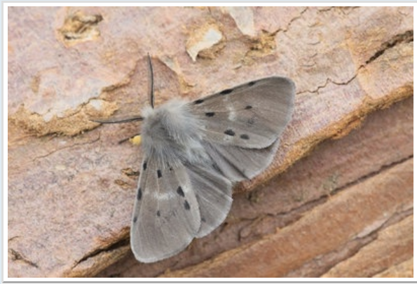
16.024 [BF 0445] Ocnerostoma friesei

72.022 [BF 2063] Muslin Moth (Diaphora mendica)