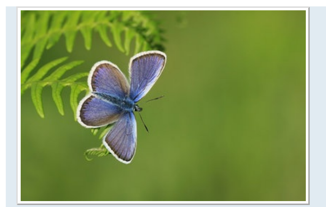
Any help with this one appreciated