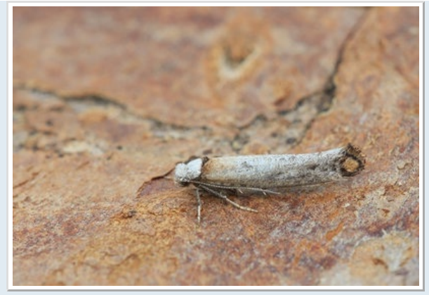
49.166 [BF 1076] Celypha lacunana