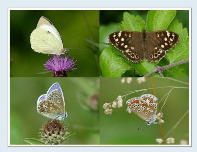
Male and female Common Blue.