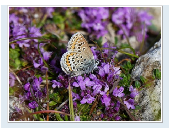
Lots of Knapweed on Portland, much visited.