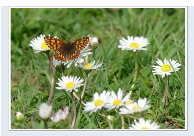
Another \ Duke \ area \ is \ the \ Bonsai \ Bank, \ here \ are \ a \ male \ and \ a \ female, \ always \ nice \ to \ see \ both.