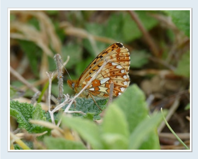
Then I saw these, which look like Small PBF's to me, an unexpected but welcome addition!