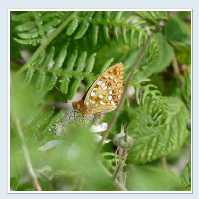
These last 3 shots are of 2 individuals. The sex brands and third spot alignment on the upper forewing make them High Brown males, I think!