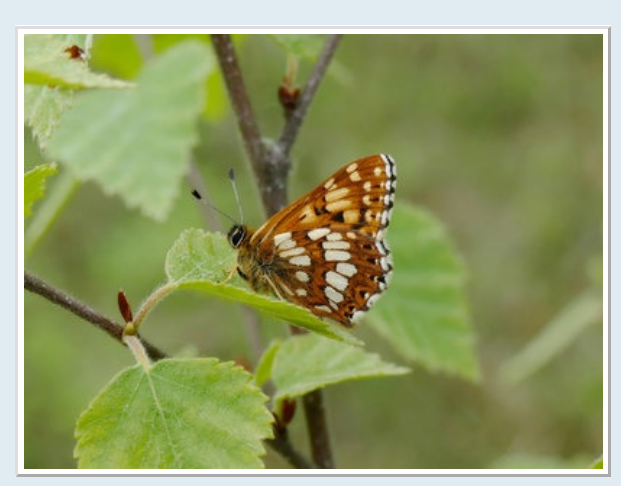
During my circular-ish walks around I saw plenty of other butterflies. Green Veined White, Comma, Dingy Skipper and Brimstone.