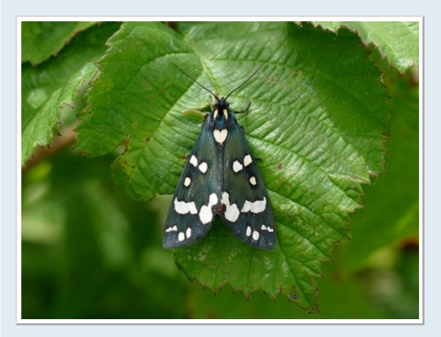
I've got more, but I'll leave them for another time! 😃