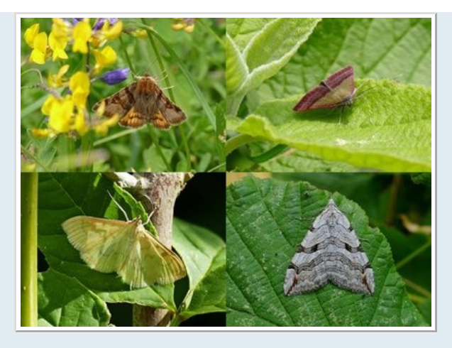
Small Purple and Gold (Mint Moth).