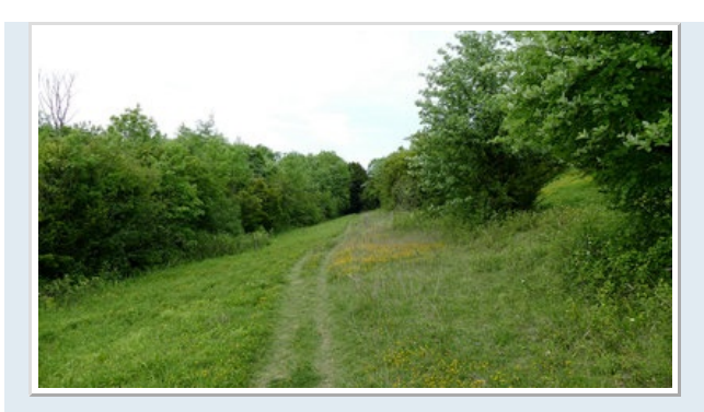
I've seen 17 species at this site, including Large White, Speckled Wood, Common Blue and Brown Argus.