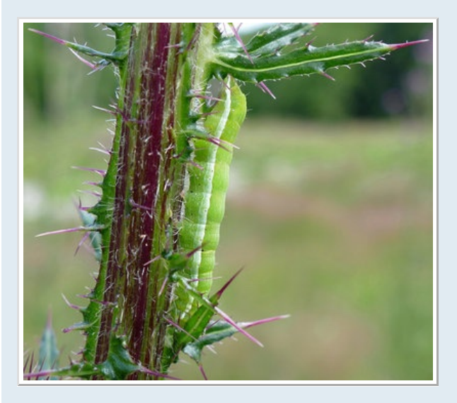
Comma, Meadow Brown, unknown White and some moths and dragonflies also seen before the end of a very enjoyable day. With the SWF as a highlight.

I returned in May this year with the hope of seeing some Pearl-bordered Fritillaries.