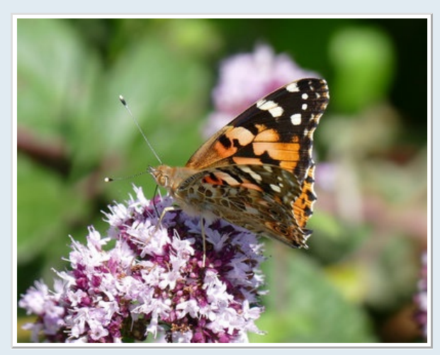
One of the first times I went out just to try and see and photograph butterflies. Large(?) White, Brimstone and Painted Lady, taken at Polhill Bank Nature Reserve in the Darent Valley north of Sevenoaks Kent.

For those interested the camera's used were..