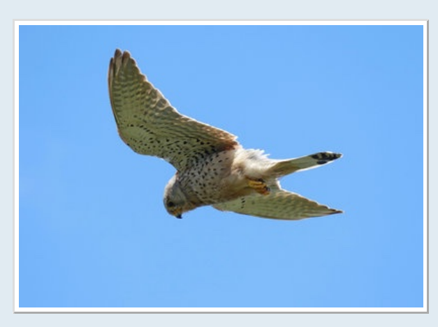
You can sometimes get a view level with or above them, as they hunt the slopes below.