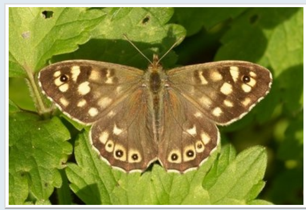
speckled wood (large numbers)

Early morning visit shows there is none in lower ground. But it took about an hour have in invasion of speckled woods. This species seems quite in large numbers again in this area. The surprise of the day is a tiny Orange Tip, very very tiny compared to those I saw in May 2016 by Nightingale valley (bs4), less two miles down the road, or the two I saw on Avon river banks in Saint Philip's Causeway (bs4) further down on April 15th 2017.