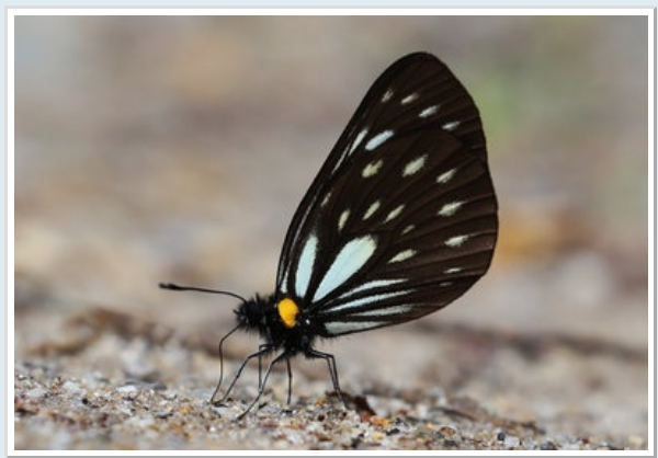
Great Blackvein, Aporia agathon, uncommon species at this altitude of 2400 masl