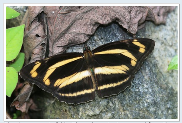
Phaedyma aspasia falda. This subspecies is reported from Bhutan.