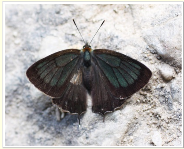
Dull Green Hairstreak UP.

The undersides are especially attractive too: