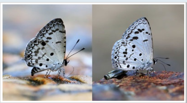
Malayan (left) and Common hedge Blue

have concluded my trip. Rain was a BIG problem. I did manage to photographs some butterflies. here are some of them and will keep posting more from the trip after some little cropping and all.