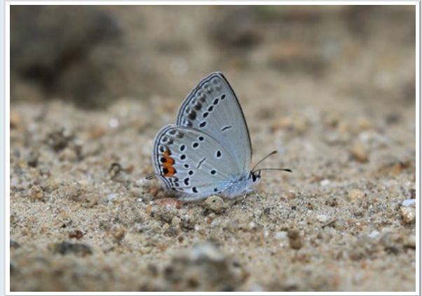
Everes huegelii huegelii_Dusky Blue Cupid, UN