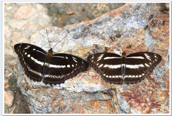
Studded Sergeant and Bhutan Sergeant together