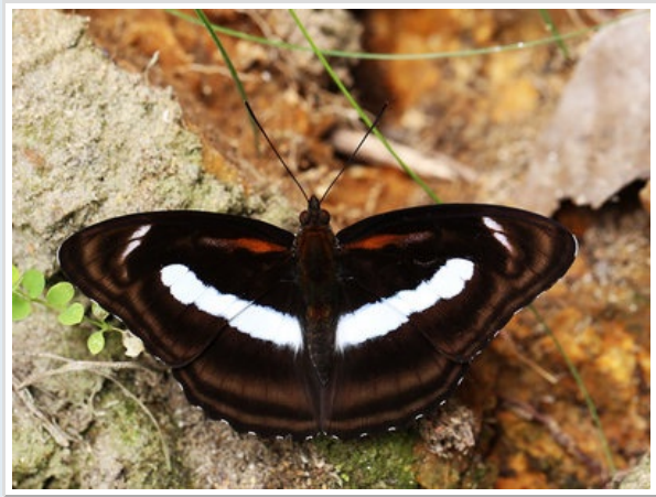
Small Staff Sergeant