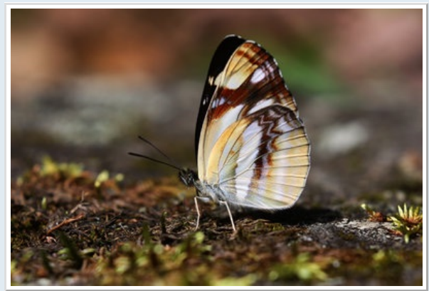
Neptis armandia melba, Variegated Sailer, UN