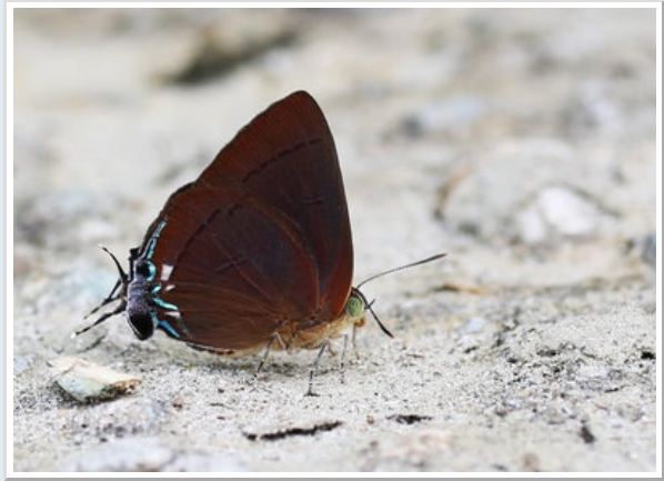
Chocolate Royal (Remelana jangala)