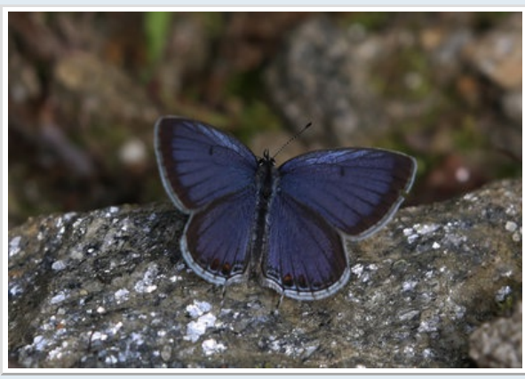
Everes huegelii huegelii_Dusky Blue Cupid, UP

Some more pics from the trip. Hope you all like it!!!