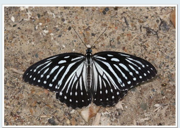
Penthema lisarda_Yellow Kaiser