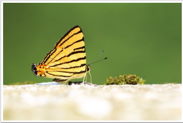
Striped Punch (Dodona adonira) UN