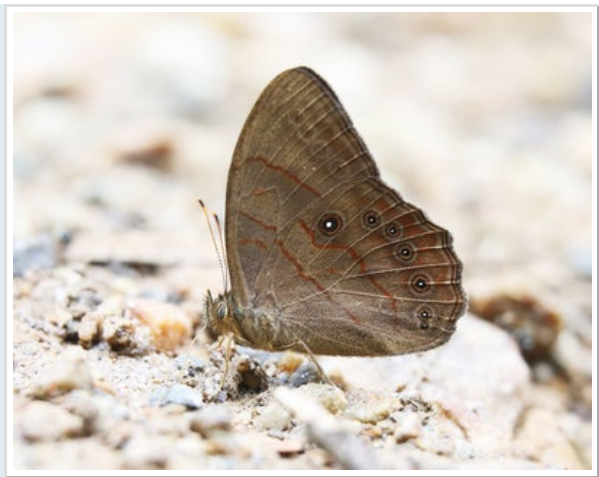
lethe gulnihal_Dull Forester