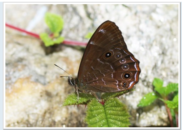
Common Woodbrown (Lethe sidonis)