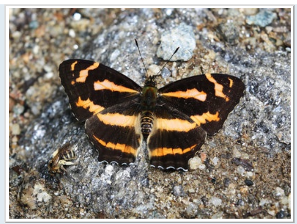
Symbrenthia niphanda, Blue-tailed Jester, UP