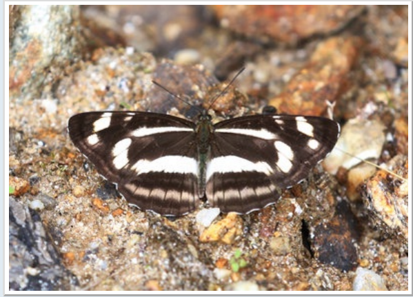
Hockey Sticksailer, Neptis nycteus, rare at this altitude