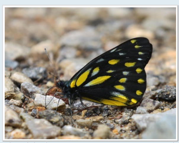
Pale Jezebel, Delias sanaca, A very common species in June end – July