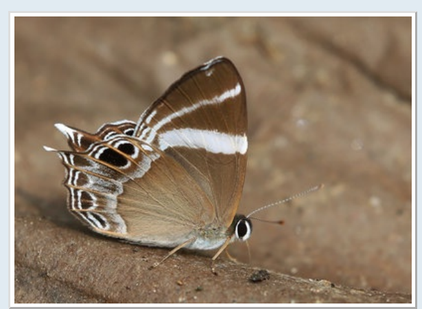
Abisara chela_Spot Judy