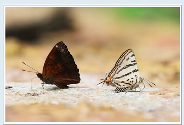
Spindasis rukmini Khaki Silverline