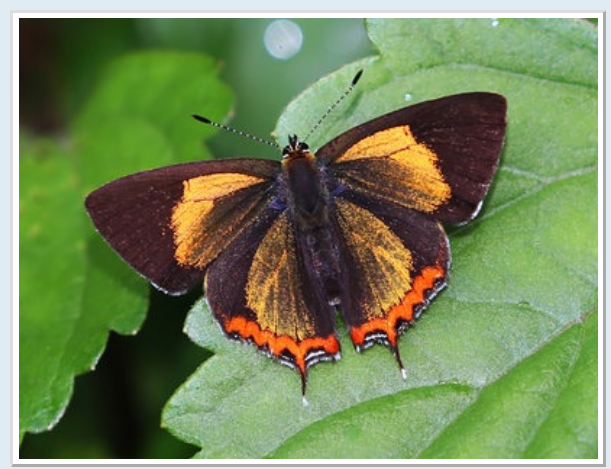
Golden Sapphire (Heliophorus brahma)