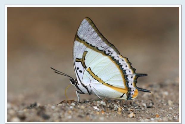
POlyura eudamippus_Great Nawab