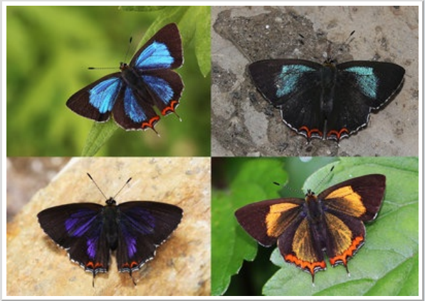
Sapphires from Bhutan