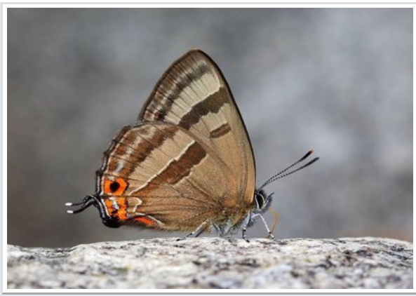
Dull Green Hairstreak UN. Posted earlier also.