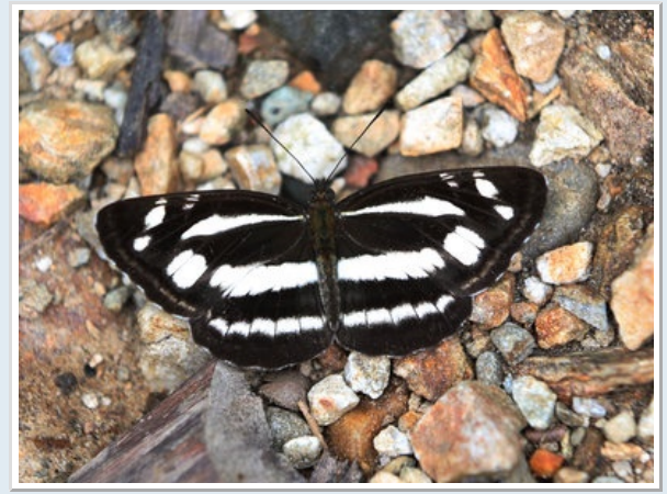
Neptis armandia melba, Variegated Sailer, UP