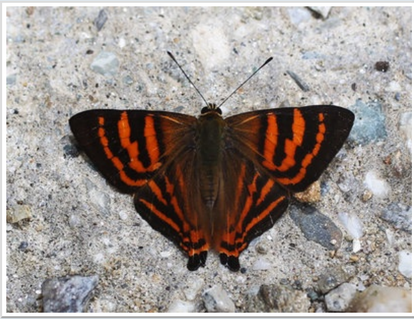
Striped Punch (Dodona adonira) UP