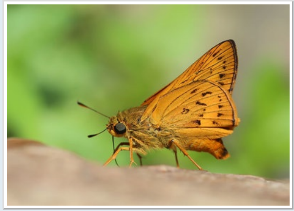
Plain Plum Dart