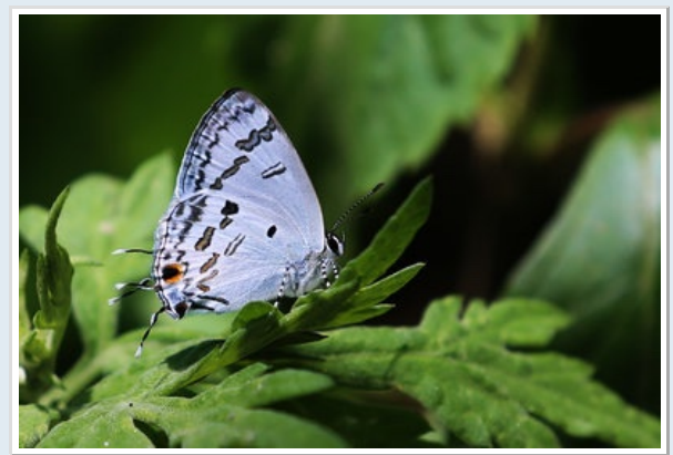
Blue tit (Chliaria kina)