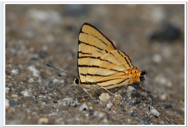
Dodona adonira_Striped Punch