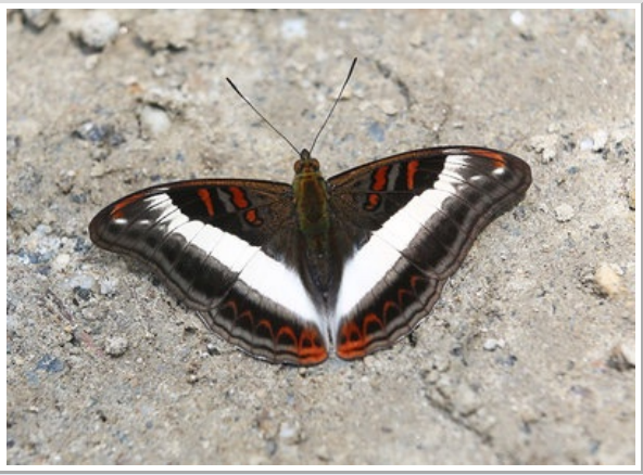
Parasarpa dudu_White Commodore