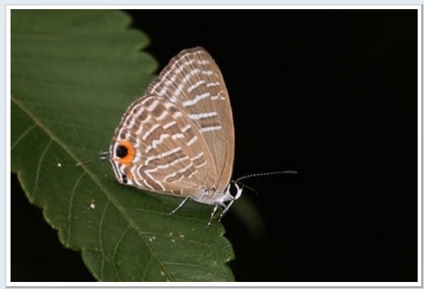
Metallic Cerulean (Jamides alecto)