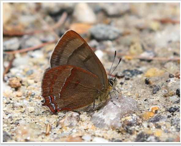
Indian Purple hairstreak, Iwaseozephyrus mandara ssp. irma (Evans, 1925). Uncommon species.