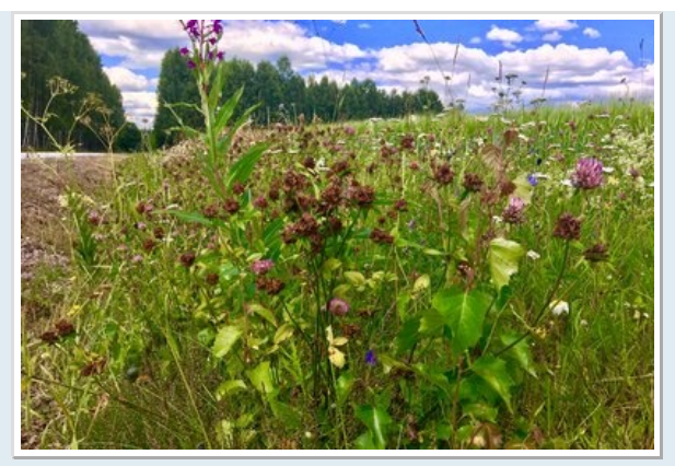
"Grass Verge including clover beside arable field"