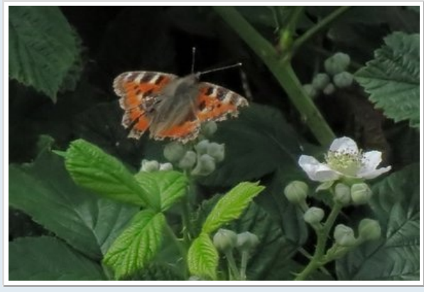
Overwintered Female Small Tortoiseshell 2nd June 2017