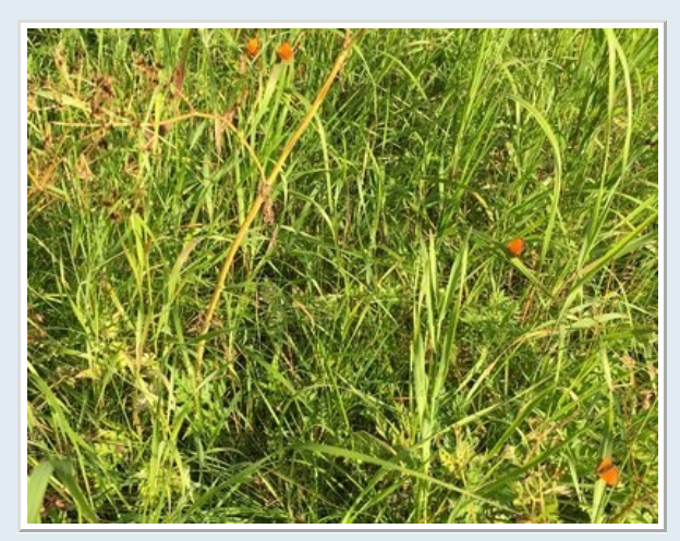
"Four Scarce Coppers and a Ringlet" (thanks Guy).