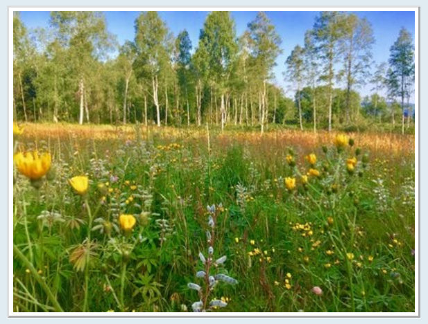
"Wild Flower Meadow (Silver Birch in background)."