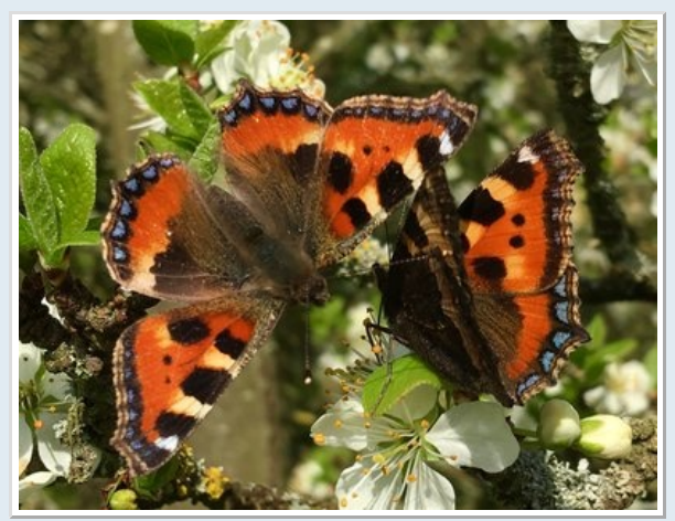
March Small Tortoiseshells

I regularly see Small Torts on Blackthorn blossom.