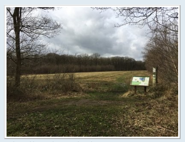
Little Scrubbs Meadow- March 14th