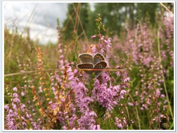
"A species that is a blue"

(which is possibly expensive uploading pics when not on wifi)"