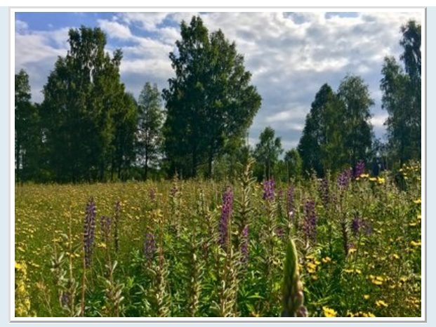
"Loopins going to seed in Wild Flower Meadow. Aspen (poplar type) in background