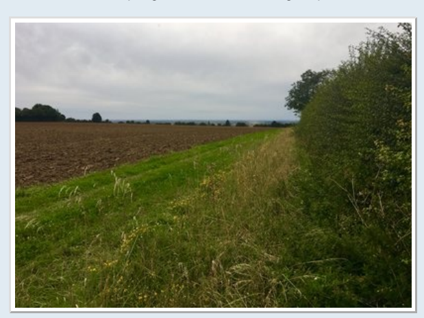
20th August. A nice hedge boundary precident near to a Lottery funded Wild Flower Meadow in Navenby, Lincolnshire. #Common Blue