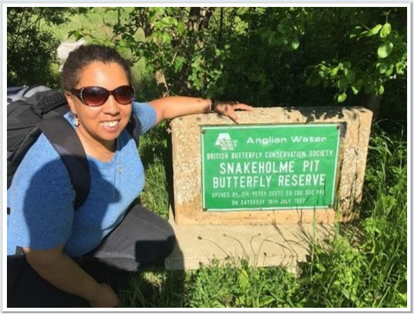
British Butterfly Conservation Society. 1987