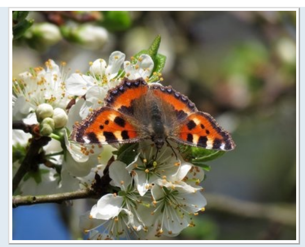
Small Tortoiseshell on Fruit Tree Blossom