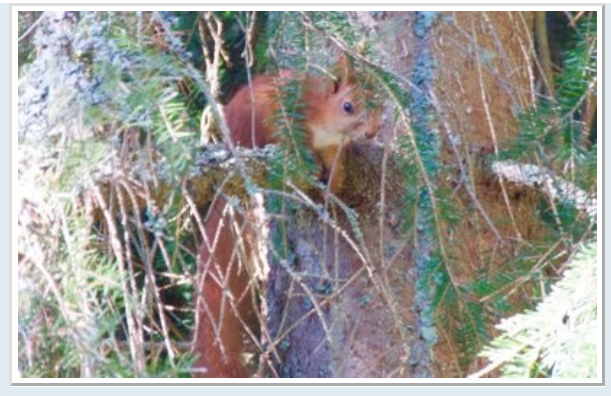
22nd July, Värmland, Sweden Red Squirrel video link: <u>https://youtu.be/eeCc72C8Jbo</u>