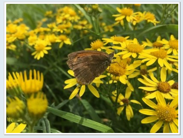
Gate Keeper (Hedge Brown) "Hanger On"