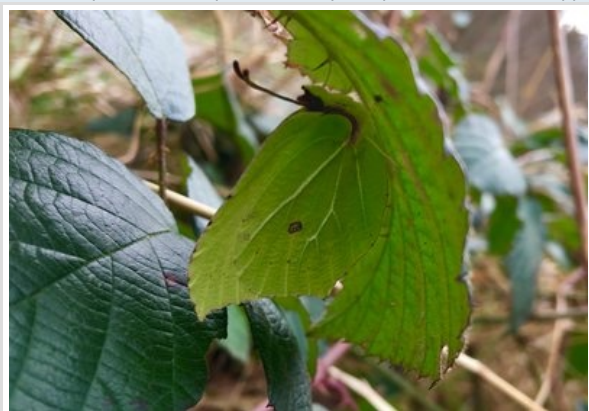
Male Brimstone under Bramble Leaf

On Tuesday, for the best part of the day, temperatures did reach approx. 15c for a short time.