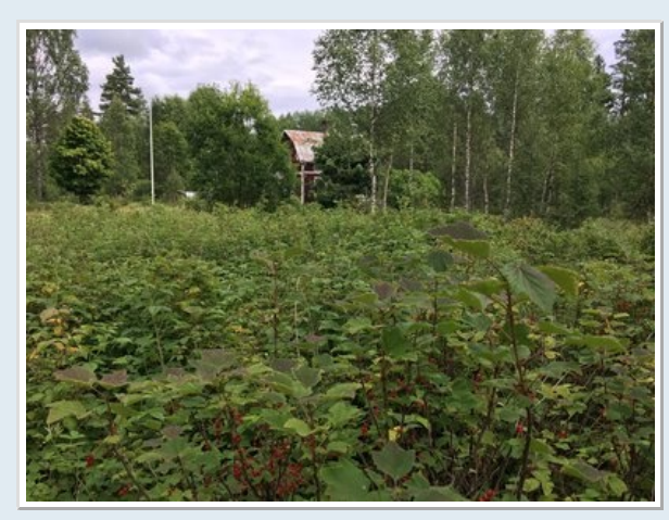
"Red currents & Wild Raspberry Surplus"