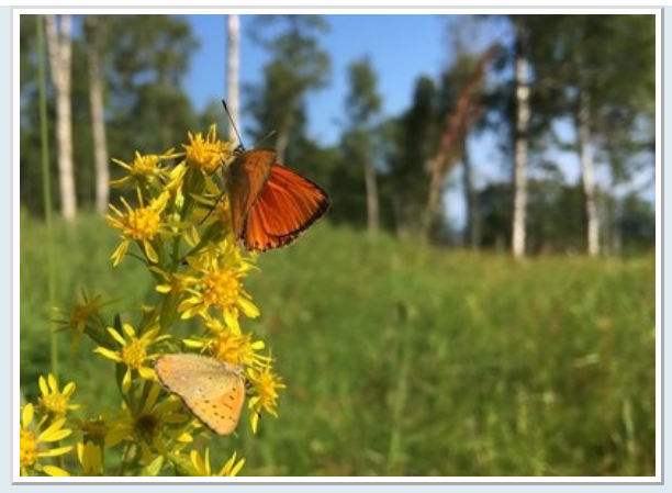
"A species that was common in the last week"