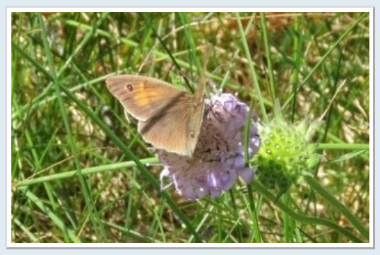
"Looked similar to the UK species of Meadow Brown"