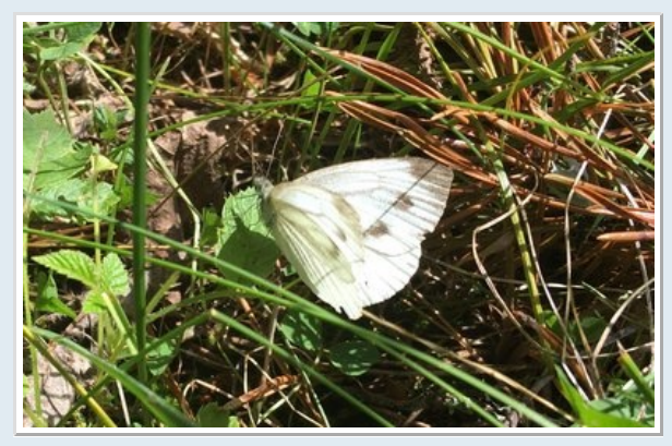
"A species that is a Green-veined White"