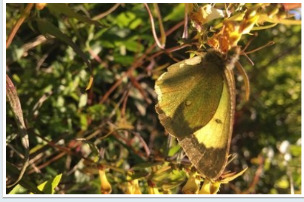
"Moorland Clouded Yellow (thanks for the id, Guy. Aa species that could look a bit like a UK pale clouded yellow)"