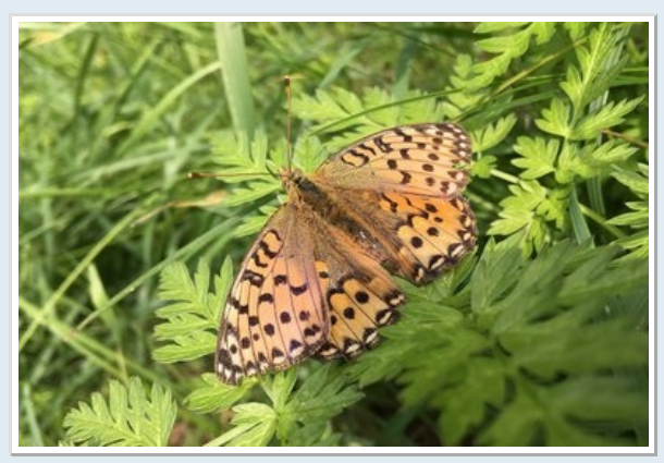
Could look a bit like a UK pale, female, Dark Green Fritillary) Klarälven Valley. 3rd August 2017

Klarälven Valley, Hagfors district, Värmland, Sweden