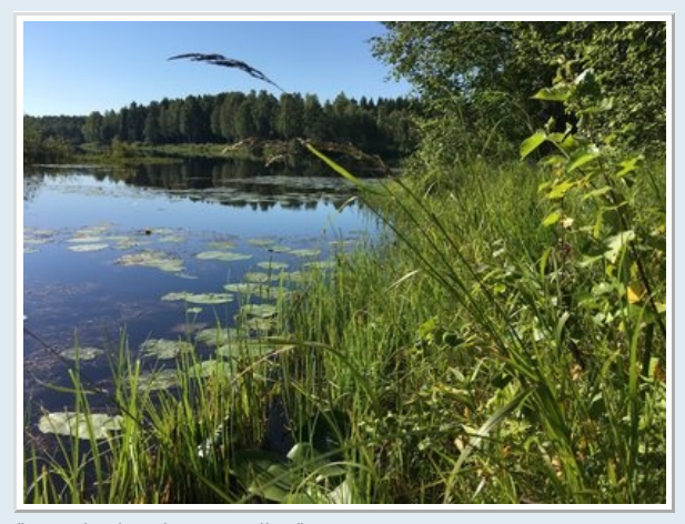
"Grass bank with some Willow"