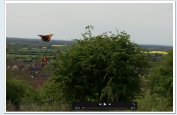
The Tortoiseshell remains above the Peacock

Looking at this activity, I am assuming this is a male Small Tortoiseshell & female Peacock but I might well be wrong. The Tortoiseshell looks as if it might be mobbing the Peacock, harassing it a little or looking for a partner? Comments welcome as I am still learning. Here are a couple of screenshots taken from the video: