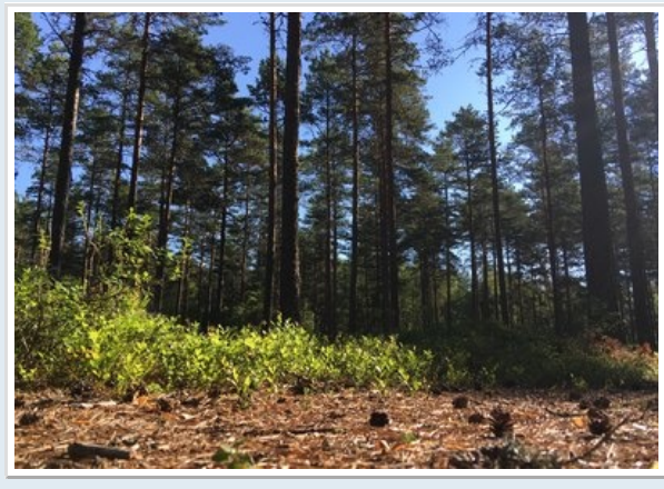
"Pine Cones & Fruiting Blueberry Plants"