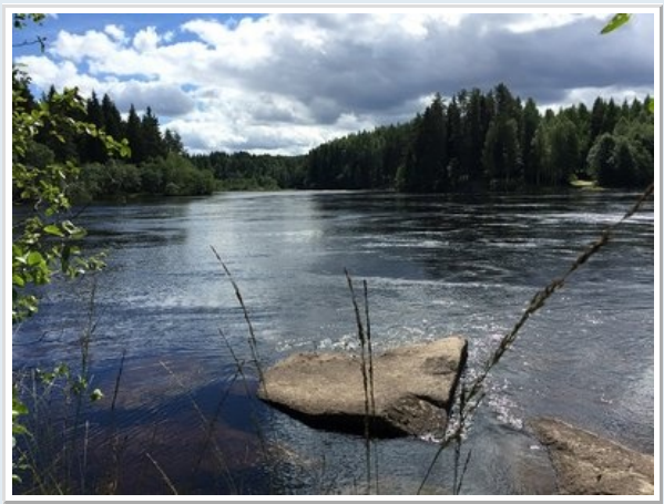
31st July Klarälven River, Hagfors District