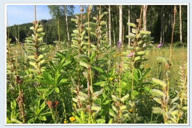
"A species that is a Small Tortoiseshell"