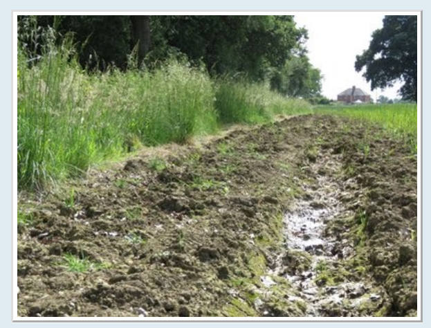
Arable field boundary edge to Old Wood, Skellingthorpe.