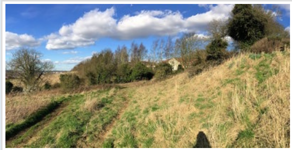
Bracebridge Heath, Lincolnshire

The pano shows a few daffodils and snow drops near the top of the bank (near to more nectar rich back gardens), a few trees starting to blossom and an ivy clad hedgerow which probably is inviting for some hibernators.