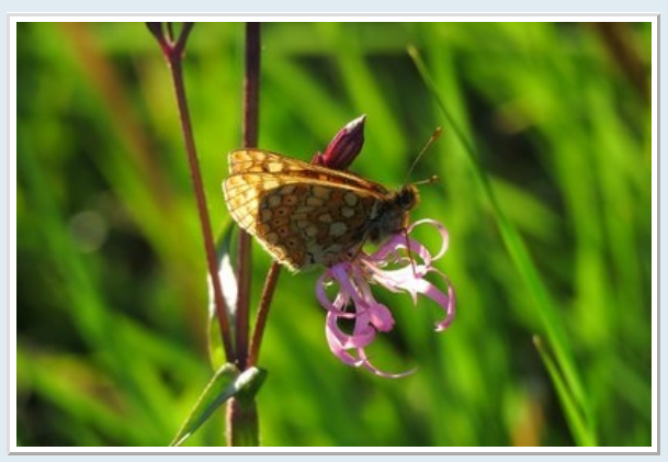
Canon PowerShot SX60 HS

Here are three pictures taken on 23rd May at Chambers Farm Wood. The Marsh Fritillary was roosting on "Ragged-Robin".