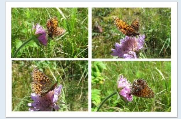
"Looked like a female UK Small Peal Bordered Fritillary but with larger darker patches on it's wings."

"This species of Burnet Moth looked familiar"