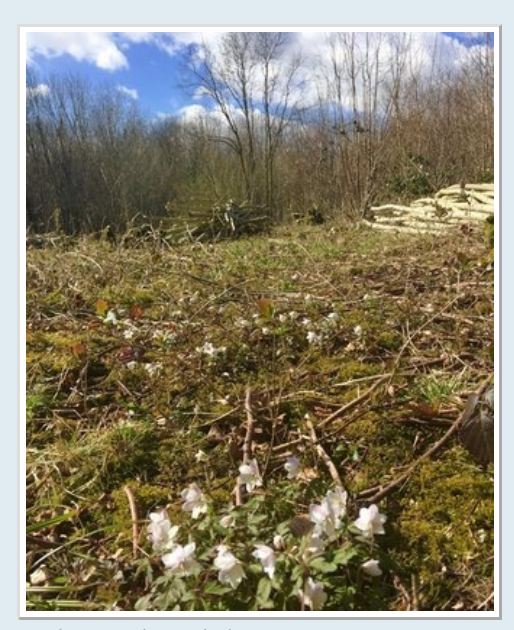
Southrey Wood, Lincolnshire