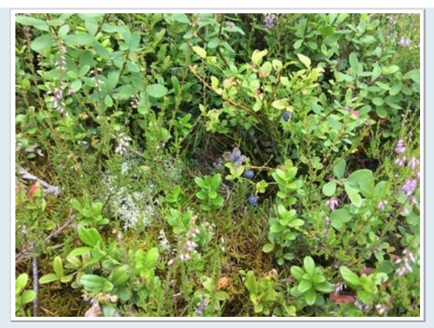
"A smaller blue butterfly – Wild Blueberry size comparison" "On spaced Pineland Edge. Heather (full sun- Sandy soil) Blueberry (Greener and fruits better in partial shade)."