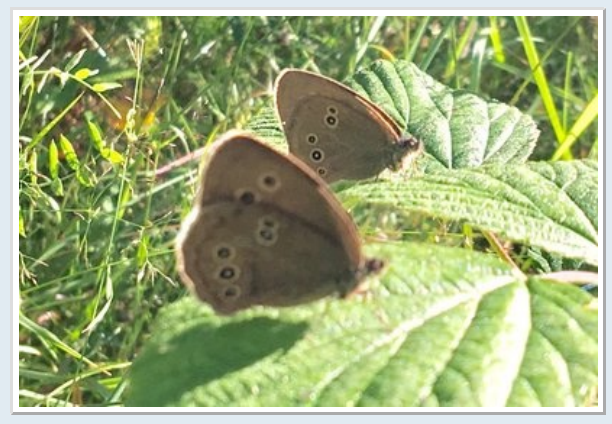
"A species that is a Ringlet"