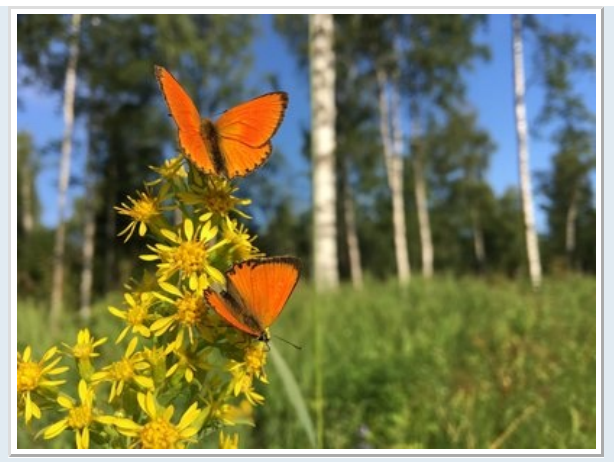
"WSGW or Scarce Copper (which was scarce at one time for an Englishman)".