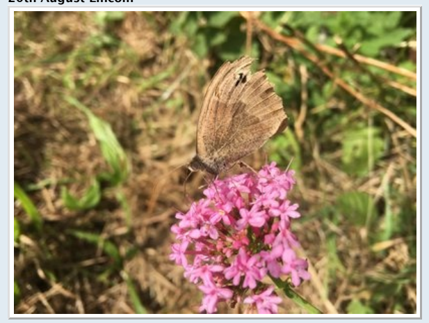
Meadow Brown "Hanger on"

Regarding the male Brimstone, I have assumed that butter was originally more of a golden yellow colour, rather than paler, more healthy similar spreads found today (please see above video). #Buttercup #Butterfly 20th August Lincoln