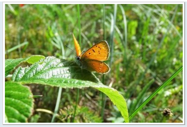
"A Scarce Copper - (Thanks for the ID, Guy)"