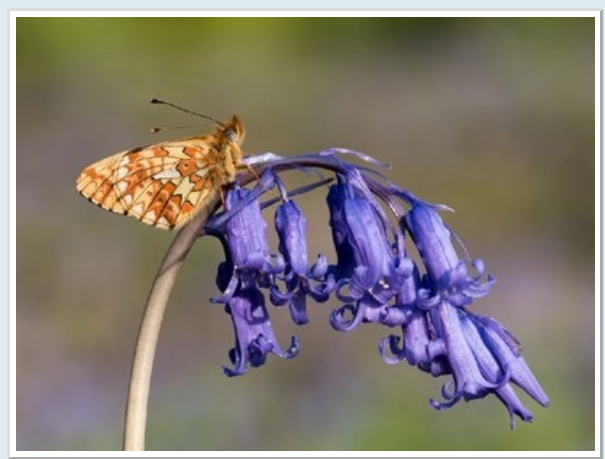
Thanks for looking,