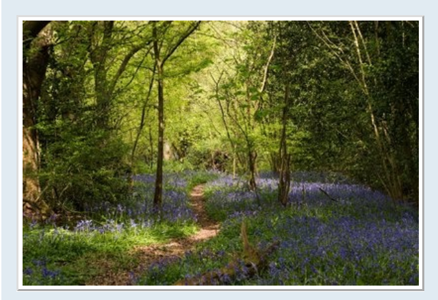
On the way to see the Pearls I saw a male Orange Tip.

As I entered the forest the Bluebells were looking wonderful I couldn't resist a quick shot.