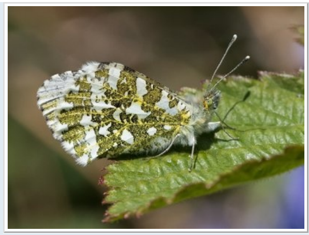
And it was nice to see the numbers of Green Veined Whites increasing locally at last.