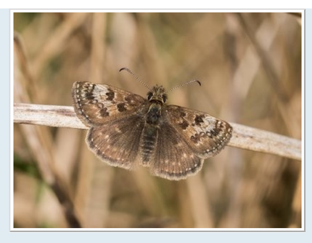
By now it was late afternoon and the Dingy was starting to look for places to roost.