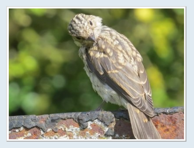
Perseverance pays off!

Quite a few species across the board are being added to the Threatened List in the UK, butterflies in particular. Birdwise, in my local area we have lost Willow Tit, Marsh Tit, Yellowhammer and Yellow Wagtail, although the latter has started re-appearing in small numbers. So it is nice to see that one threatened species, Spotted Flycatcher, is appearing more frequently. Now I expect to see them annually at some sites in the summer and on passage in the autumn; and this year I had family groups at two different spots on the same day during the autumn return passage