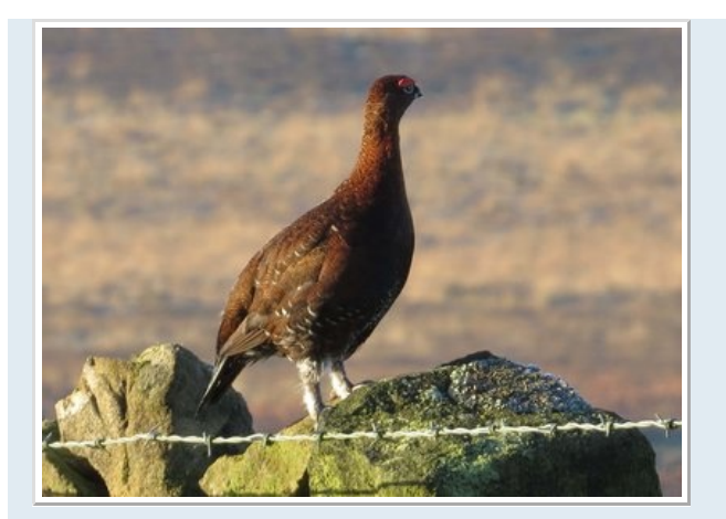
Retain a sense of humour!