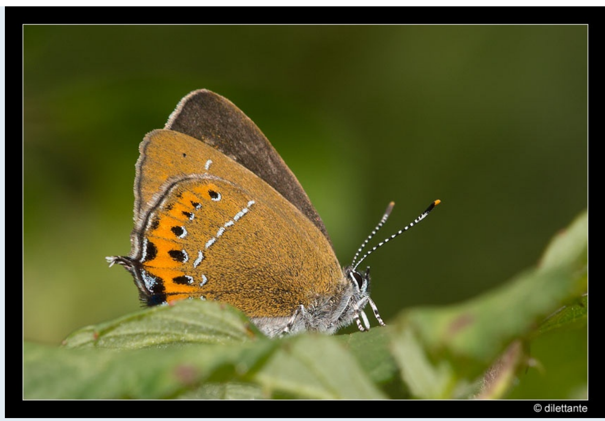
Black Hairstreak, Monk's Wood, Cambs, 10-Jun-2017