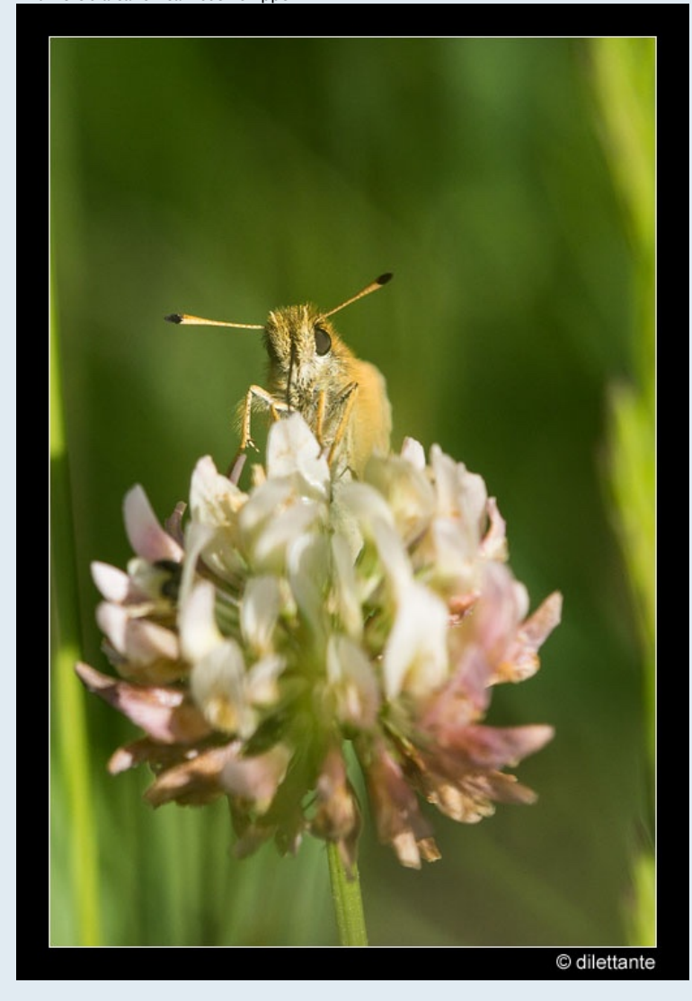
And here's a canonical Essex Skipper