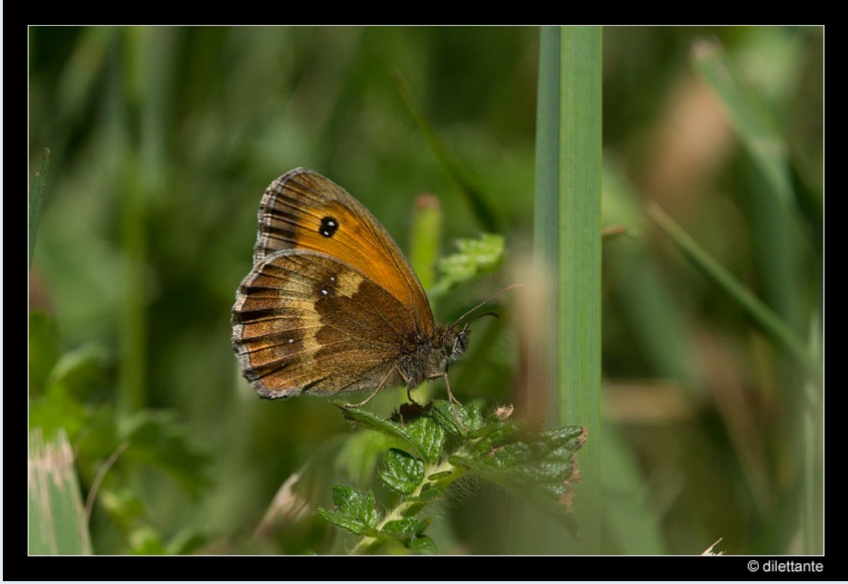
Gatekeeper, Therfield Heath, Herts, 2-Jul-2017

Sunday 2nd July 2017 A trip to Therfield Heath to get my fix of Summer butterflies didn't disappoint: Marbled White, a few Chalkhill Blues, a handful of Dark Green Fritillaries, plus Ringlet, Meadow Brown, Gatekeeper, Small Skipper, Brimstone, Large White, Small White, Comma, Small Tortoiseshell.