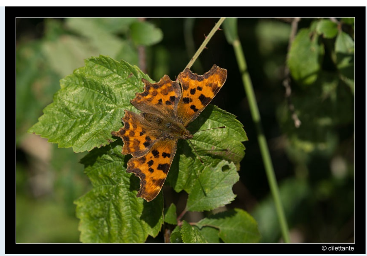
Comma, Eversden, Cambs, 2-Jul-2017