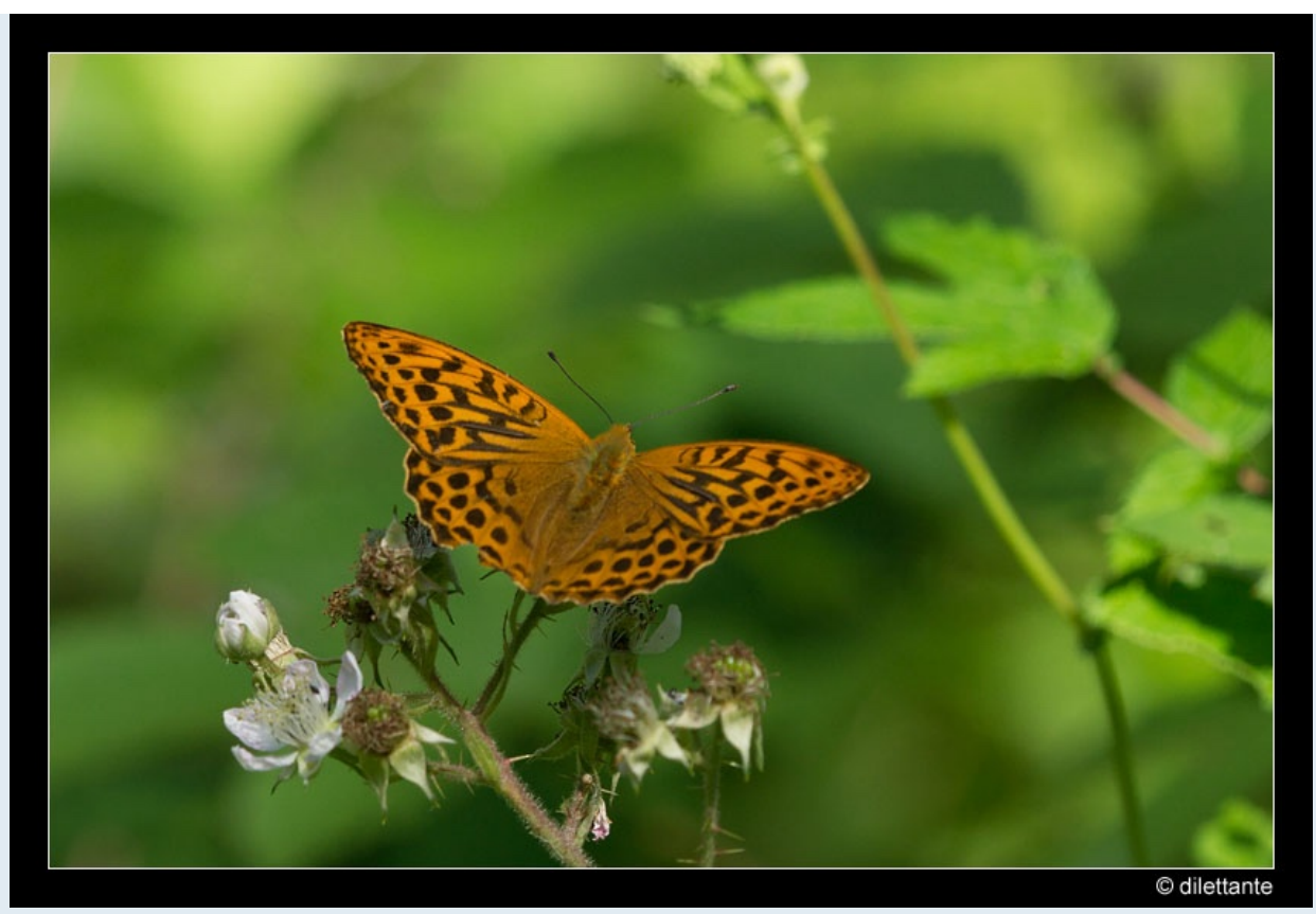
Silver-washed Fritillary, Eversden, Cambs, 2-Jul-2017