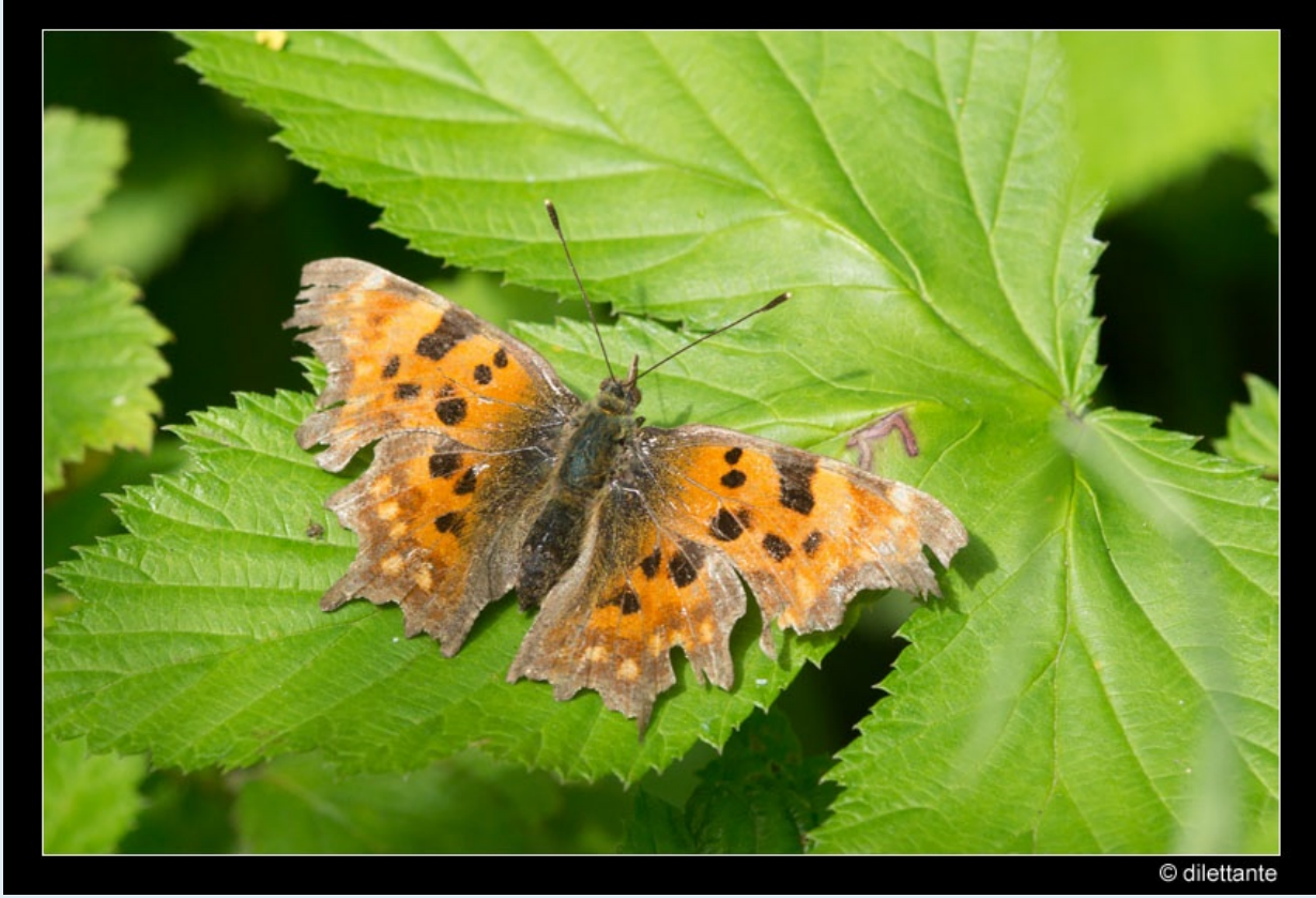
Comma, Monk's Wood, Cambs, 10-Jun-2017

I also saw my first Ringlet of the year - beautifully fresh and chocolatey velvet, but unfortunately no photo. And as someone else reported seeing a fresh Comma, I saw this one which I like to think is its mother :-)