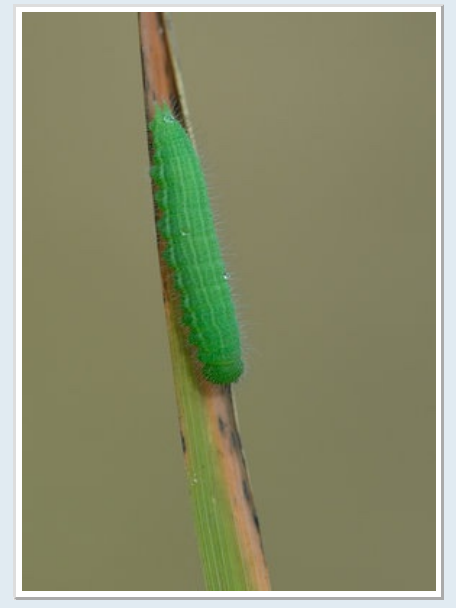
Wall Brown larva. 4/2/2017.