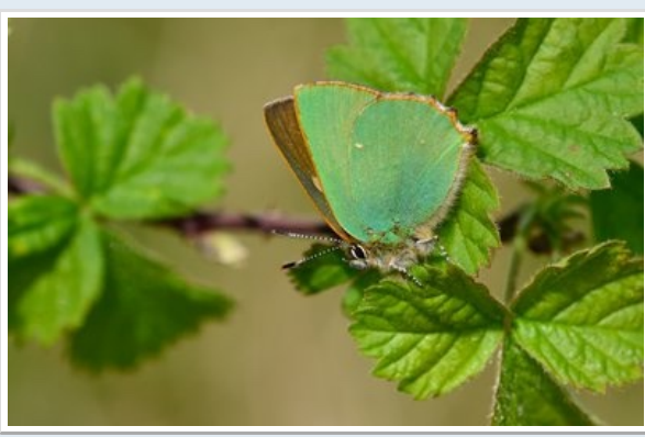
Male Green Hairstreak

Yesterday I found a Green Hairstreak that proved he was a male as he showed enough of the upper-wing to show off his sex brand. I've seen several show some upper-wing but never this much.