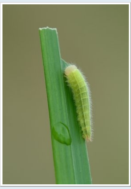
Marbled White larva

Firstly a very young Marbled White larva found whilst looking for the Wall larva.