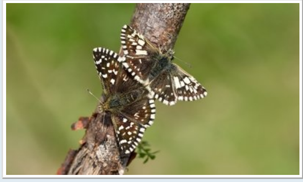
Grizzled Skipper pair. Male ab. taras

Then, on Saturday while doing a butterfly survey in a private woodland I came across a pair of Grizzled Skipper making some 2018 butterflies!! An added bonus was the male Grizzly being a fine taras.