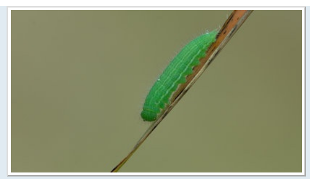
Wall Brown larva. 4/2/2017.