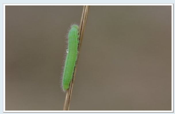
Wall Brown larva. 2/2/2017.