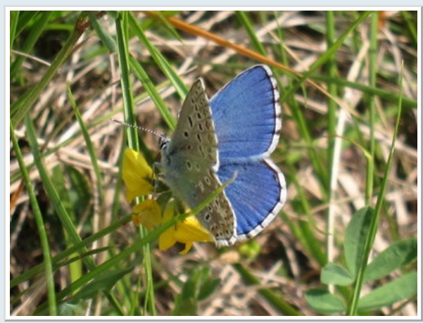
Also seen these two days were Spanish Festoons,

Today I saw, and photographed, my first Adonis Blue (#35) of the year.