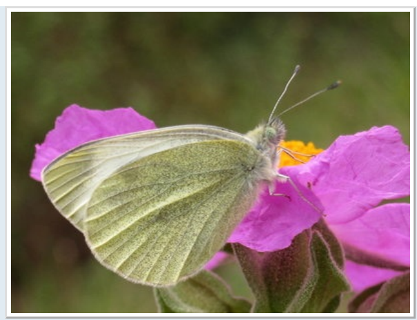
There were also several Wall Browns, a couple of Brimstones, Berger's Clouded Yellows and Orange-tips, and a Green Hairstreak. -Colin