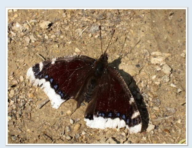
I stayed with it for 15 or so minutes during which time it swooped down at high speed and touched the top of my head on two occasions. On the ground it stayed mainly with its wings closed, which was a pity, but did open them now and then.