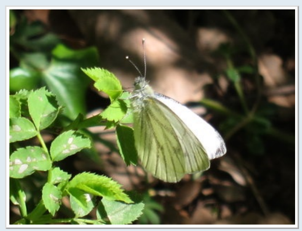
Small White (#18) (though I won't argue if someone says it's something else):