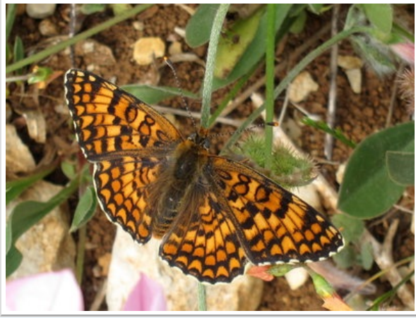
and a couple of Heath Fritillaries.