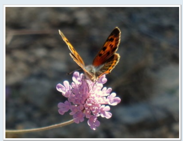
and some Meadow Browns.