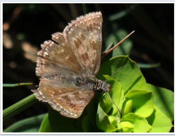
on thursday the first Meadow Brown (#38),

On wednesday the first Dingy Skipper (#37) of the year,