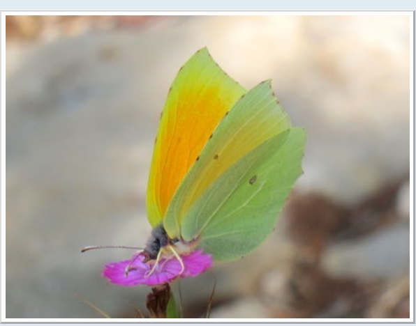
I also saw a couple of Silver-washed Fritillaries, a couple of Marbled Whites, a couple of Large Skippers, one or two Berger's Clouded Yellows, one Southern White Admiral, a few Meadow Browns, many Wall Browns and a few Wood Whites.