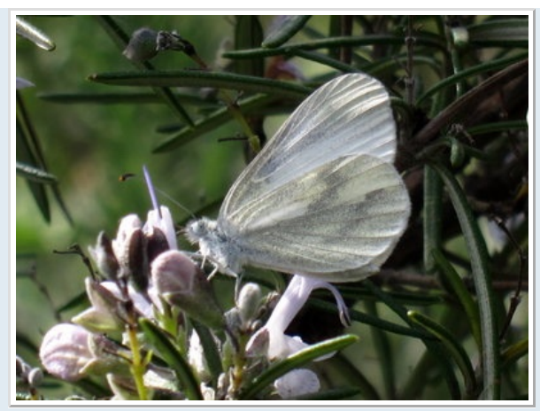
and Provence Orange-tip (#14) of the year. Isn't she cute!