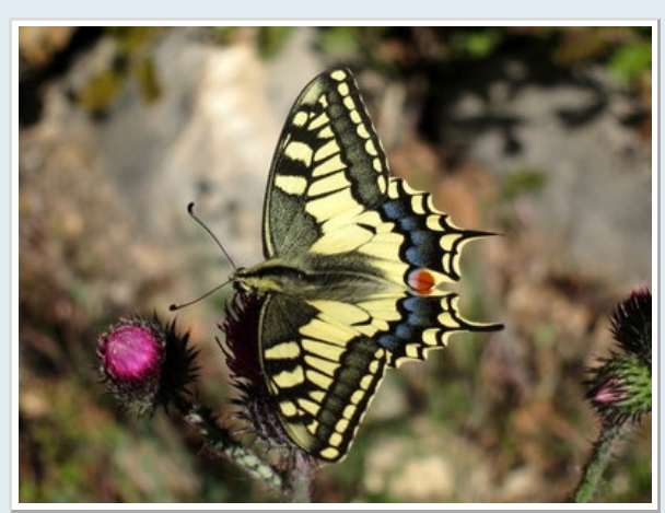
in the company of a Scarce Swallowtail, both in very good condition,