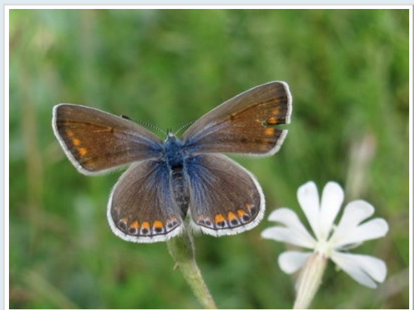
and Provence Chalkhill Blues, a few Knapweed Fritillaries,