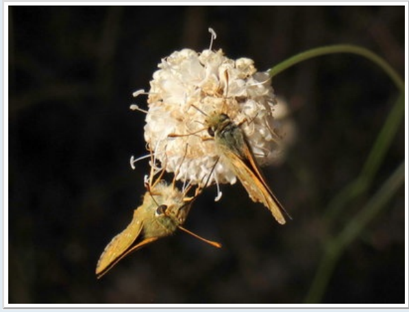
a couple of Adonis Blues, Heath Fritillaries and Tree Graylings (this one being a female),

I saw many Spotted Fritillaries, several Provence Chalkhill Blues, Weaver's Fritillaries, Meadow Browns and Silver-spotted Skippers (at one point there were three of them on this flower),