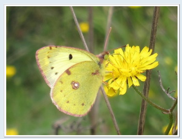
There were also many Orange-tips, both females and males,

This morning in the Parc de la Brague I saw my first Berger's Clouded Yellow (#28) of the year. In fact I saw perhaps ten or twelve of them. This one is a male.