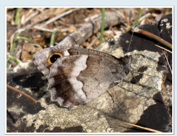
several Small Heaths,

I did however see one Tree Grayling (the first of the year #59),