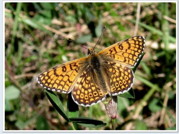
and a Weaver's Fritillary.