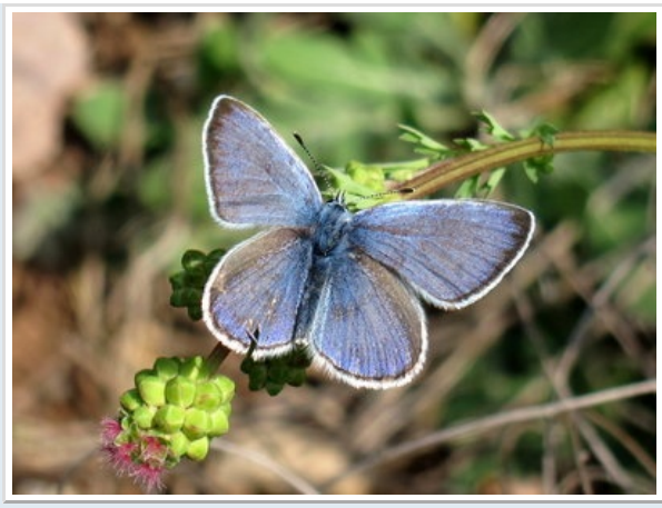
a Scarce Swallowtail, Orange-tips, Brimstones, Berger's Clouded Yellow, Wood Whites, Wall Browns, Speckled Woods, Common Blues and Small Heaths. -Colin