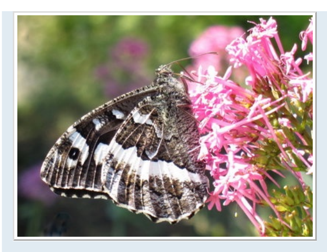
\ensuremath{[\text{EDIT}]}\xspace I saw the same specimen the following day, in camouflage mode: