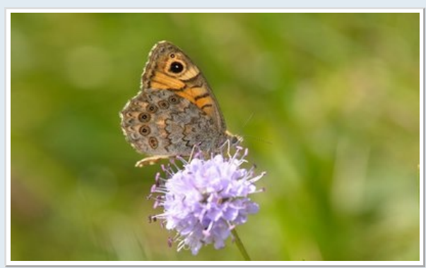
3rd brood female Wall Brown.

Shortly after another female was seen to fly into a scrape and appear to be looking to lay but nothing was found after she flew. This happened a few times until we saw one nectaring on Scabious, she then flew into a scrape and we saw the abdomen curl and almost saw the ova pop out. When fresh the ova has a green tinge to it, as shown in the photo.