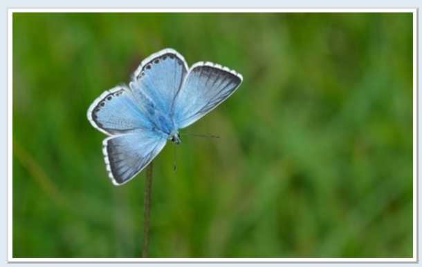
Male Chalkhill Blue.