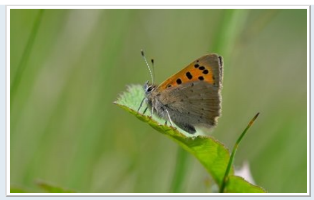
Small Copper ab. radiata.