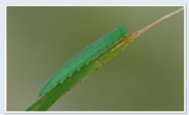
Wall Brown larva