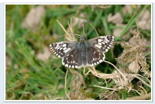
Grizzled Skipper ab.taras.