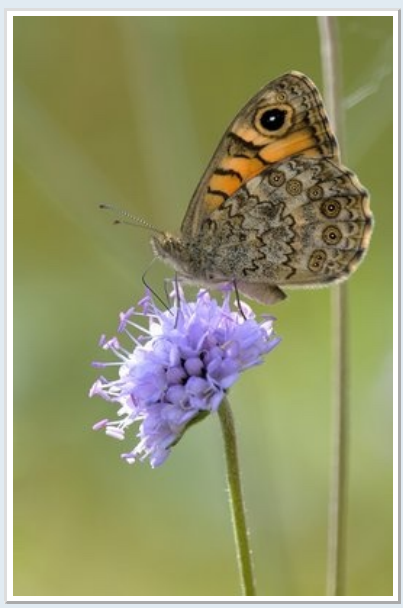
Female Wall Brown on Scabious.

With such a strong 3rd brood of Wall Brown showing locally I have spent a little time watching them over the past 2 days. Both days I also bumped into Trevor as well as Katrina yesterday. A hunt over a larger area yesterday produced at least 20 including 5 females. Today, a smaller area was covered with around 10 seen, all males today. Just a few photo opportunities with the best one being a female nectaring on Scabious. Many of them are already showing signs of wear but there are still a few gems too. It will be interesting to see if this becomes a widespread 3rd brood similar to 2014, or if it is confined to the Southerly slopes as is usual with a 3rd brood.