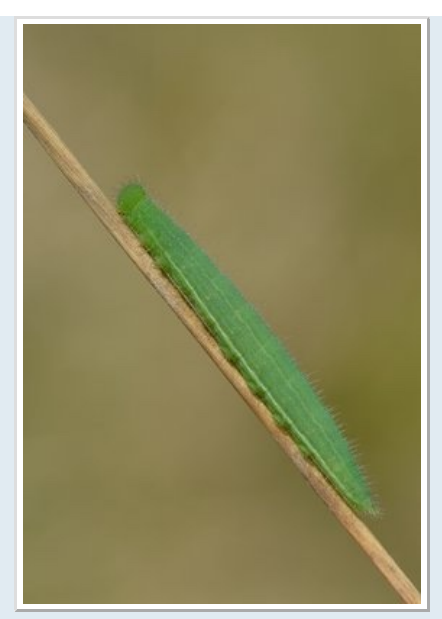
Wall Brown larva. Near fully grown. Resting following feeding.