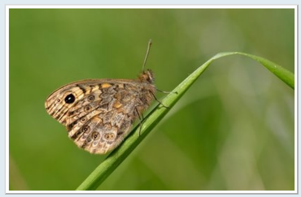
Male Wall Brown.