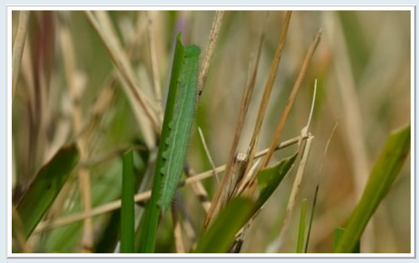
Wall Brown larva feeding. The smallest of todays larva. Approx 60% growth. Grass well nibbled in the area!!