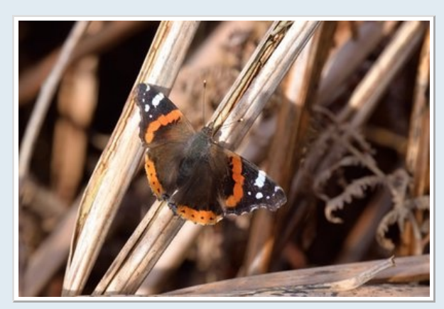
Red Admiral. Ashdown Forest. 13/1/2016 More on http://bobsbutterflies.blogspot.co.uk