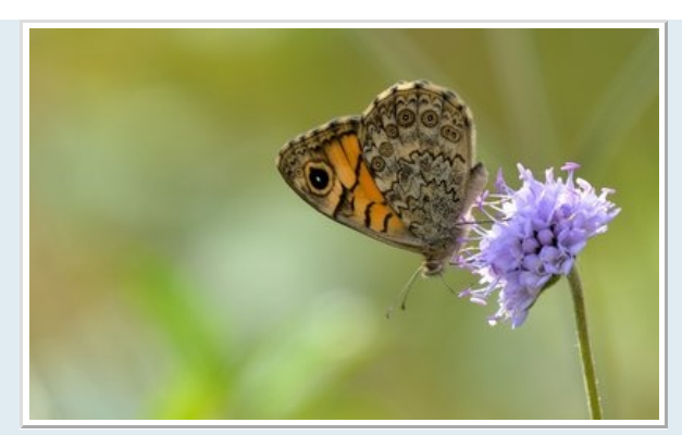
Female Wall Brown on Scabious.