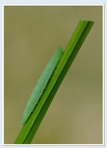
Wall Brown larva. Also near fully grown. On nibbled grass.