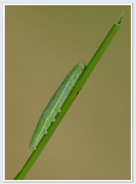
Wall Brown larva (2) 14/1/2016