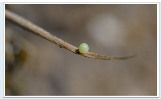
Wall Brown ova. 3 minutes old.

Following this we went searching for Long-tailed Blues. This was interrupted though when we bumped into Bugboy who showed us pictures of a juvenile Red-backed Shrike he had come across. We then concentrated on this very tame individual which was very approachable and which would fly right up to us if it saw a Bee near us. A magical experience and a great find by Bugboy.