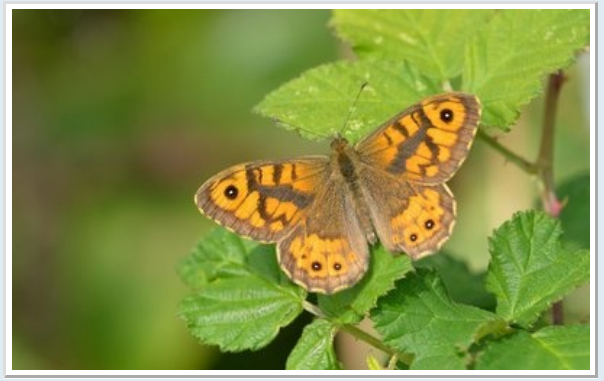
Male Wall Brown.

by Butterflysaurus rex, 19-Sep-16 05:02 PM GMT