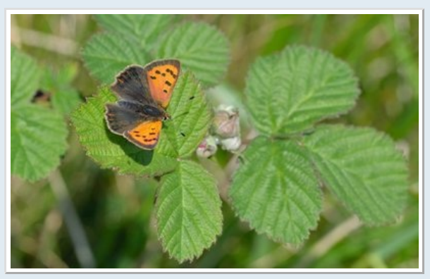
Small Copper ab. radiata.