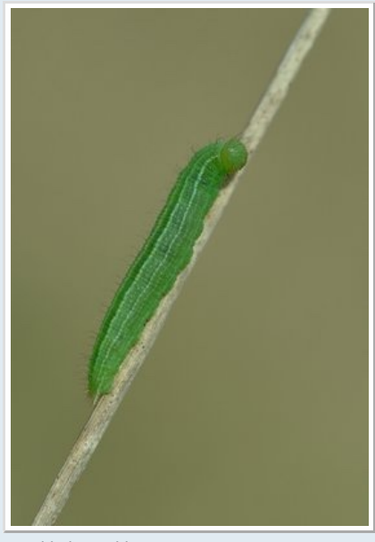
Speckled Wood larva.