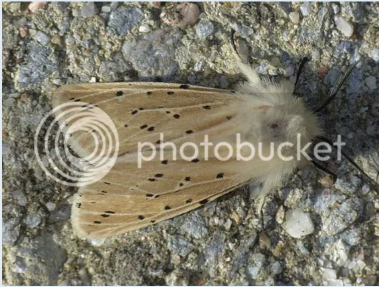
I am sure it's not a Buff Ermine, merely one of the Scottish forms of White Ermine.

In the trap, I get two forms of White Ermine moth - the usual vanilla white form and this buff version.