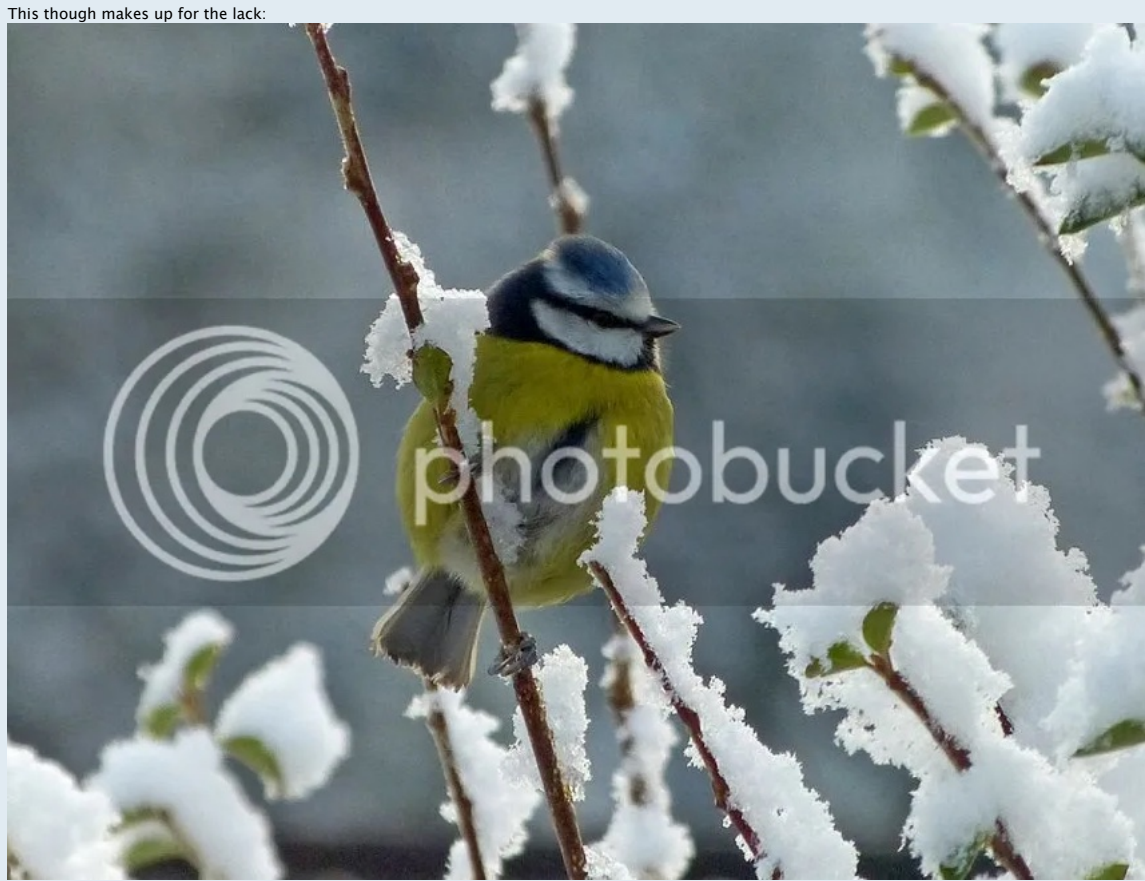
4 cms of the white stuff overnight.

....although Peacock reported last Sunday not far away.