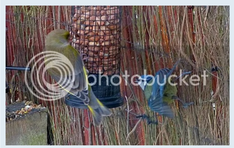
\label{lem:condition} \mbox{Action totally invisible to the naked eye. Pictures from 12 frames/second burst mode.}