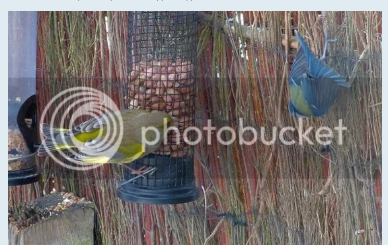
"Just you wait!"