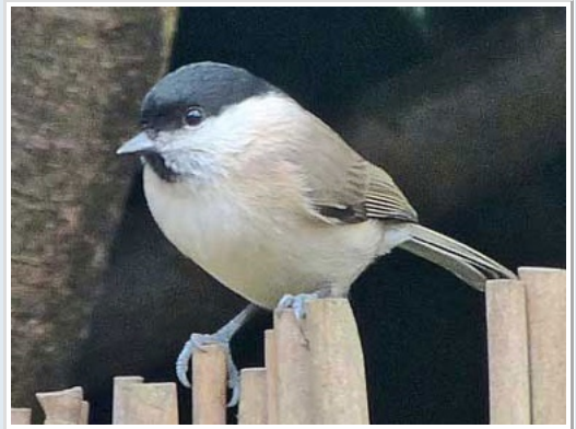
All taken from car (as hide) - Lumix FZ150

On the road again shortly heading further north via the foggy [Scotland] Central Belt