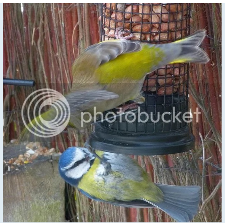
"I was here first so push off you little whippersnapper."