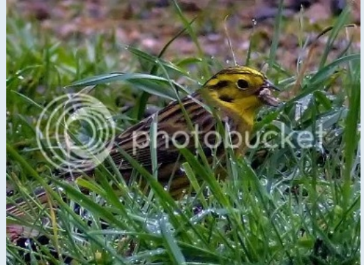
Yellow Bunting aka Yellowhammer.

But this was a nice "bedroom window" tick this morning - in the back garden.