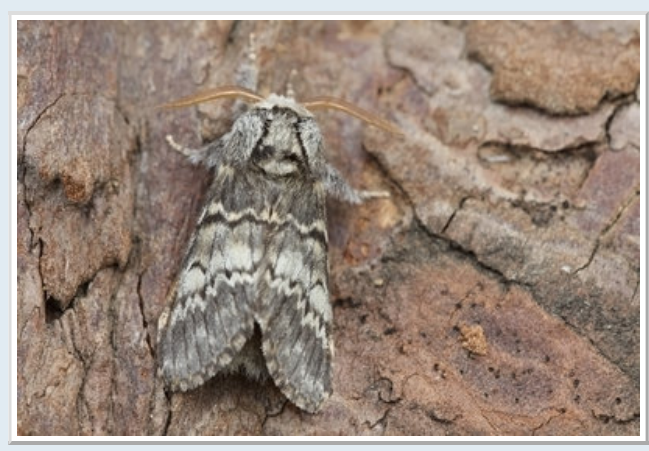
2015 - Lunar Marbled Brown (Drymonia ruficornis)