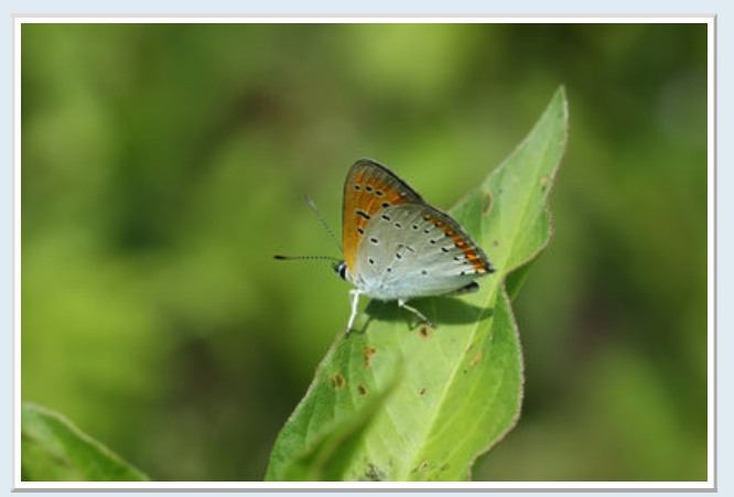
Large Copper - Lycaena dispar