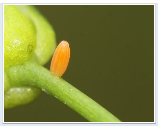
1553 - Orange Tip Ovum Cropped