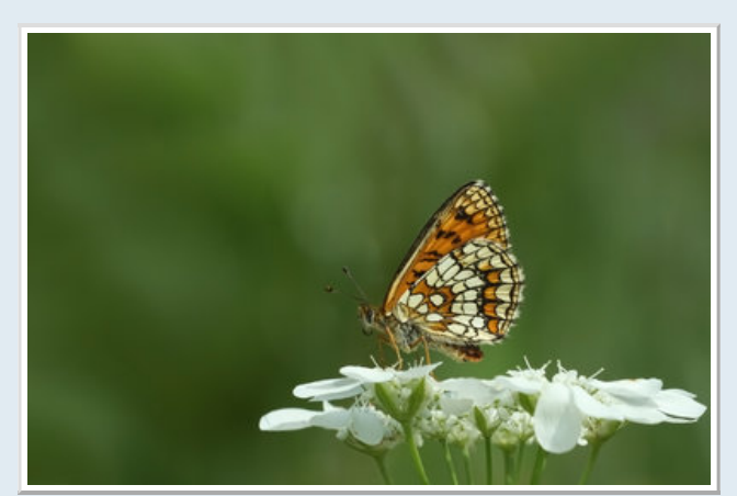
Heath Fritillary - Melitaea (Mellicta) athalia