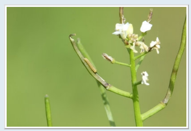
Orange Tip Larvae

Popped up to Magdalen Hill this morning and found a nice selection of insects plenty of small Blue around and a number of Common Blues, here is a selection of pictures and one that if anyone has thoughts on please shout I think it is a larvae case for a moth.