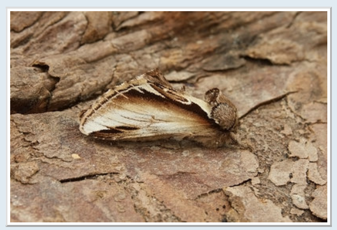
2006 - Lesser Swallow Prominent (Pheosia gnoma)