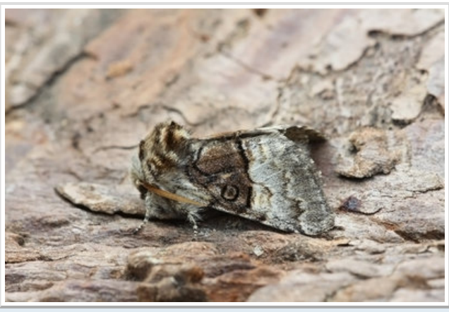
2425 - Nut-tree Tussock (Colocasia coryli)