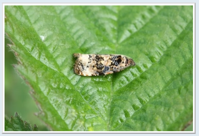
49.186 [BF 1097] Endothenia gentianaeana