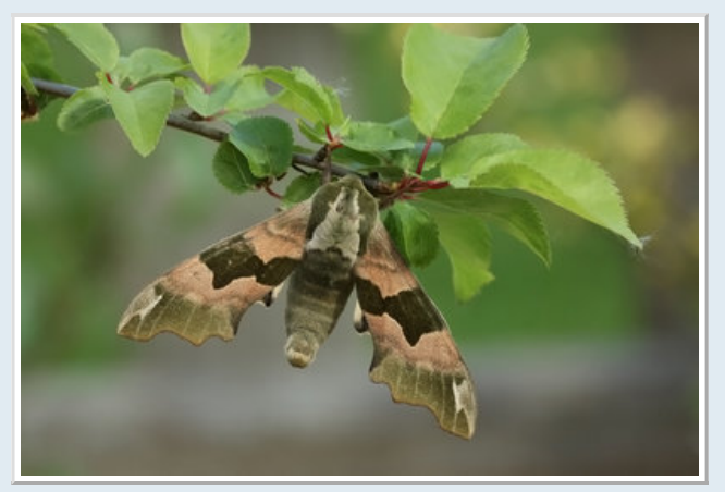
69.001 [BF 1979] Lime Hawk-moth (Mimas tiliae)