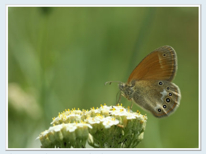
Chestnut Heath - Coenonympha glycerion