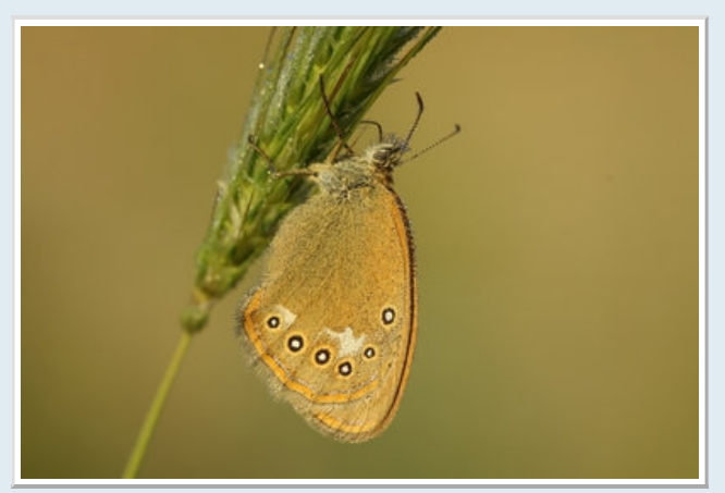
Chestnut Heath - Coenonympha glycerion