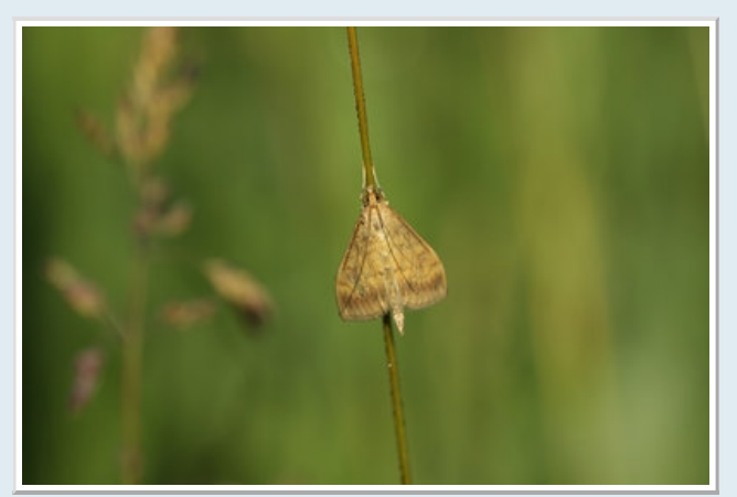
Maybe 63.028 [BF 1375] European Corn-borer (Ostrinia nubilalis)