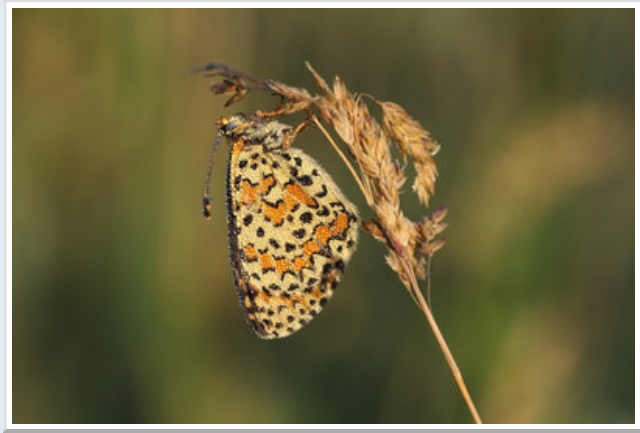
Lesser spotted fritillary - Melitaea trivia

Will also post selections of beetles/Larvae/Dragonflies and moths etc. many of which I will appreciate the help with so here goes with pictures from the same place (Day 2 Kamentsi village) very early morning around the accommodation before breakfast and moving to our next location.