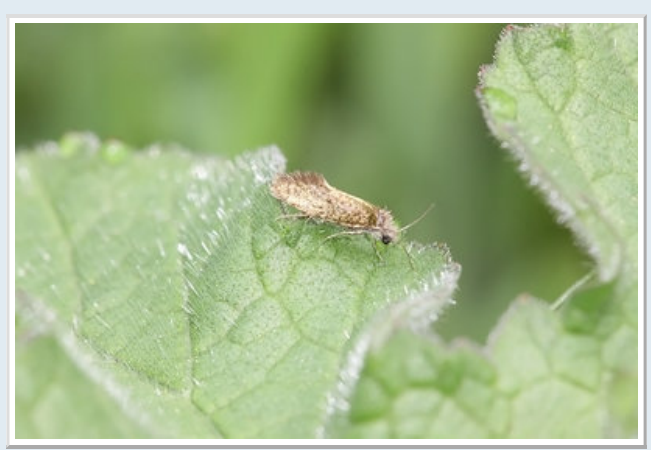
0006 - Dyseriocrania subpurpurella

Day of work today and after being inspired with Pauline's Silver-washed Frit Larvae decided to go out hunting with her to find another, luckily I found one after 10 minutes or so, here are some pictures from the day and a couple of Prominent's from the moth trap.