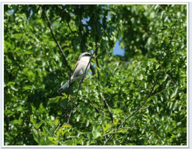
Red-backed shrike (Lanius collurio)