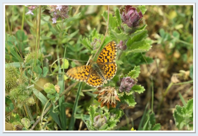
Violet (Weaver's) Fritillary Weaver's - Boloria (Clossiana) dia