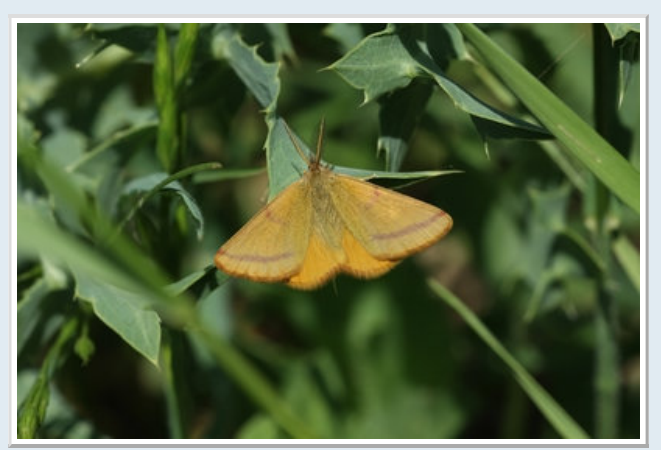
B0060 [BF 1717] Purple-barred Yellow (Lythria purpuraria)