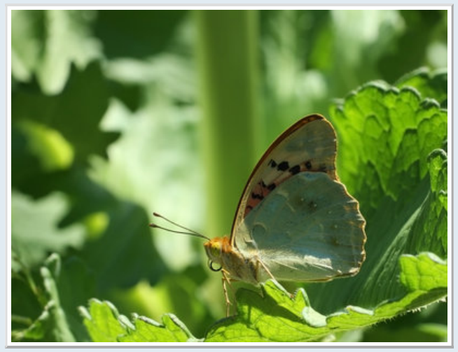
Cardinal - Argynnis pandora