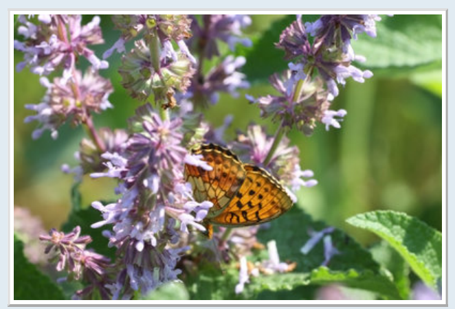
Marbled Fritillary – Brenthis daphne