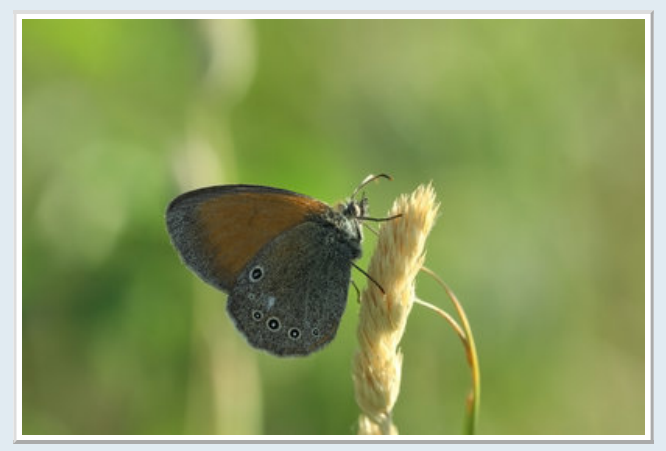
Chestnut Heath - Coenonympha glycerion