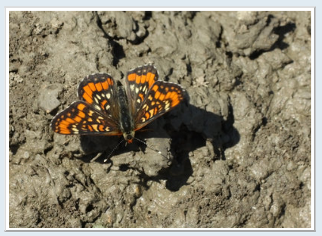
Scarce Fritillary -Hypodryas maturna Female

Here is our main target for Quarry for Day 2 in the Suha Reka Valley Scarce Fritillary -Hypodryas maturna, a stunning butterfly and here not so scarce but was a bit of trek to get to is location followed by a few other species also at the site.