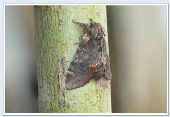
71.012 [BF 2000] Iron Prominent (Notodonta dromedarius)