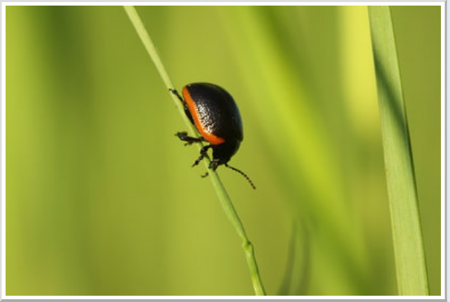
Chrysolina sanguinolenta (Linnaeus, 1758) [Toadflax Leaf Beetle]

Again a nice moth but unfortunately extinct in the UK since the 60's