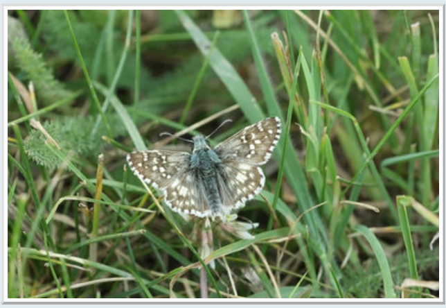
I think this is Oberthur's Grizzled skipper