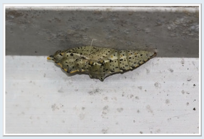
Large White Chrysalis

Starting with this Beauty which is in my greenhouse, surprised it has not hatched yet with the heat we have had