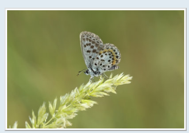
Chequered Blue - Scolitantides orion Female