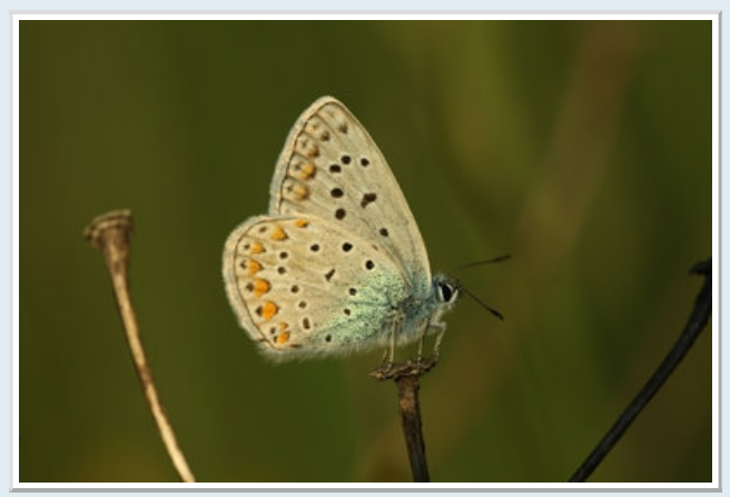
Common Blue - Polyommatus icarus