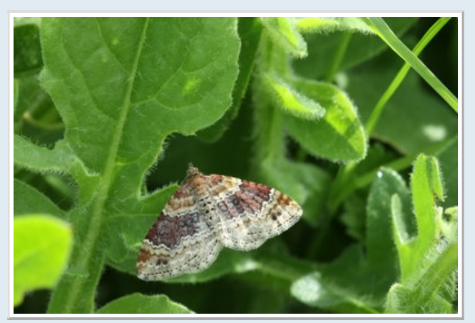
70.051 [BF 1724] Red Twin-spot Carpet Xanthorhoe spadicearia)