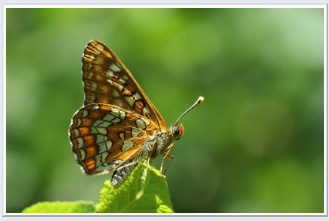
Scarce Fritillary - Underside