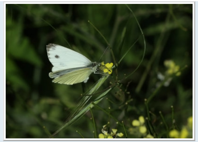
Maybe Southern Small White Pieris (Artogeia) mannii