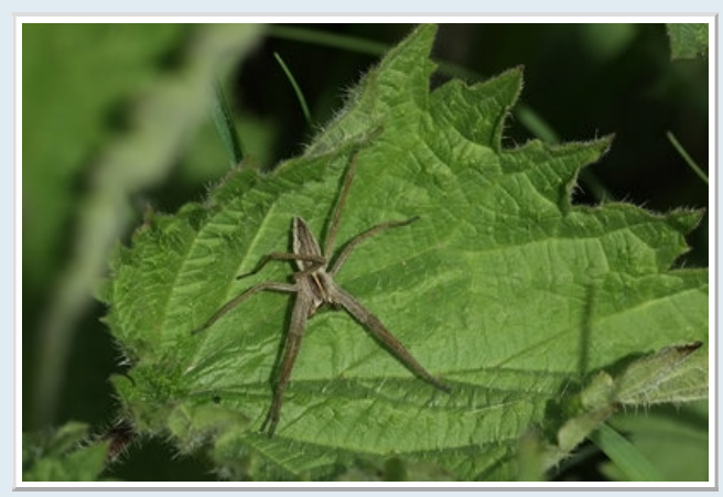
Nursery Web Spider - Pisaura mirabilis