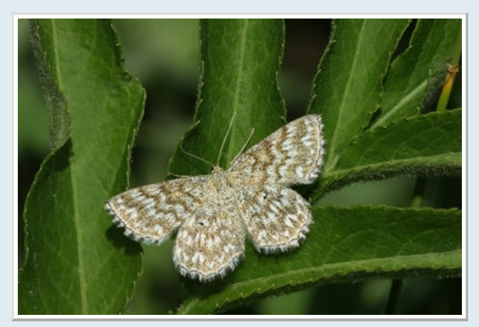
Initial thoughts 70.275 [BF 1952] Common Heath (Ematurga atomaria) appears lighter than our Common Heath, so if you have any thoughts as to what it may be if I am incorrect please shout