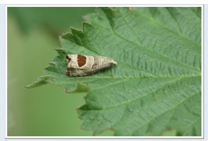
49.294 [BF 1175] Bramble Shoot Moth (Notocelia uddmanniana)