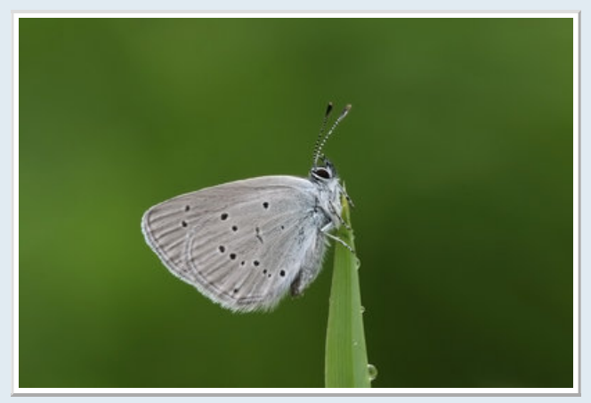
Small Blue Geometridae ??????