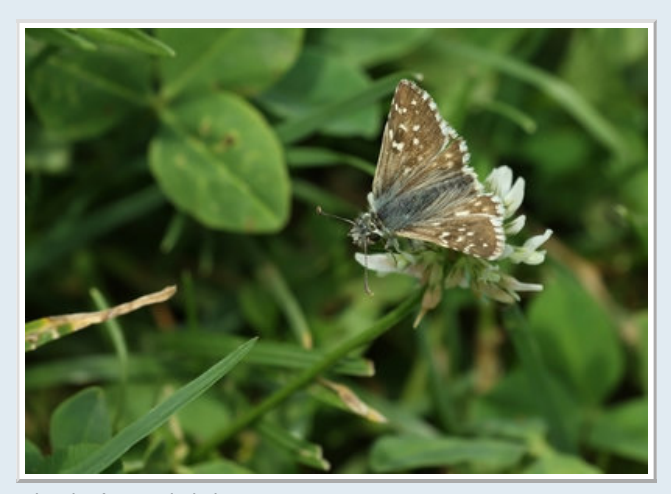
Oberthür's Grizzled Skipper - Pyrgus armoricanus