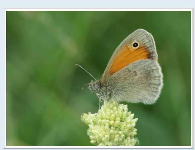
Small Heath - Coenonympha pamphilus