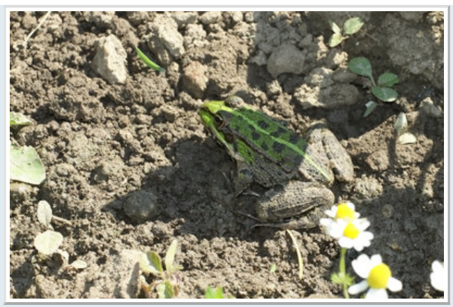
Marsh Frog - Male