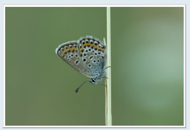
Maybe Reverdin's Blue

Not sure on this could be Reverdin's Blue if not probably Silver-Studded