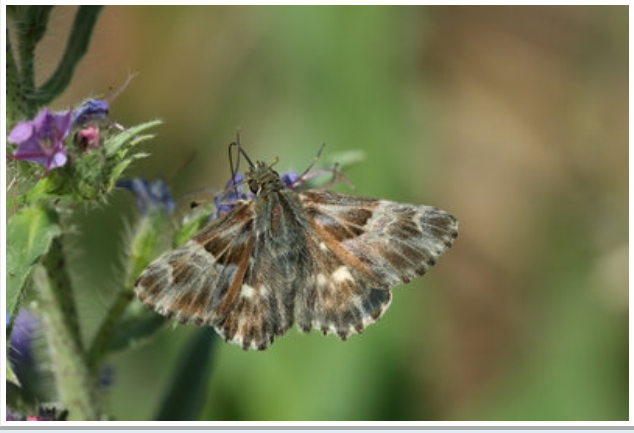
Tufted Marbled Skipper - Carcharodus flocciferus