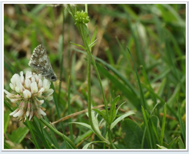
Oberthür's Grizzled Skipper – Pyrgus armoricanus