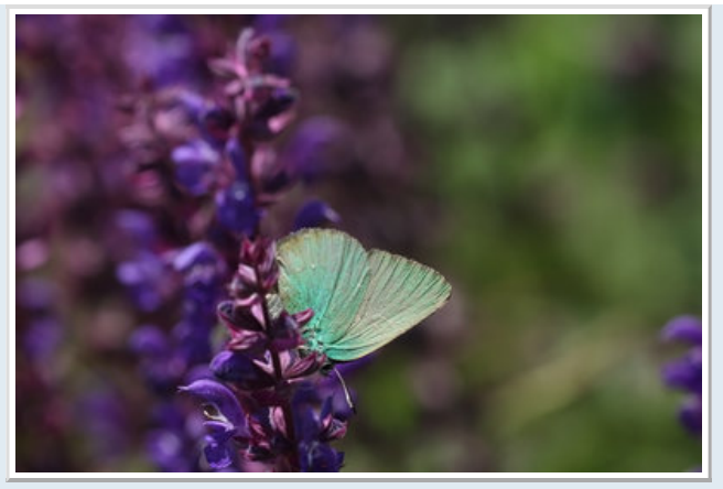
Green Hairstreak - Callophrys rubi