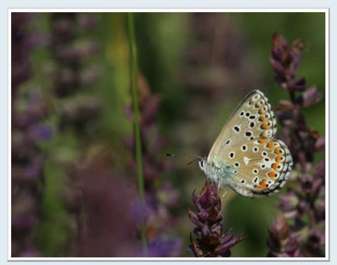
Adonis Blue -Polyommatus (Lysandra) bellargus