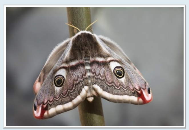
1643 - Emperor Moth (Saturnia pavonia)