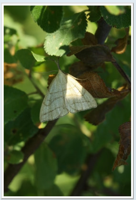
72.053 [BF 2489] Fan-foot (Herminia tarsipennalis)