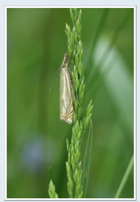
63.086 [BF 1301] Crambus lathoniellus