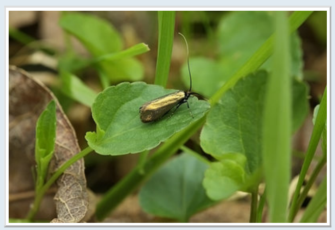
0150 - Adela reaumurella - Female