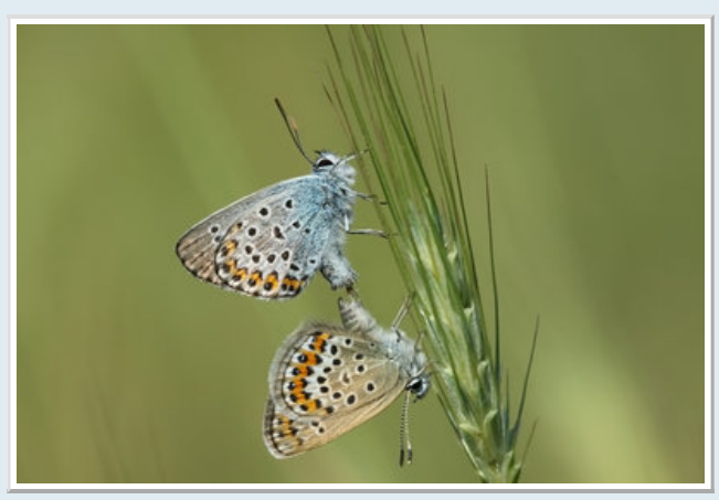
Silver-studded Blues - Plebejus argus