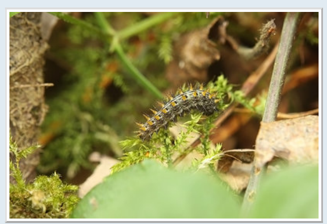
1608 - Silver-washed Fritillary Larvae