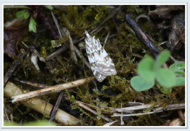
63.066 [BF 1333] Scoparia pyralella