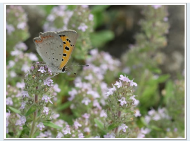
Small Copper - Lycaena phlaeas