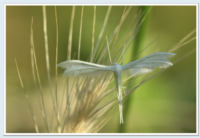
45.030 [BF 1513] White Plume (Pterophorus pentadactyla)

Not sure on this could be Reverdin's Blue if not probably Silver-Studded