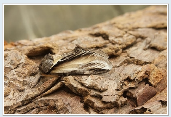
2007 – Swallow Prominent (Pheosia tremula)