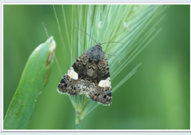
73.031 [BF 2465] Four-spotted (Tyta luctuosa)