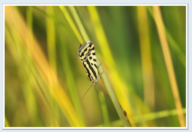
73.029 [BF 2414] Spotted Sulphur (Acontia trabealis)

Nice moth that is Local/nationally scarce in the UK