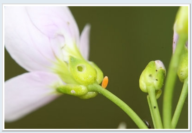
1553 - Orange Tip Ovum