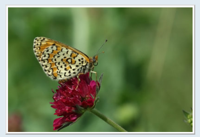
Lesser spotted fritillary – Melitaea trivia