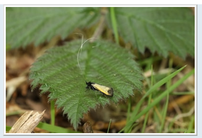
0150 - Adela reaumurella - Male