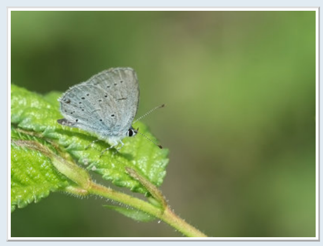
Provençal Short-tailed Blue - Cupido (Everes) alcetas