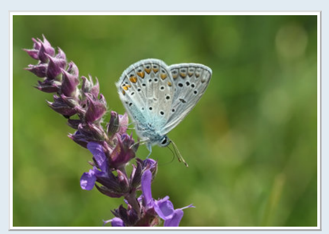
Common Blue - Polyommatus icarus