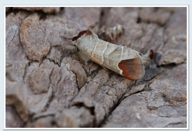
71.027 [BF 2019] Chocolate-tip (Clostera curtula)