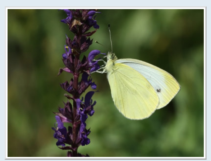
Again Maybe Southern Small White Pieris (Artogeia) mannii