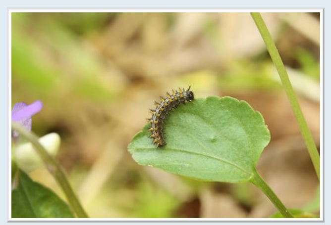
1608 - Silver-washed Fritillary Larvae 1