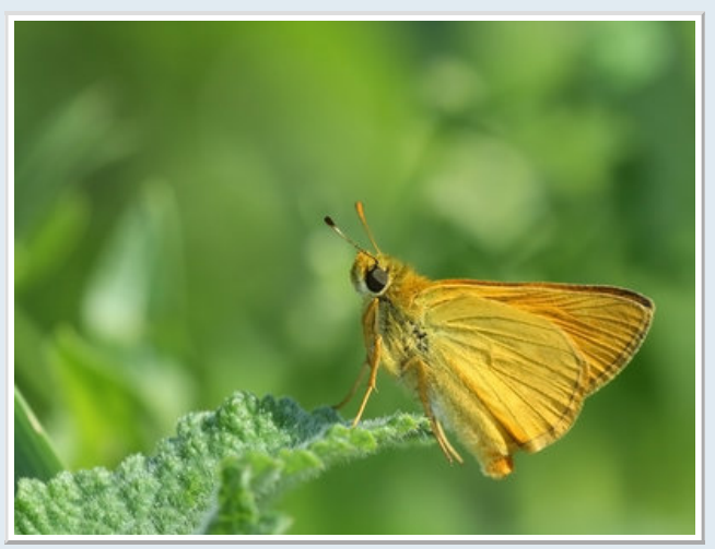
Large Skipper - Ochlodes venatus