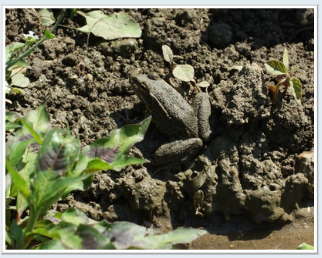
Marsh Frog - Female