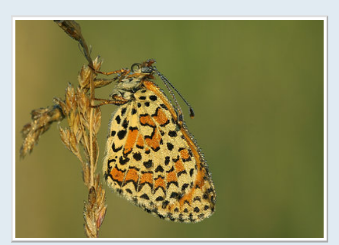
Lesser Spotted Fitillary