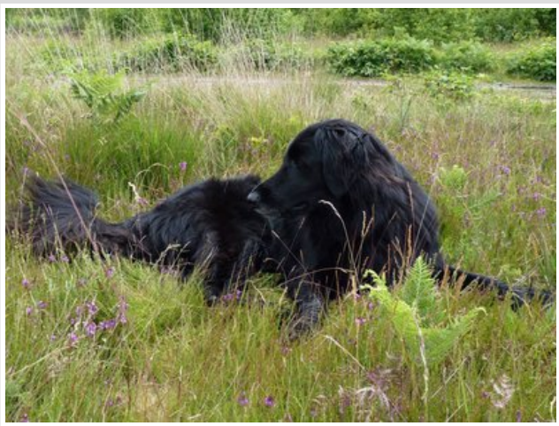
Billy is learning patience.