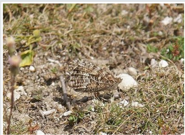
Surrey Chalk Grayling White Downs 9 Aug 2014

I think Clouded Yellows will be around in good numbers this summer.