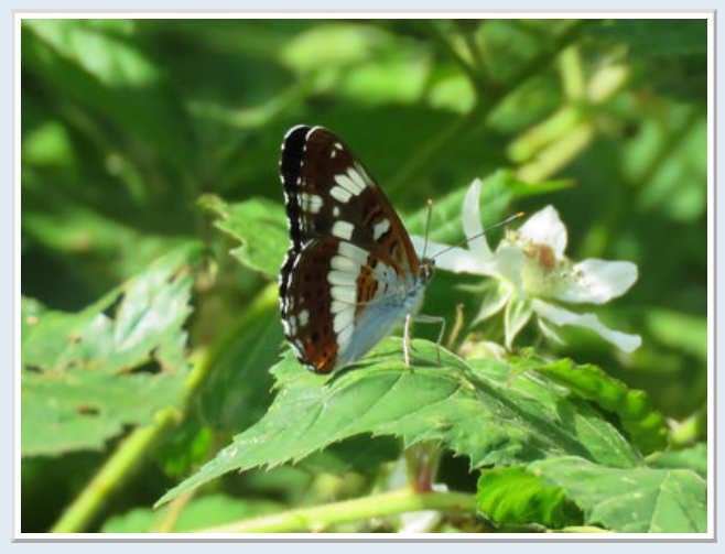
Sunday 21st June Bookham Common