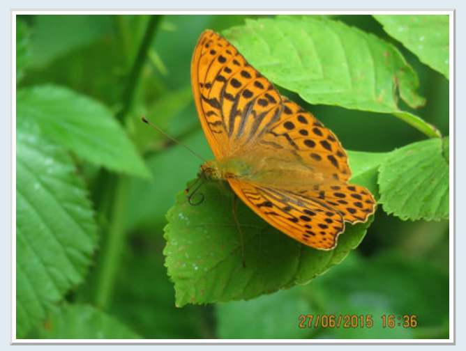
Early Male Silver Washed Fritillary

(or at least that is my experience of them over the last two years).