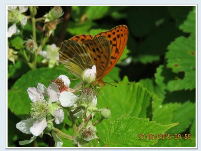
Male Silver Washed Fritillary