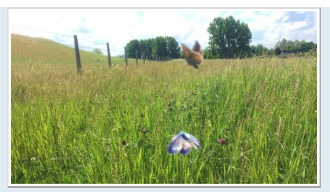
I assume these are Common Blues

Do they do mobile phones with fast shutter speeds or maybe I don't know how to operate my one properly? (iphone 6)