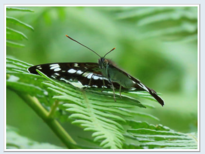
Saturday 20th June. Bookham Common