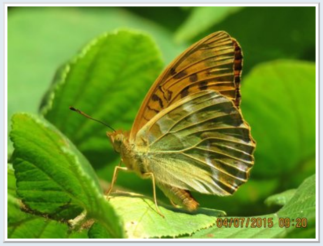
Silver Washed Fritillary Male

Bookham Common is not the best place to see Emperors grounded but I guess one has more chance during the week in the mornings when cyclists, dog walkers and joggers are fewer in number than at the weekends. SWF males still fresh. As of yesterday, no females yet: