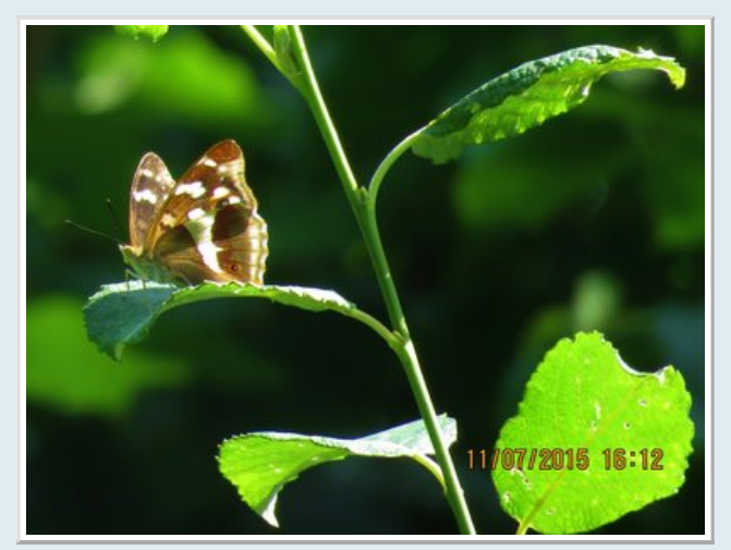
Apatura iris on Willow