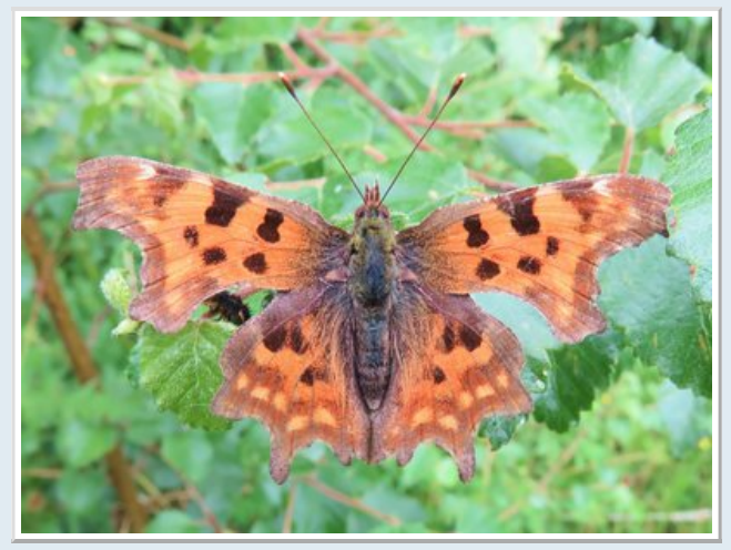
Hutchinsoni Comma Close up

16.6.2015 Recently emerged at Bookham Common, Surrey This is a very recently emerged var. Hutchinsoni Comma which is much paler in hue that those appearing later.