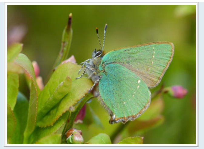
well-marked on both wings