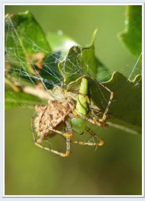
Green Lynx Spider (Peucetia viridans) – with egg sac