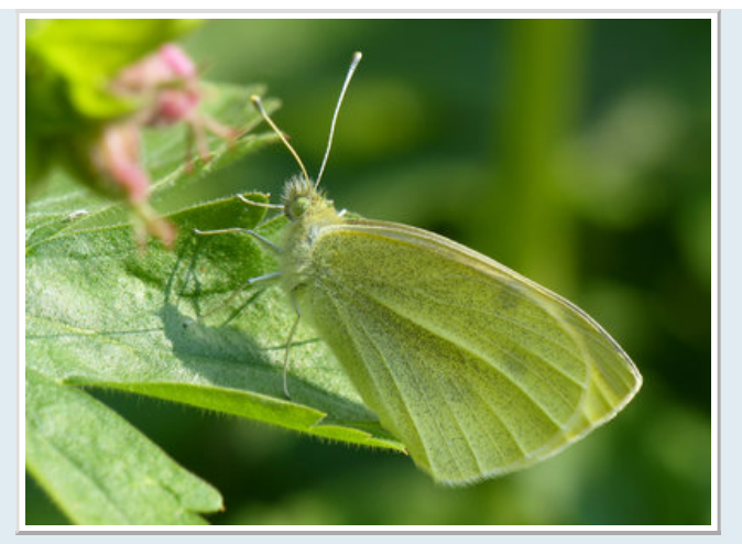
Small White - Pieris rapae - Flintham, Notts. - 21st April, 2015 A bit later than everywhere else perhaps, but hey-ho I ain't complainin'