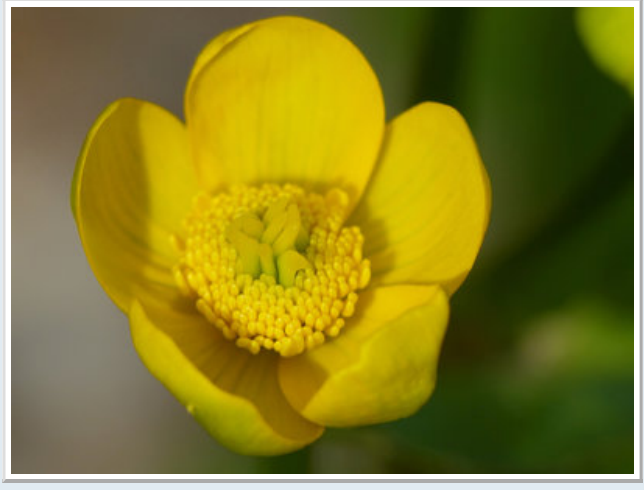
Marsh-Marigold (Caltha palustris)

I'd popped out into the garden to liberate the latest batch of Small Tortoiseshells that have been over-wintering in my potting shed/garage and are now seeking their freedom (a bonanza of 15 individuals today!), when I saw a lovely fresh male Orange Tip flutter slowly by the window as if to make a liar of me and my previous post. He didn't want to stop for a photo – so instead here's a few shots I've taken this year of native UK plants in my garden (though I confess that half of these are ones I've brought in, as opposed to being naturally occurring.)