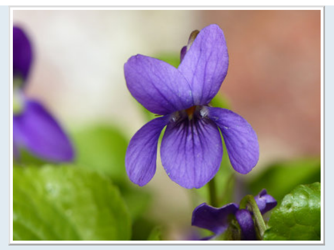
Wood Violet (Viola odorata)