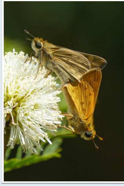
Fiery Skipper (Hylephila phyleus)