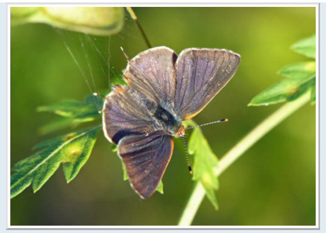
Silver-banded Hairstreak (Chlorostrymon simaethis)