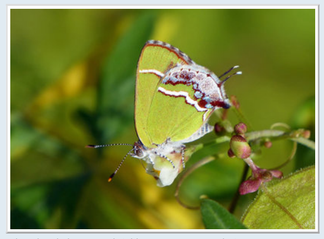
Silver-banded Hairstreak (Chlorostrymon simaethis)