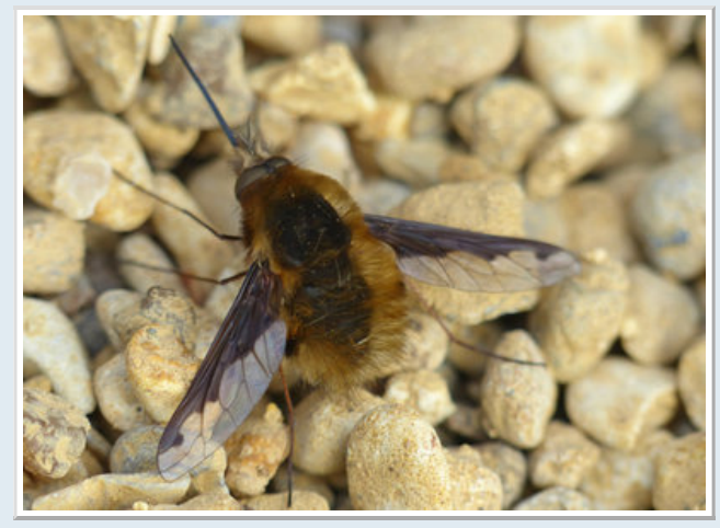
Large Bee-fly - Bombylius major - Flintham, Notts. - 9th April, 2015 cheers 🚇

Re: celery by celery, 16-Apr-15 09:31 AM GMT