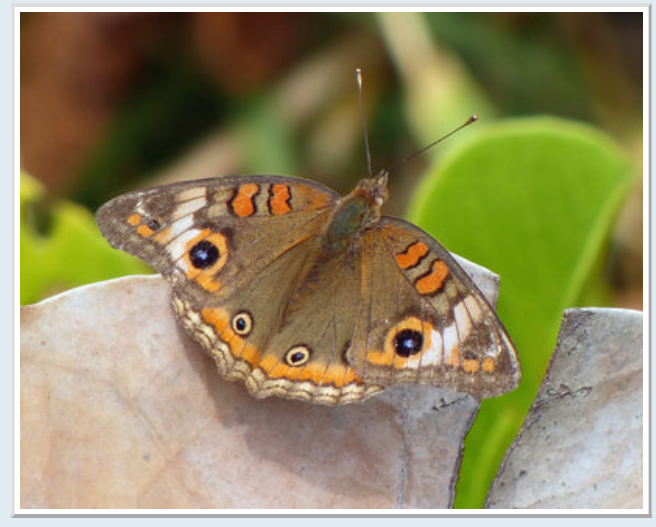
Tropical Buckeye (Junonia genoveva)