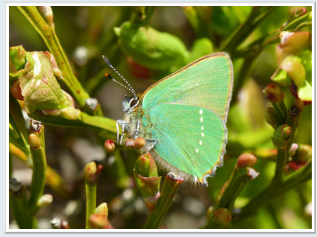
bold white-spotted 'streak' on the underside hind wing