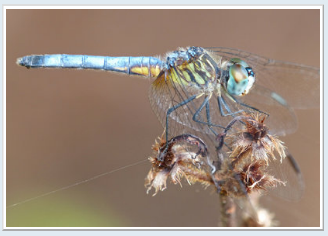
Blue Dasher (Pachydiplax longipennis)