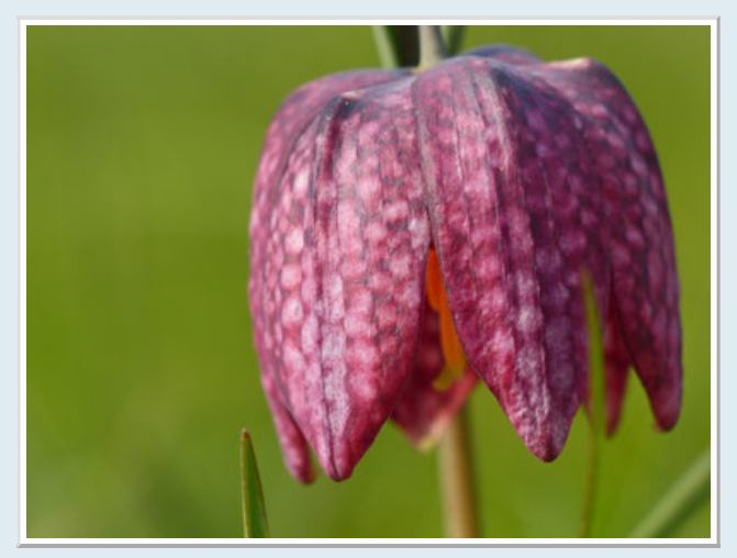
Snakeshead Fritillary (Fritillaria meleagris)

Re: celery by Goldie M, 17-Apr-15 03:47 AM GMT Love the flower photos Celery, sorry the Orange Tip didn't settle for you but at least you saw one 😁 Goldie 😁