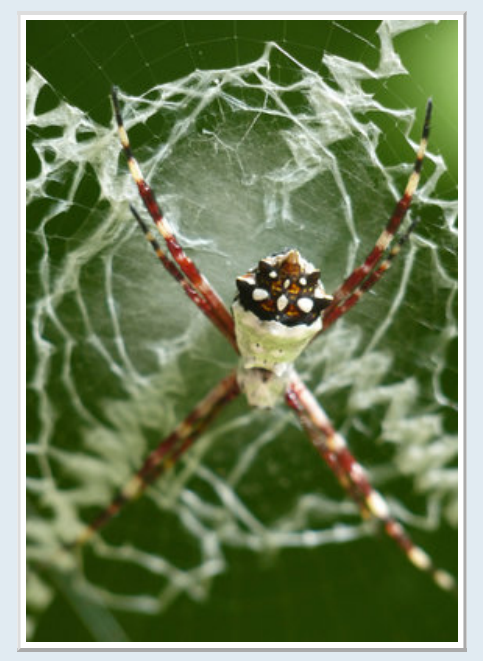
Silver Argiope (Argiope argentata)