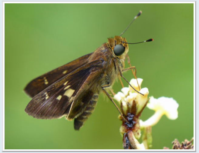
Violet-banded Skipper (Nyctelius nyctelius)

...here's a few butterflies of Barbados 😁