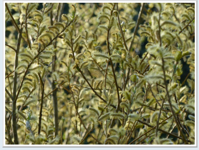
Willow catkins (Salix sp.)