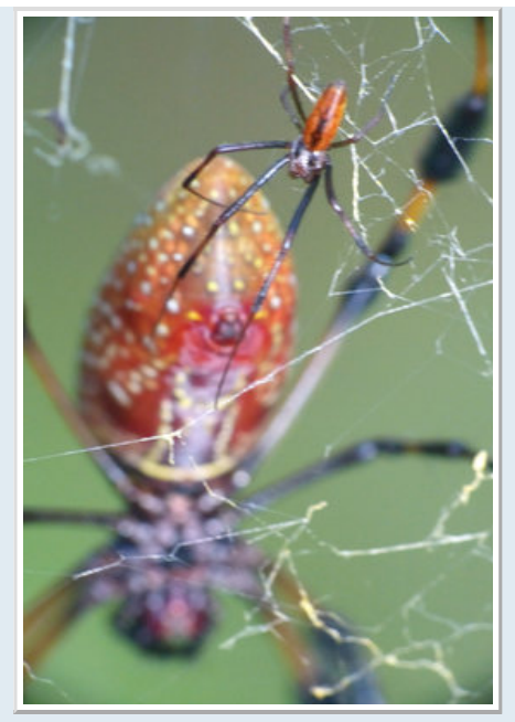
Golden Silk Orbweaver (Nephila clavipes) – male and female