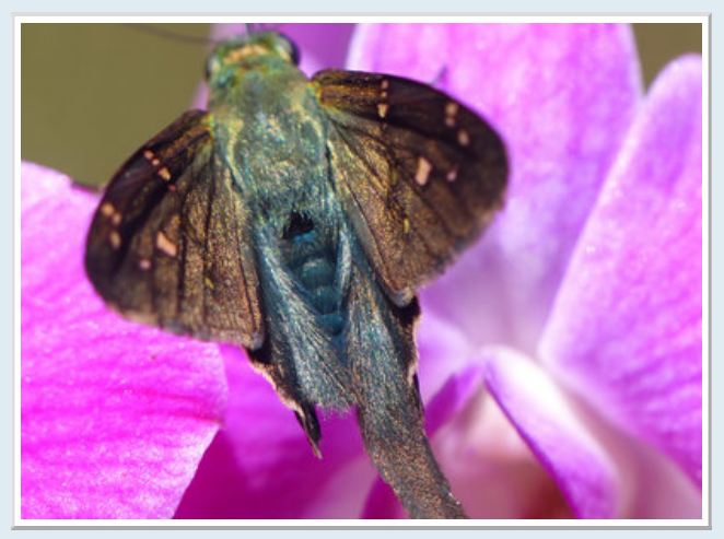
Long-tailed Skipper (Urbanus proteus)