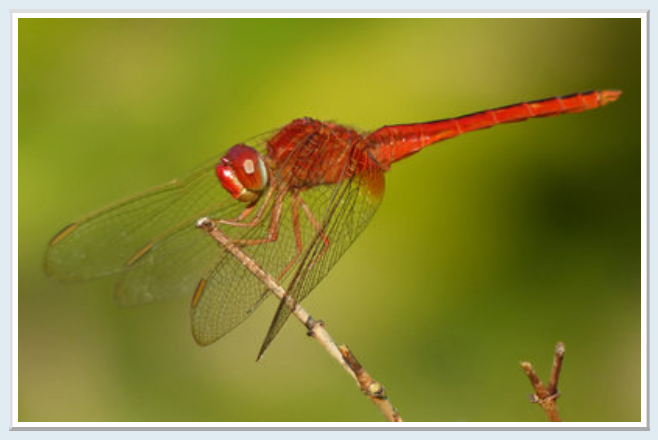
Scarlet Skimmer (Crocothemis servilia)