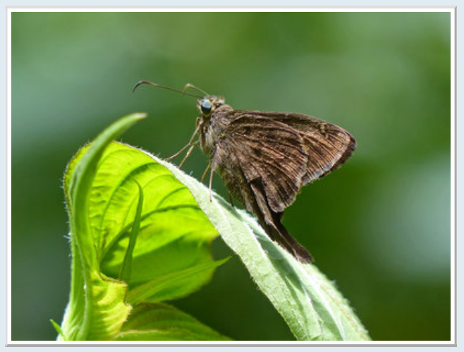
Dark Longtail (Urbanus obscurus)