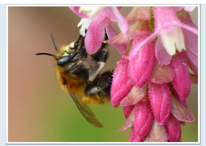
Hairy-footed Flower Bee - Anthophora plumipes - Flintham, Notts. - 22nd March, 2015