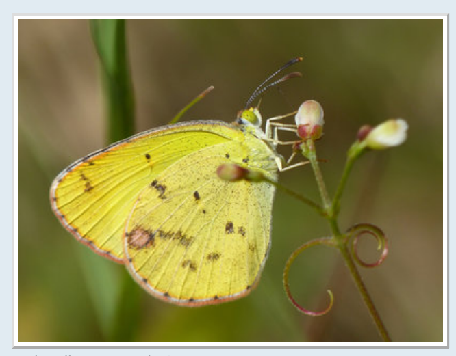
Little Yellow (Eurema lisa)