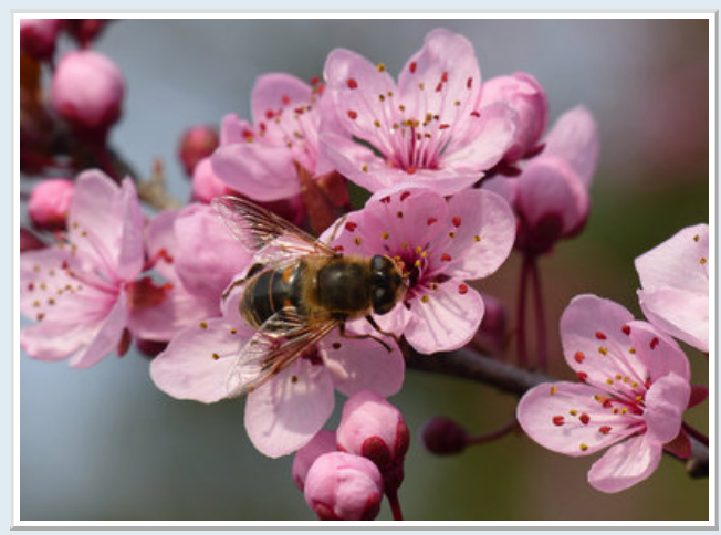
Drone-fly - Eristalis tenax - Flintham, Notts. - 13th March, 2015