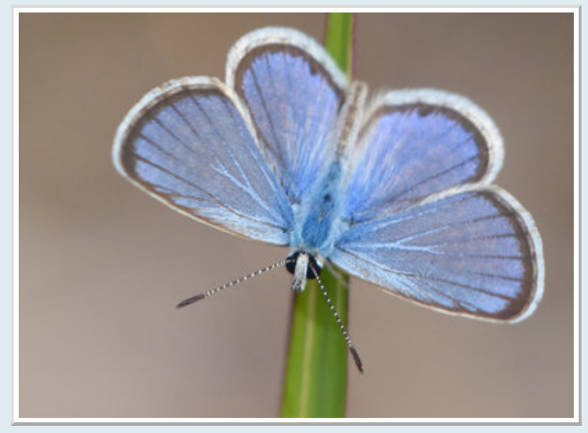
Hanno Blue (Hemiargus hanno)