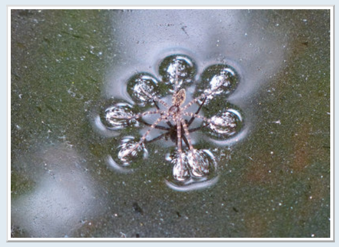
Whitebanded Fishing Spider (Dolomedes albineus)