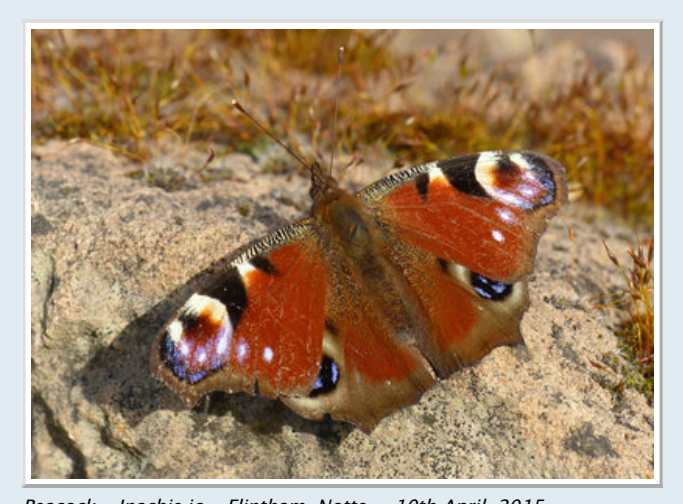
Peacock - Inachis io - Flintham, Notts. - 10th April, 2015 Still waiting for the first Orange Tips and Holly Blues to show up. Some other critters are stirring though...