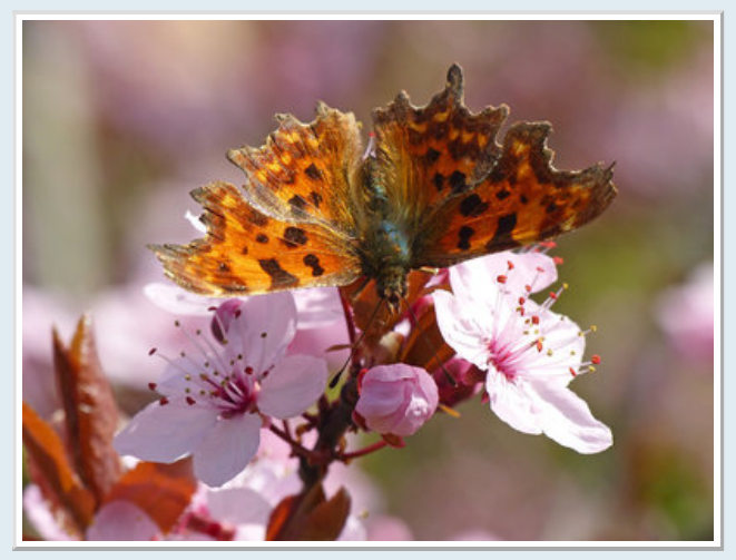
Comma – Polygonia c-album – Flintham, Notts. – 22nd March, 2015

February 9th – Small Tortoiseshell March 6th – Brimstone, Red Admiral March 22nd – Comma