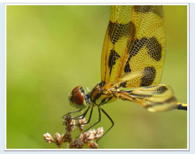
Halloween Pennant (Celithemis eponina)