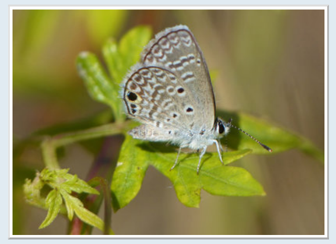
Hanno Blue (Hemiargus hanno)