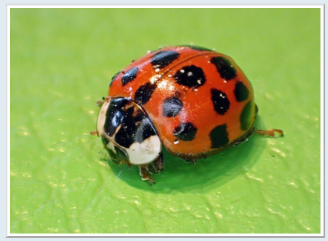
Harlequin Ladybird - Harmonia axyridis - Flintham, Notts. - 10th February, 2014