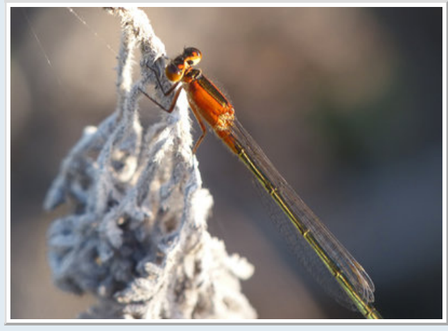
Rambur's Forktail (Ischnura ramburii)