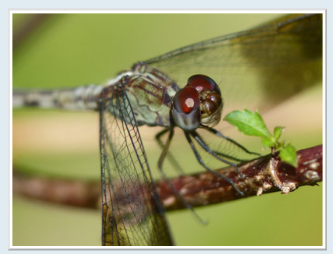
Band-winged Dragonlet (Erythrodiplax umbrata)