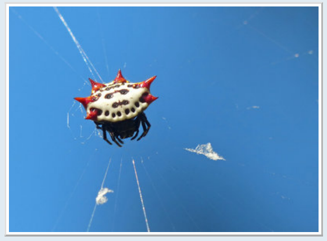
Crab-like Spiny Orb Weaver (Gasteracantha cancriformis)

Generally I'm OK with the eight-legged freaks providing they a) are not bigger than a hand span b) are not of the jumping and/or spitting variety c) do not feature the word widow in their common name which unfortunately rules out about 95% of the species in Florida <sup>(3)</sup>