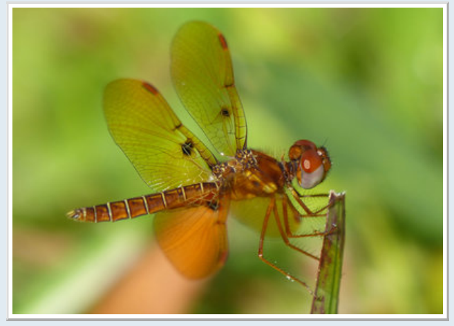
Eastern Amberwing (Perithemis tenera)