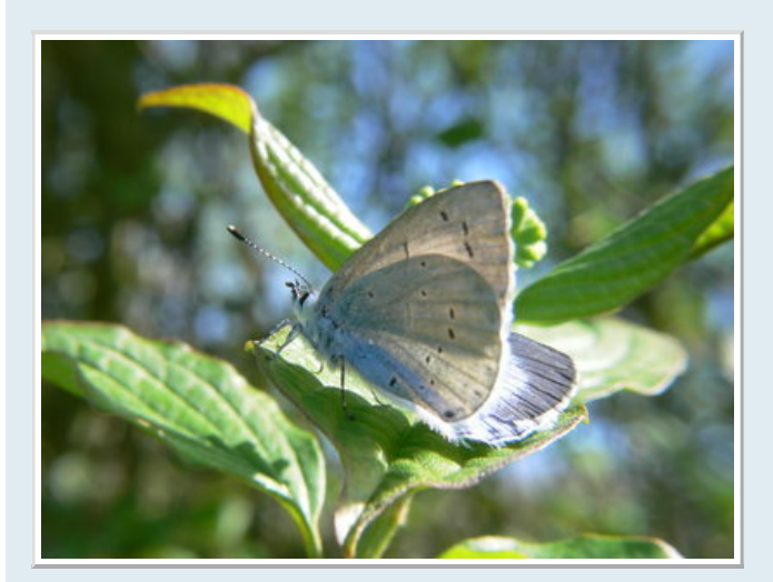
Holly Blue Ovipositing