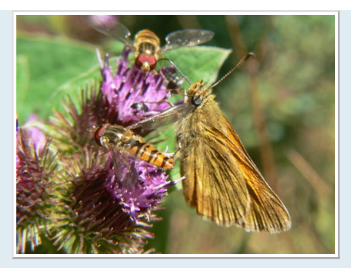
Comma at rest