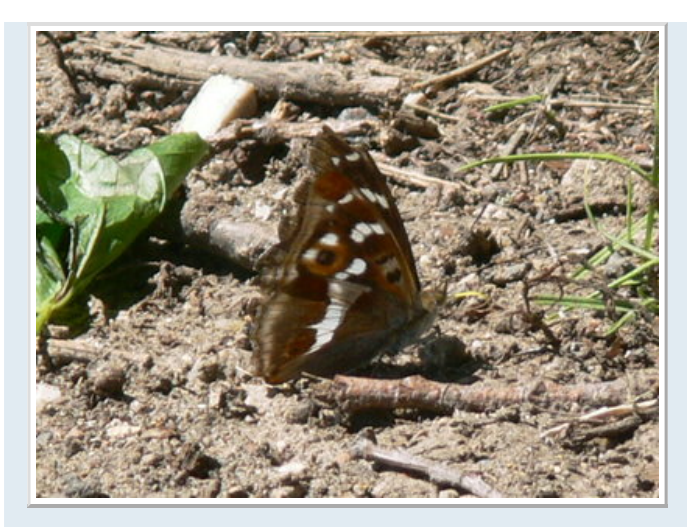
Other\ highlights\ from\ our\ visit\ were\ three\ Purple\ Hairstreaks,\ including\ this\ very\ obliging\ example.