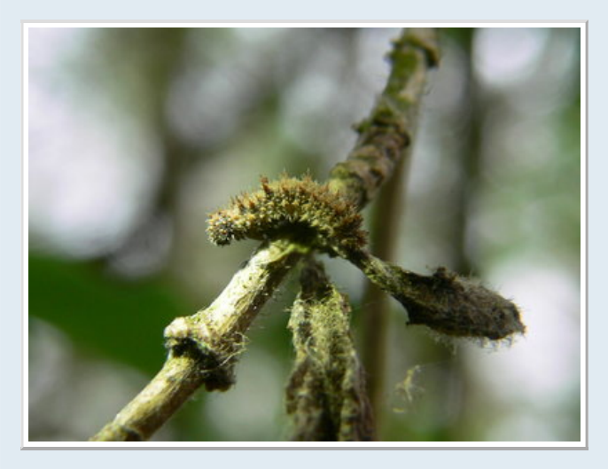
Earlier in the week, I also came across these Brown Tail Moth larvae