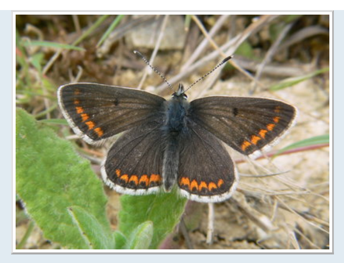
Female Common Blue