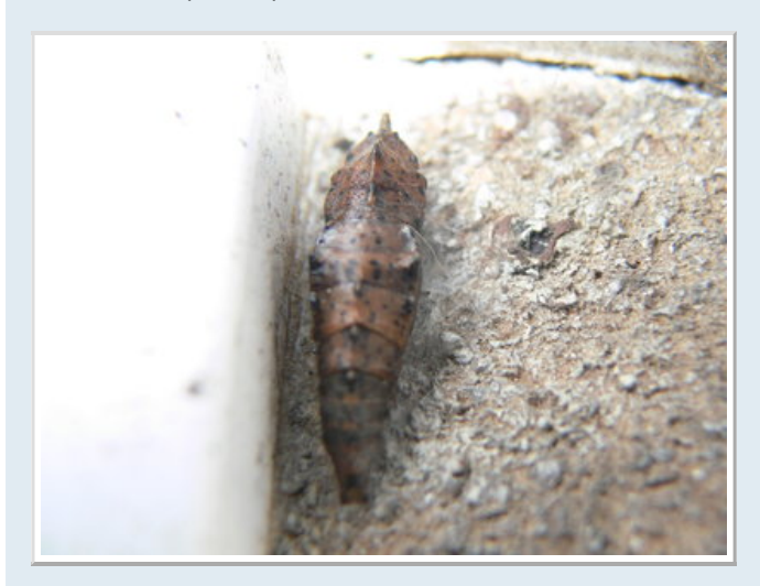
This is another example close by (quite a difference)