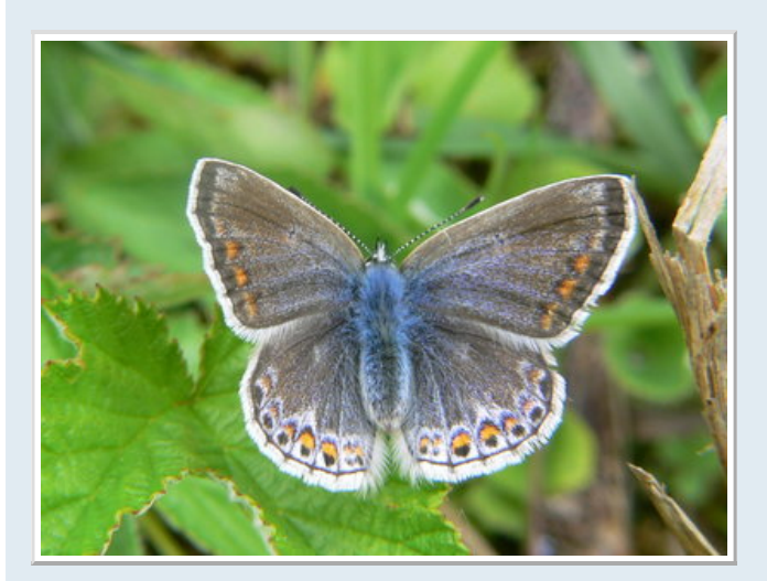
Male Common Blue