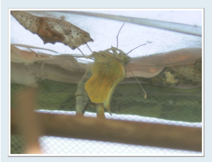
One of the females released this afternoon after the rain had passed. % \label{eq:control_eq}