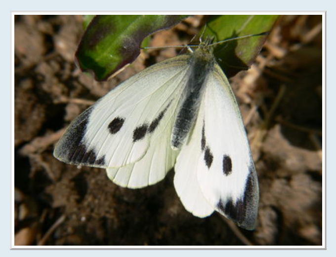
One of the males released this afternoon.