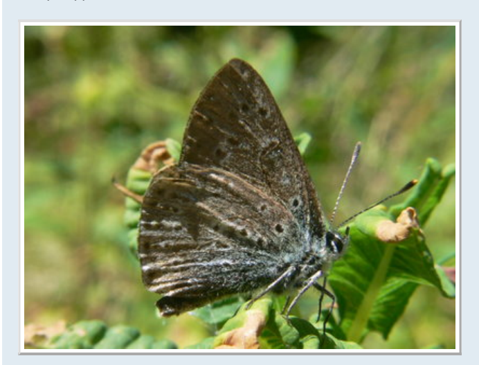
Adonis & Long Tailed Blue