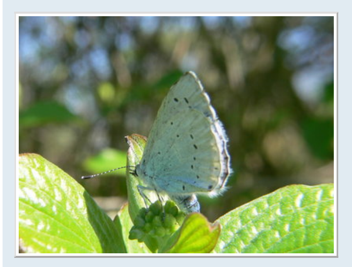
Egg successfully laid