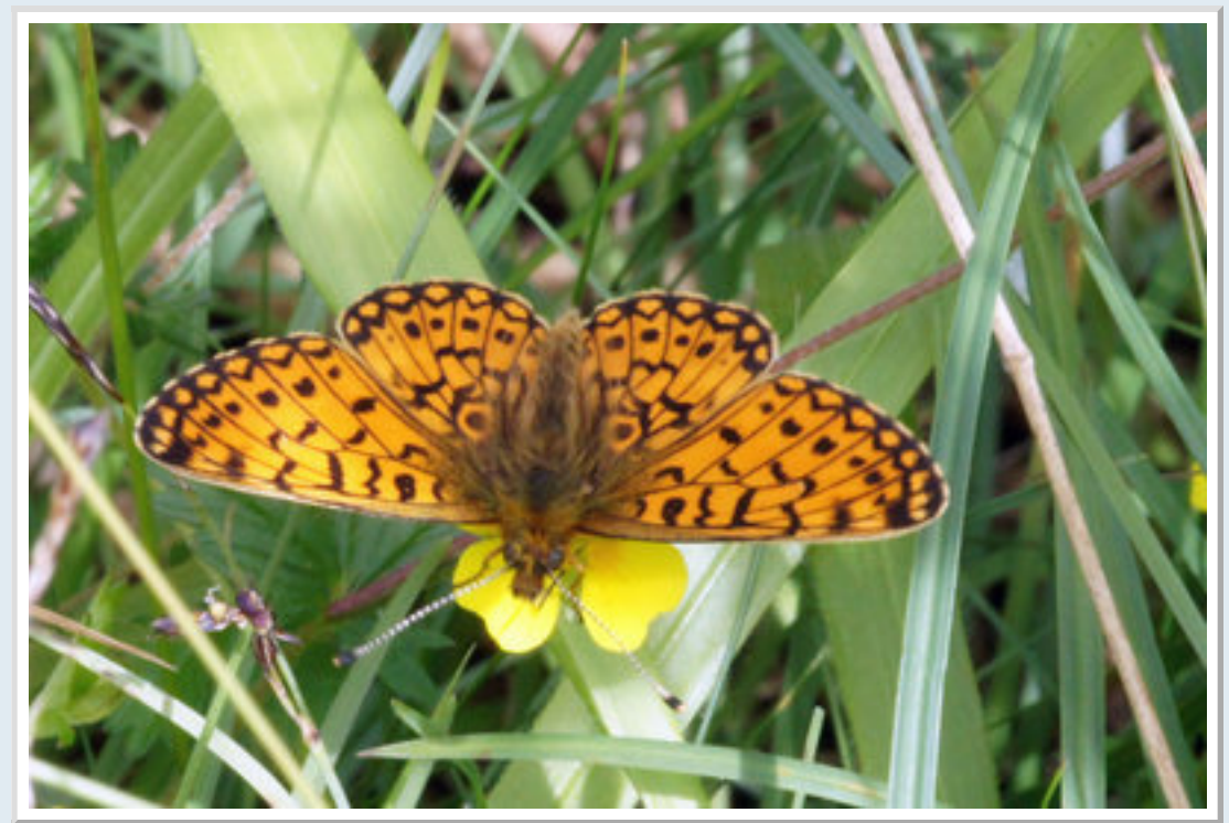
Small Pearl Bordered Fritillary - Arnside Knott

Visited arnside Knott for the forst time this year yesterday. Very different from how it will be in about a month's time when there should be large fritillaries and grayling everywhere. Yesterday despite it being sunny and warm we only saw a total of about 15 butterflies. Small Heath and Small Pearl Bordered Fritillaries were the most common with 5 of each seen. Other butterflies seen were Large Whites and a solitary and very fresh Speckled Wood.