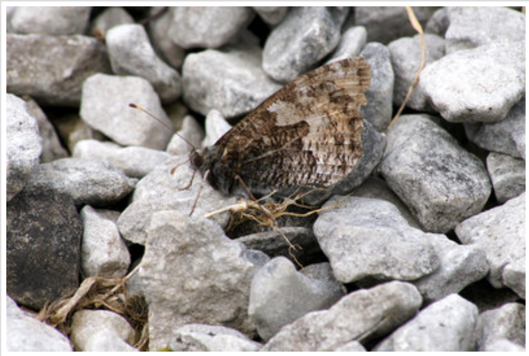
Grayling - Arnside Knott

Made it back to Arnside Knott yesterday before the rain set in. Still a good number of Scotch Argus to be seen although few other butterflies about with small numbers only of Gatekeeper, Meadow Brown, Small White as well as a solitary Grayling and a male Brimstone.