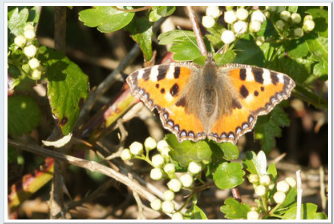
Small Tortoiseshell, Portishead