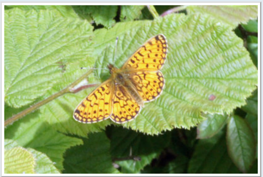
Small Pearl Bordered Fritillary - Arnside Knott