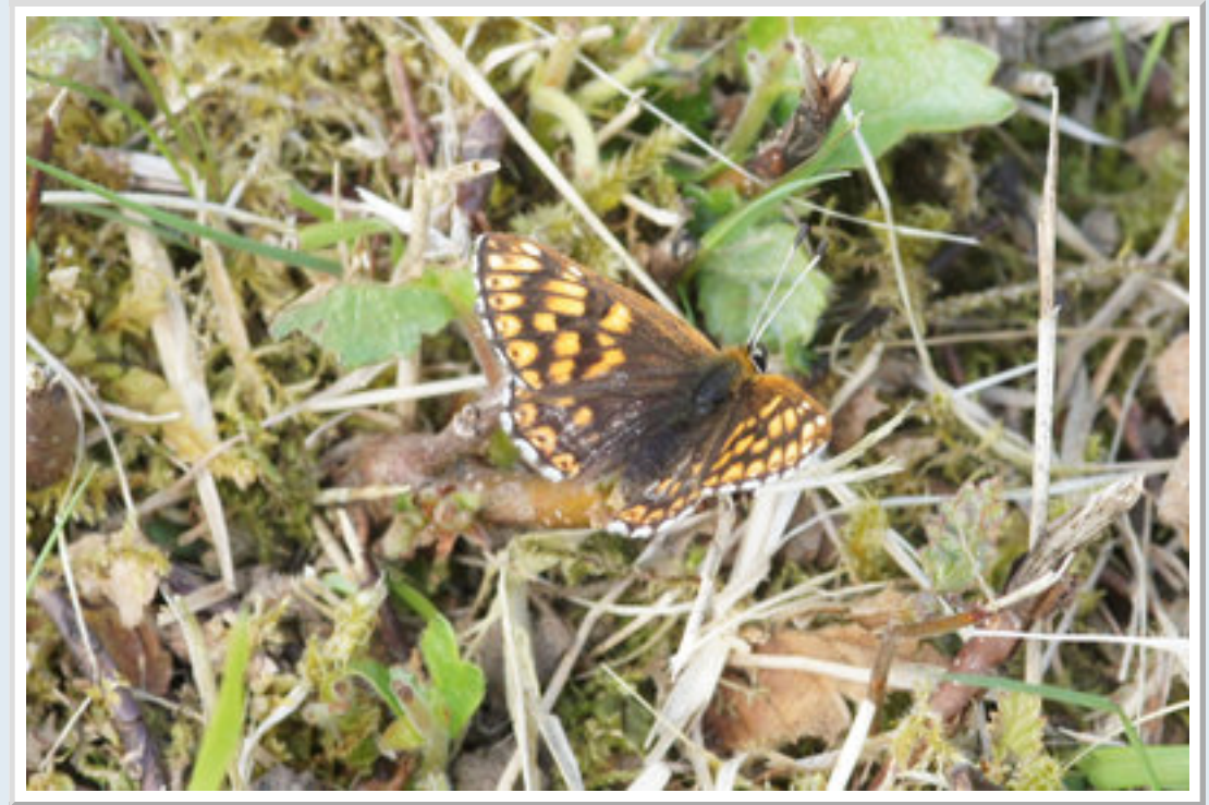
Duke of Burgundy