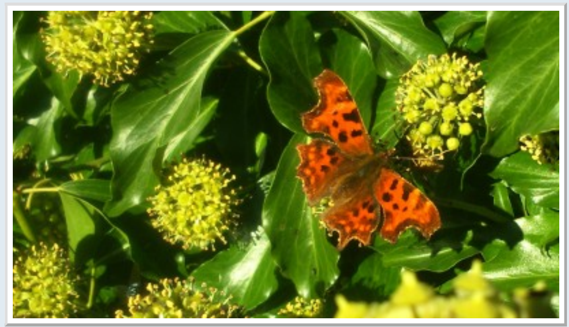
Comma, Howarth, West Yorkshire