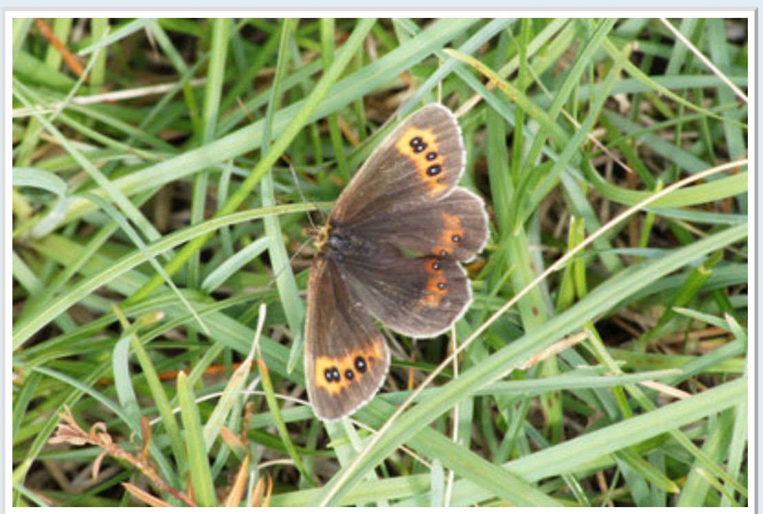
Scotch Argus - Arnside Knott