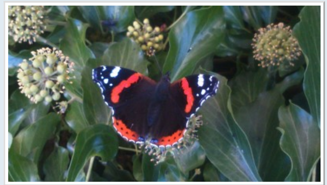
Red Admiral, Howarth, West Yorkshire

Still some butterflies about even in the North. Parked in Haworth and found a Red Admiral and a Comma on an Ivy Bush. Still there when we returned after an hour. The photos were taken on my camera phone.