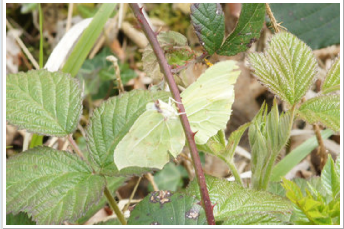
Male and Female Brimstones. The Male was very keen to mate but the female didn't want to know.