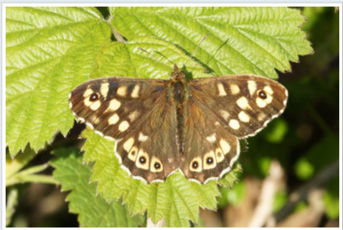
Speckled Wood, Portishead