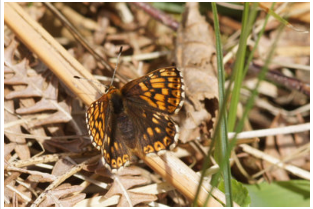
Duke of Burgundy