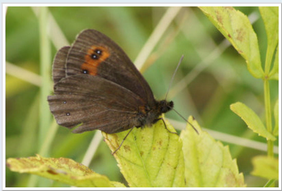
Scotch Argus – Arnside Knott