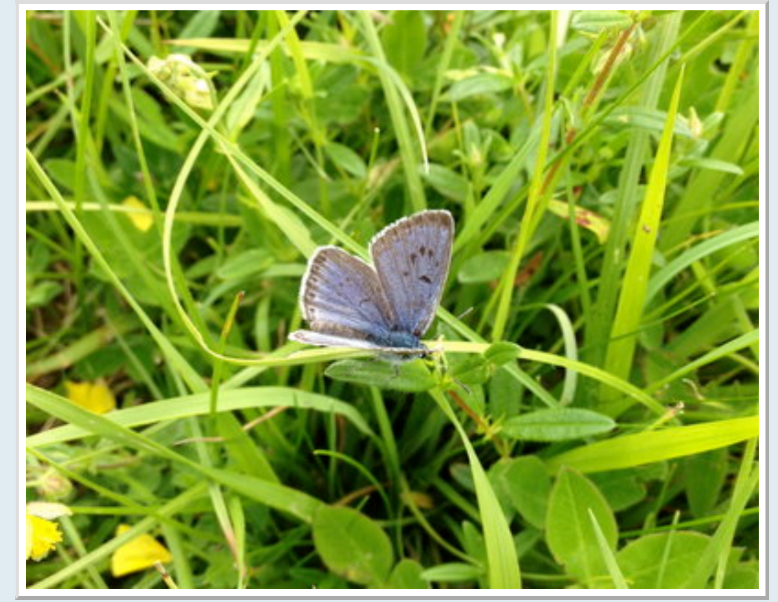
Open Wing LB