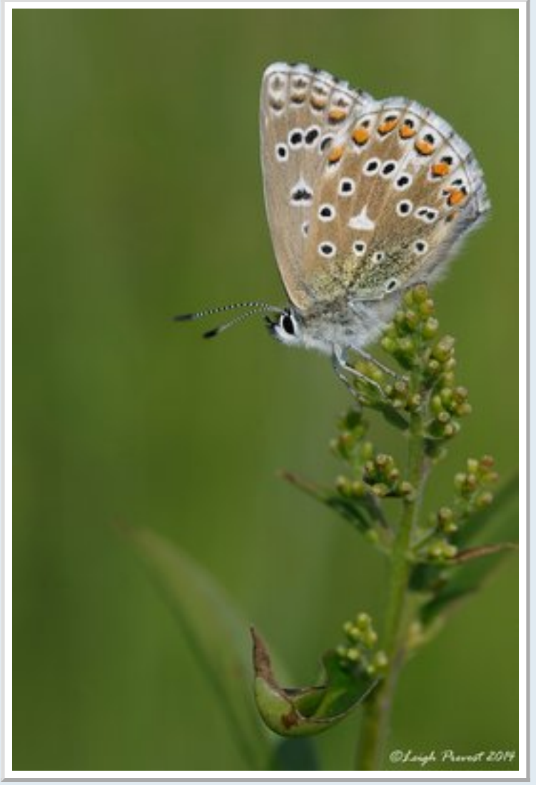
Adonis Blue, Polyommatus bellargus