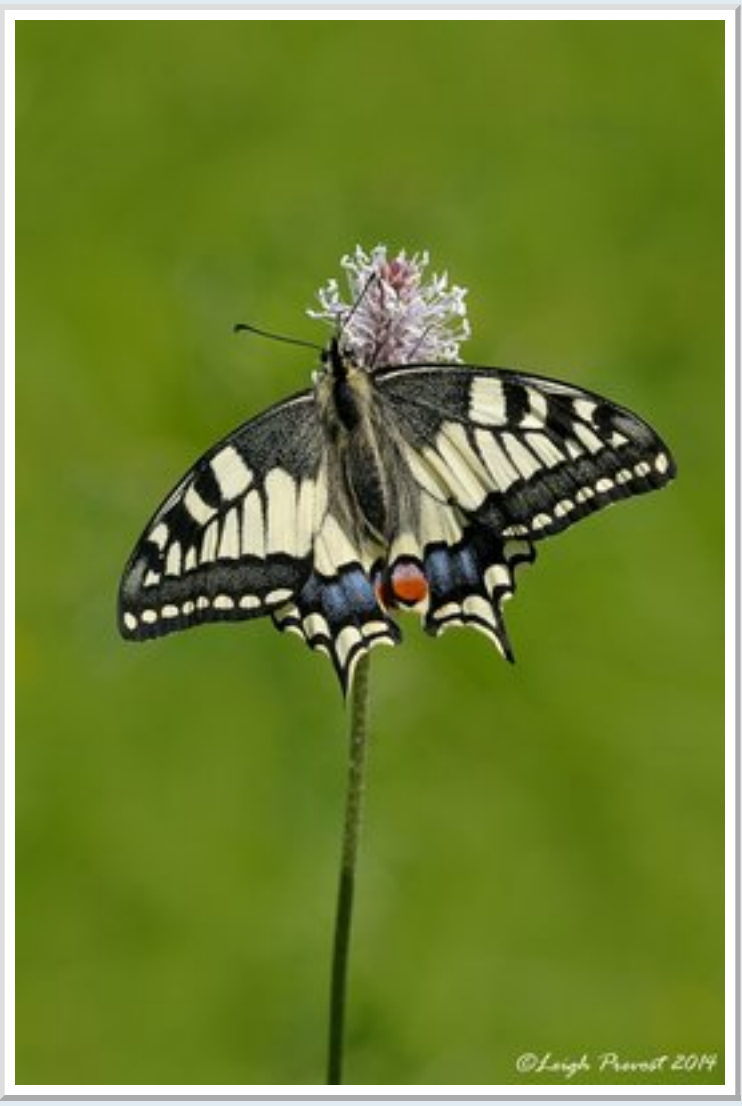
Female European Swallowtail, Papilio machaon gorganus