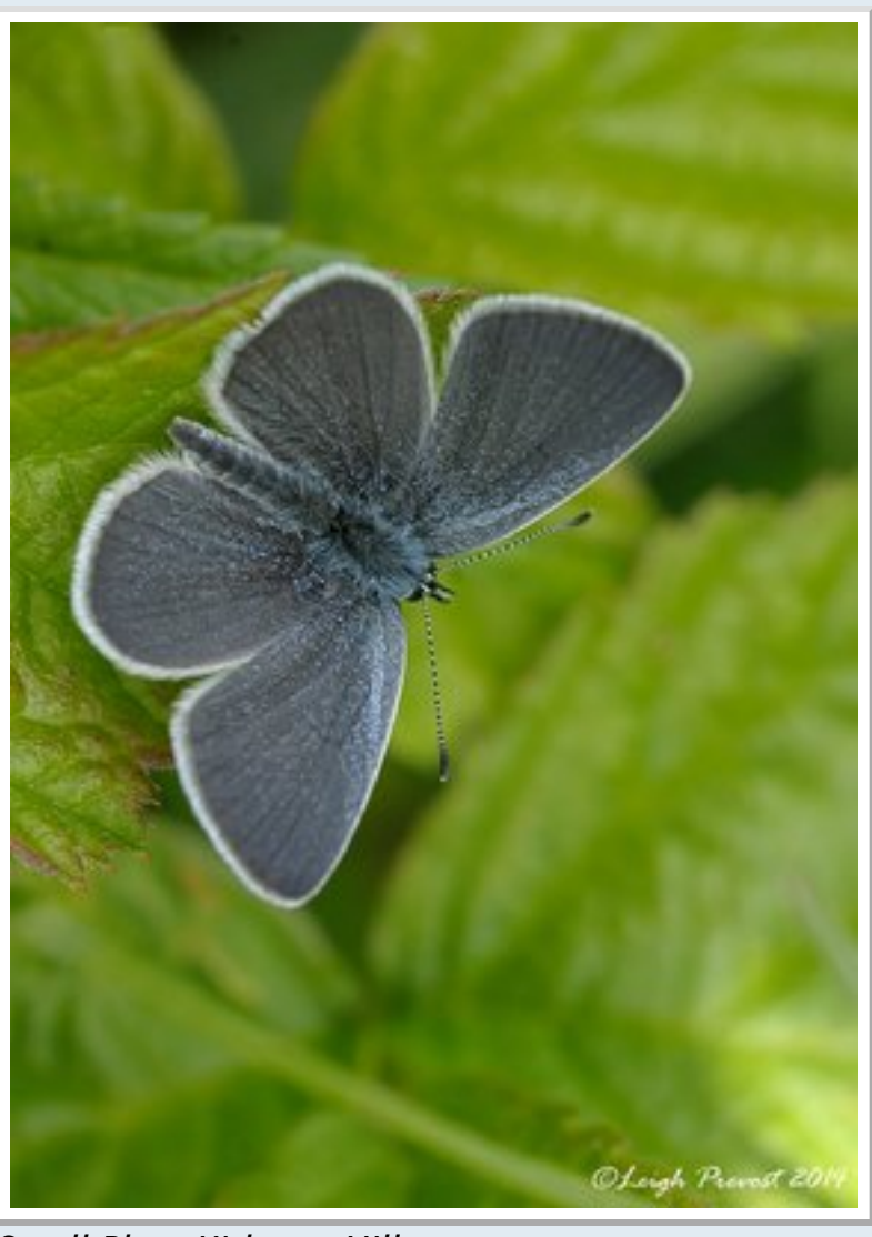
Small Blue, Kithurst Hill

On my first visit to Kithurst Hill this year (Sunday 4th May), I was pleased to see the abundance of Cowslips in bloom but the highlight of course was a lone Duke of Burgundy. Whilst not one for posing, I managed a few pleasing images. And just as I was leaving an added bonus in the form of a freshly emerged Small Blue! Got to just love that colour!? The season (and the weather) it seems is hotting up!