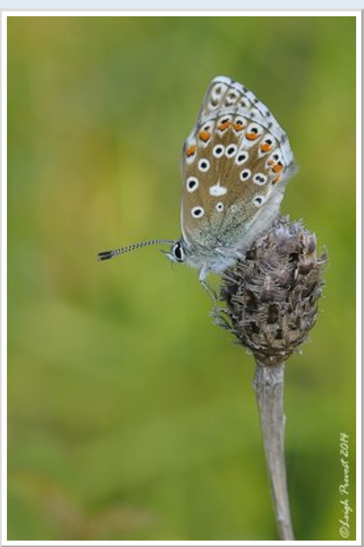
Adonis Blue, Polyommatus bellargus

Had a good little stroll around the Southern Slope at Mill Hill this evening – Adonis, Common Blue, Dingy Skipper and best of all a posing Grizzled which started off wings open and then eventually closed as the sun went down. Some photos below and on my Flickr page: <a href="https://www.flickr.com/photos/48896022@">https://www.flickr.com/photos/48896022@</a> ... 4003076288