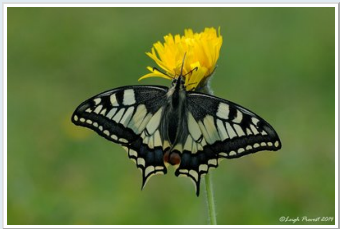
Female European Swallowtail, Papilio machaon gorganus

Here are just a few of the many, many photographs I took.