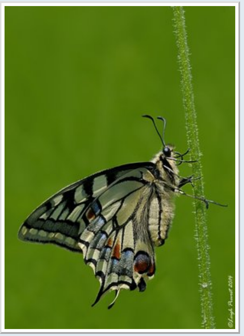
Female European Swallowtail, Papilio machaon gorganus

Another shot of the Steyning European Swallowtail. What a stunning insect - the underwing as beautiful as the upper.