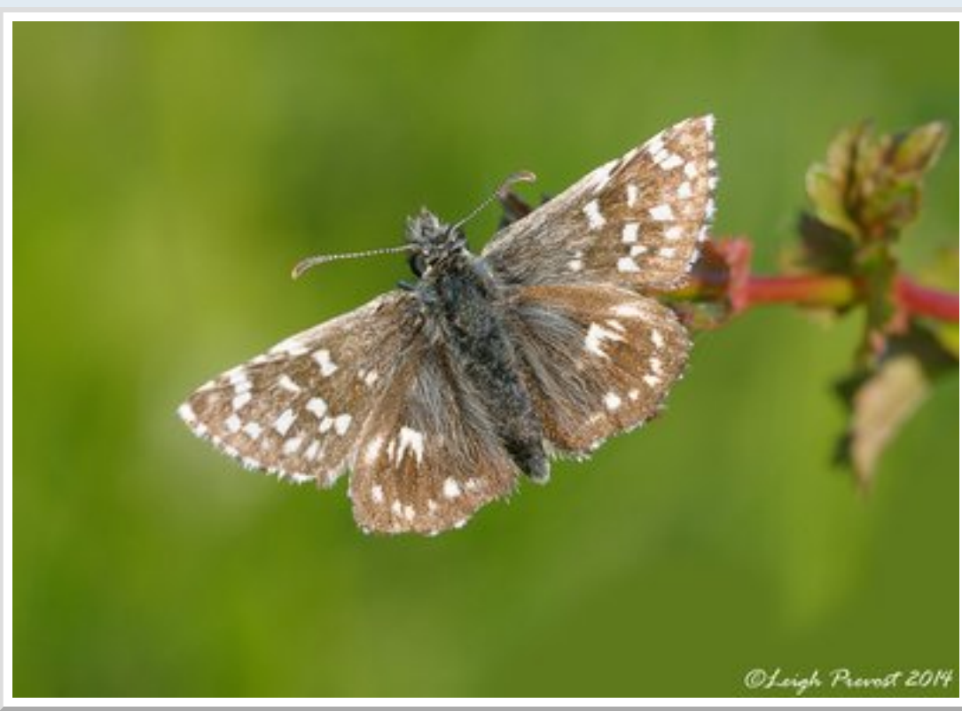
Grizzled Skipper, Pyrgus malvae