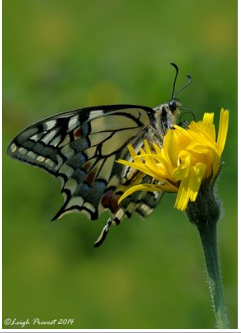
Female European Swallowtail, Papilio machaon gorganus