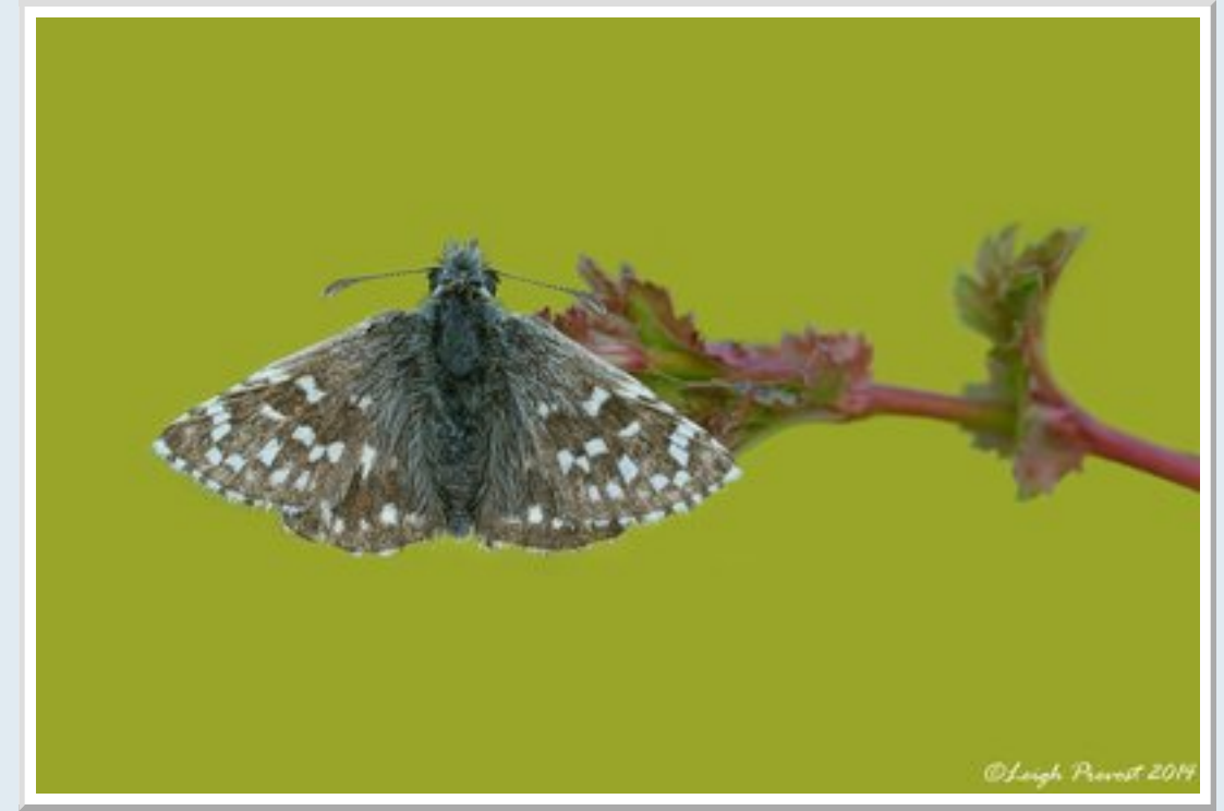
Grizzled Skipper, Pyrgus malvae