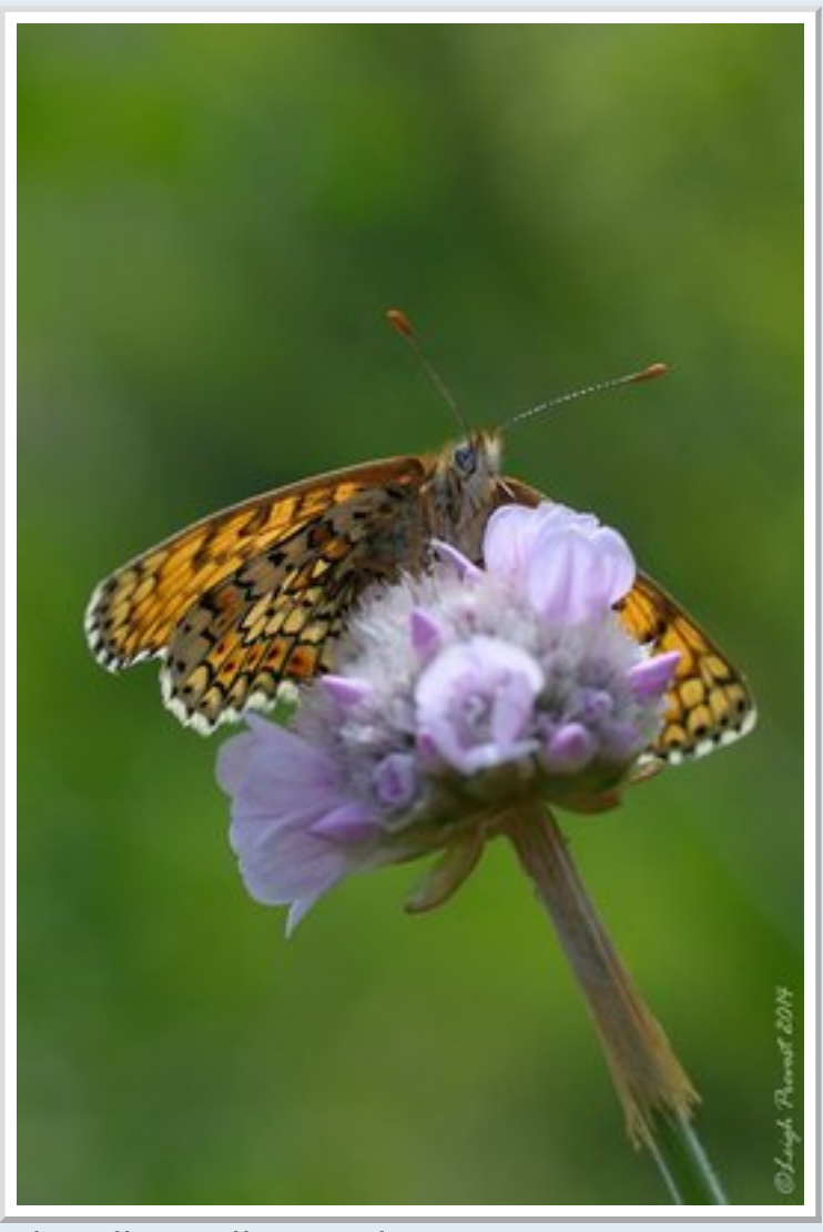
Glanville Fritillary, Melitaea cinxia