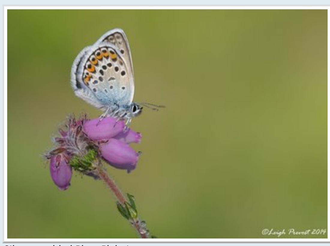
Silver-studded Blue, Plebejus argus

Whilst I was hoping to find a freshly emerged individual with ants, an early morning trip to Iping Common in West Sussex to see the Silver-studded Blues did not disappoint. Some where even on the wing soon after I arrived as the temperature rose. However, I found a few still roosting amongst the dew covered grasses and wildflowers.