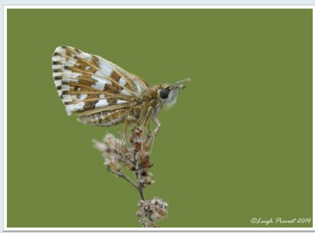
Grizzled Skipper, Chantry Hill

On Wednesday evening I visited Chantry Hill on the search for some roosting Grizzled Skippers. Not to be disappointed I found with Katrina's help 3 Grizzleds and 1 roosting Small Copper.