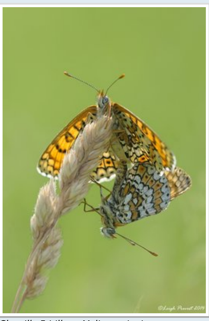
Glanville Fritillary, Melitaea cinxia