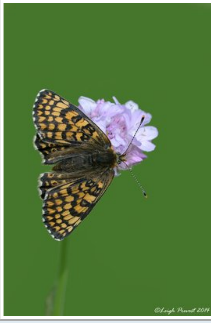
Glanville Fritillary, Melitaea cinxia

Now I've never witnessed a pair of butterflies in coitus before but one pair I watched where still doing their thing 22 minutes after I first found them together!