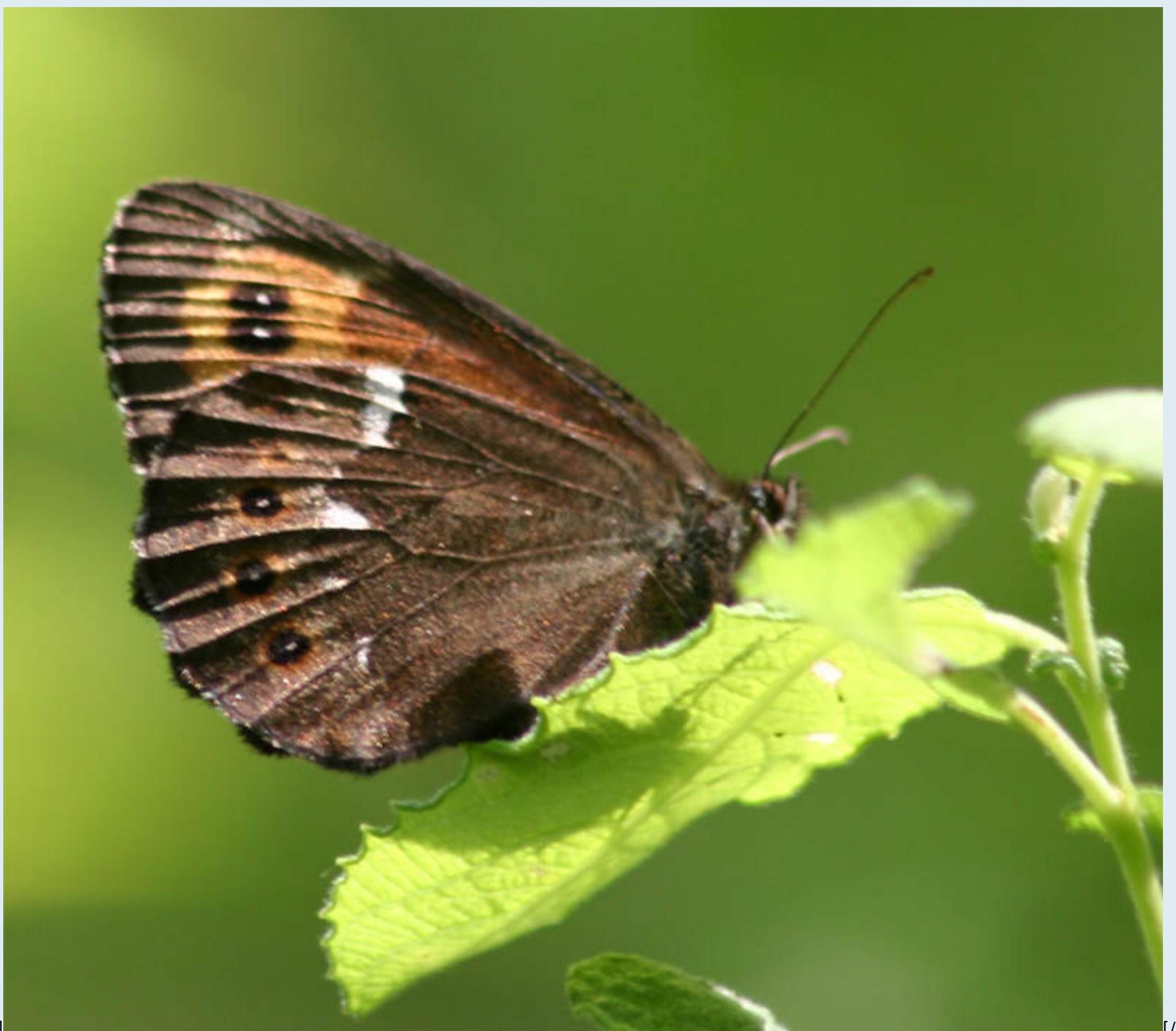
Erebia ligea ligea Bukovcevo-6 S14 2012_07_11-03 sm