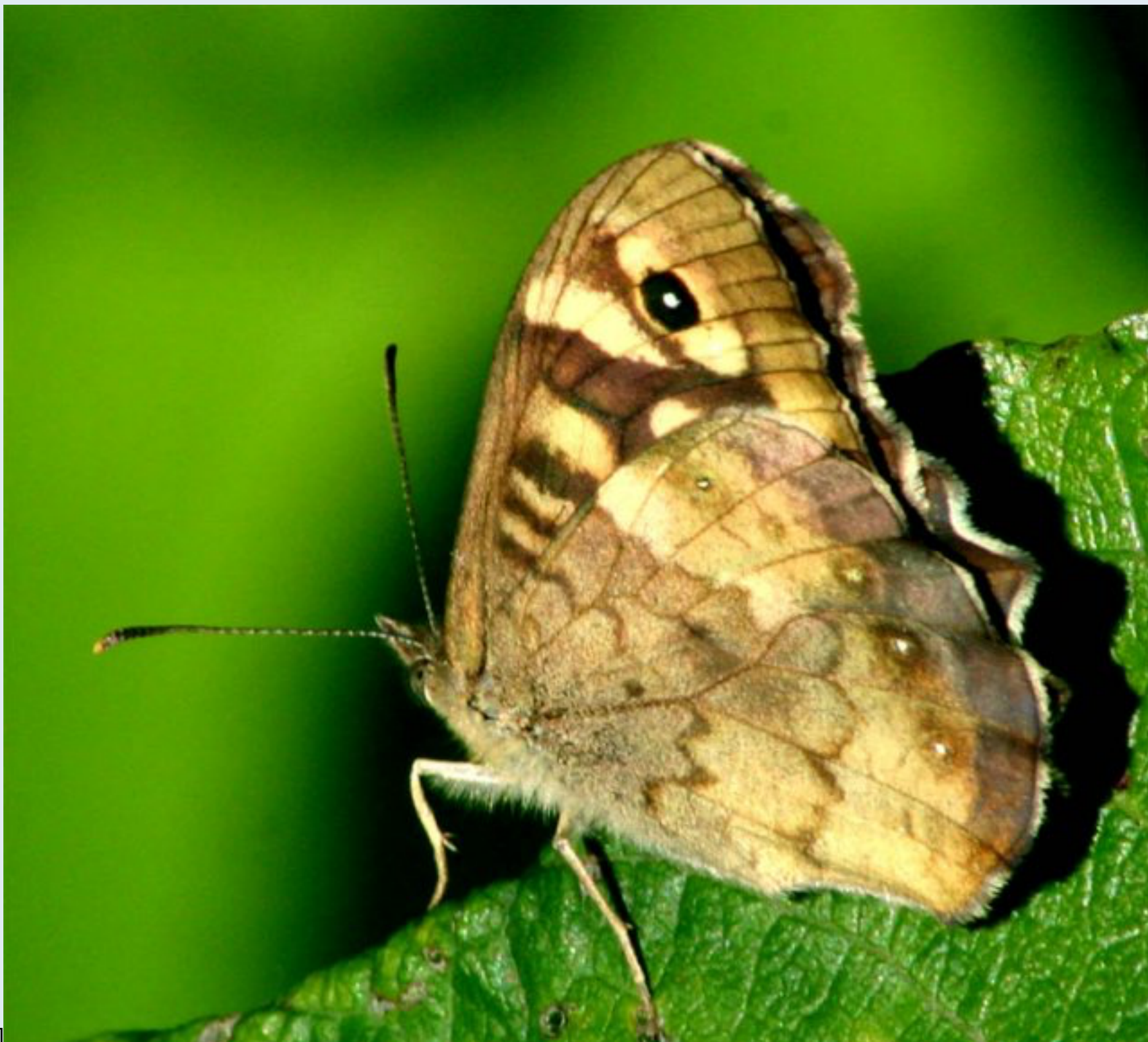
Pararge aegeria aegeria Bukovcevo-2 S6 2012_08_01-05 sm