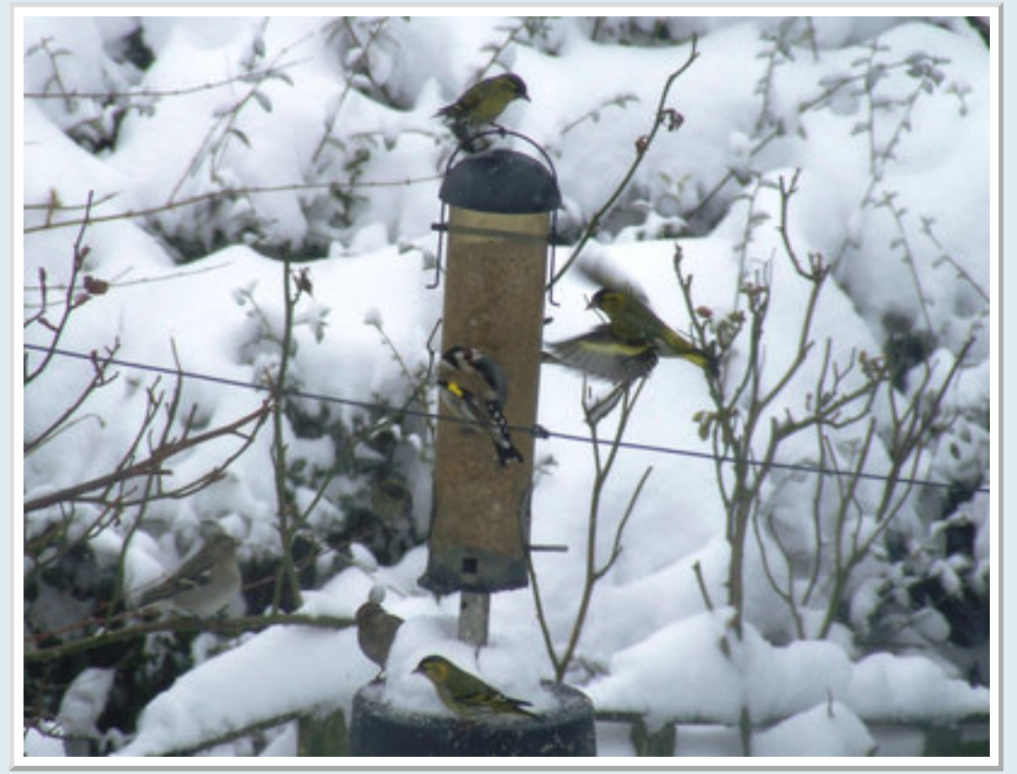
Goldfinch, Chaffinch and Siskin

I very much doubt we will see a butterfly locally before April at the earliest, however it has driven the birds back onto the feeders.