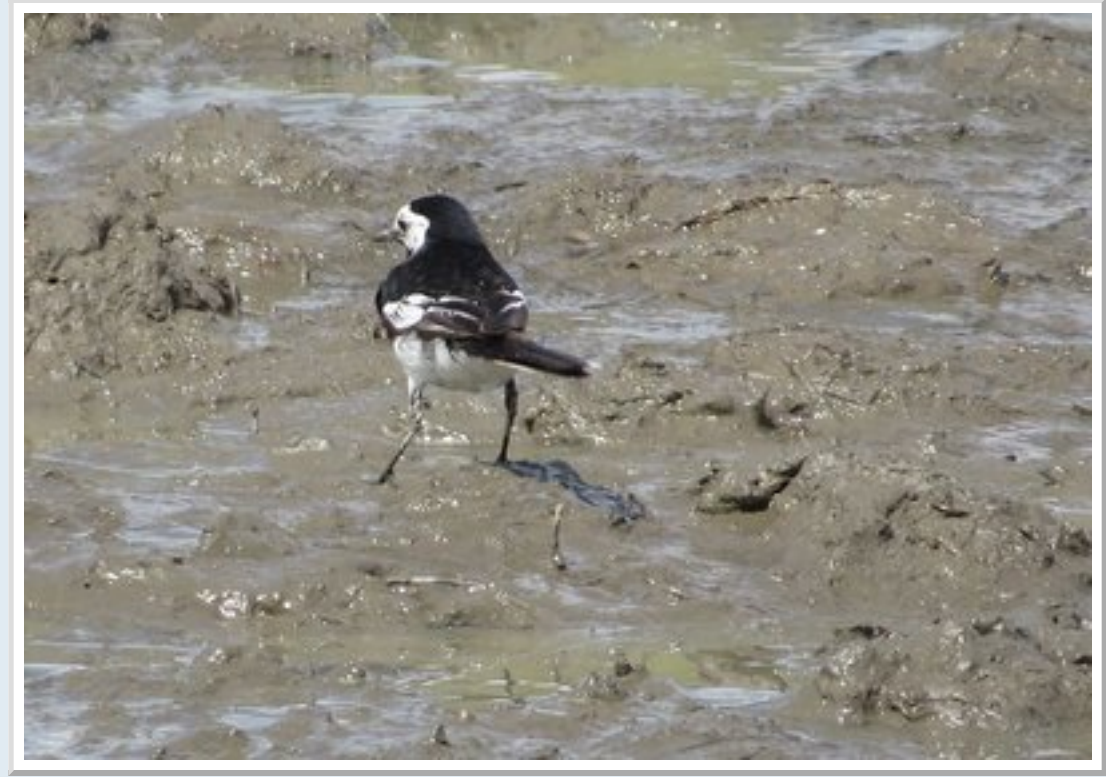
Male Pied Wagtail on the same mud as the Lapwing above