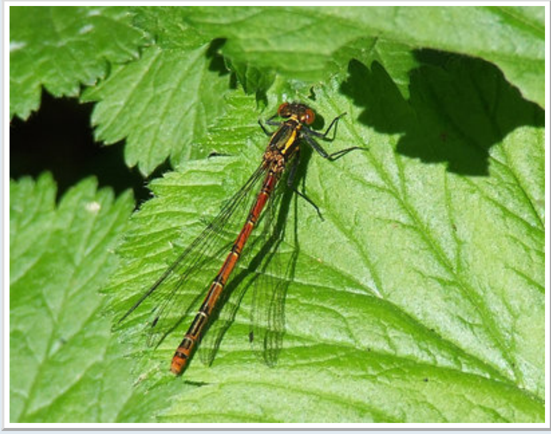
Female Large Red Damselfly