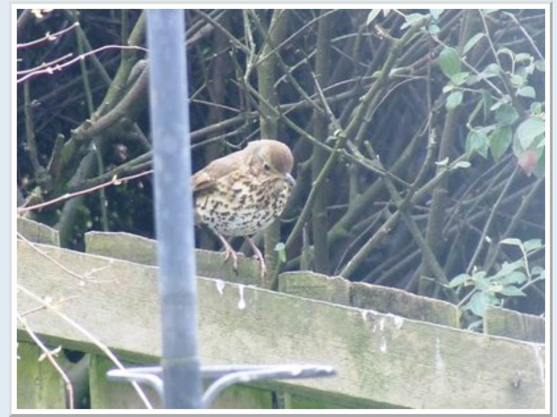
Song Thrush – a very unusual bird in my garden

Spent part of the day taking shots from the house