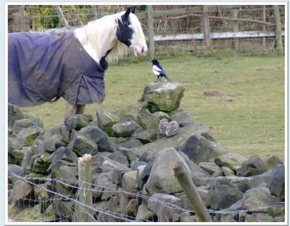
Two Little Owls having a cuddle to keep warm in the wind