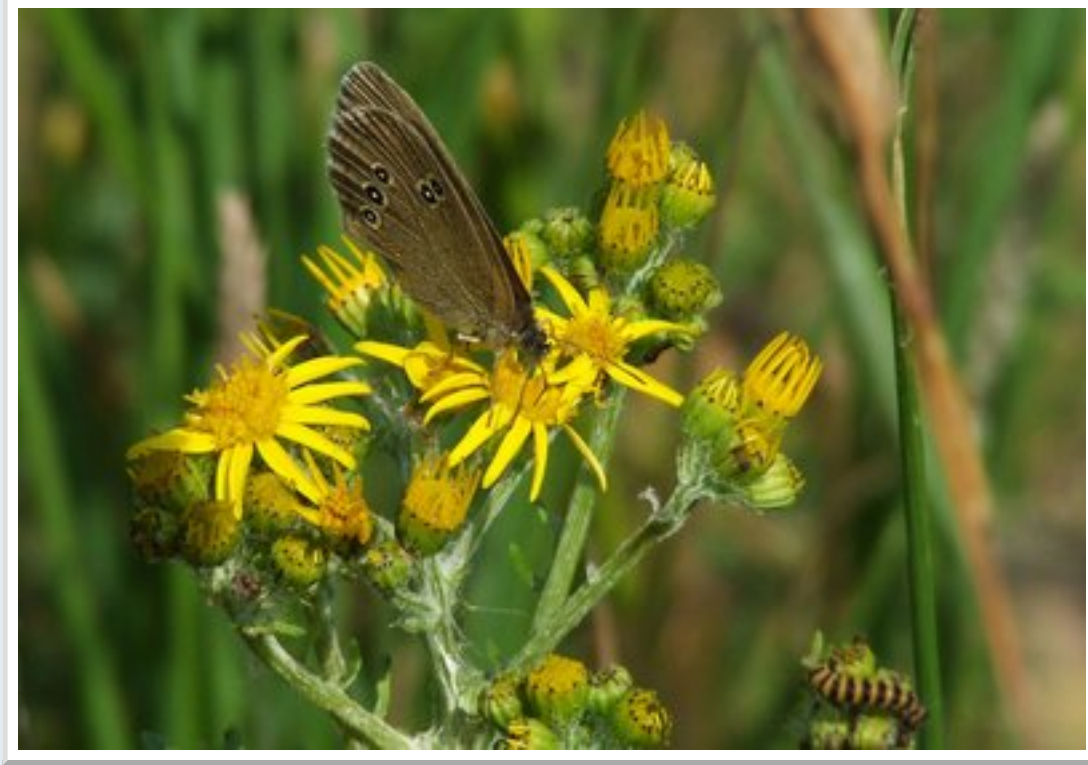
Ringlet and Cinnabar Moth caterpillar