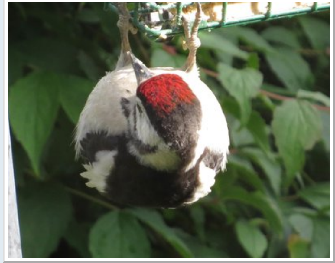
Great Spotted Woodpecker