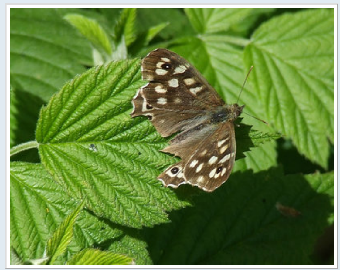
Uppersides of the same butterfly- damaged but only a few days old