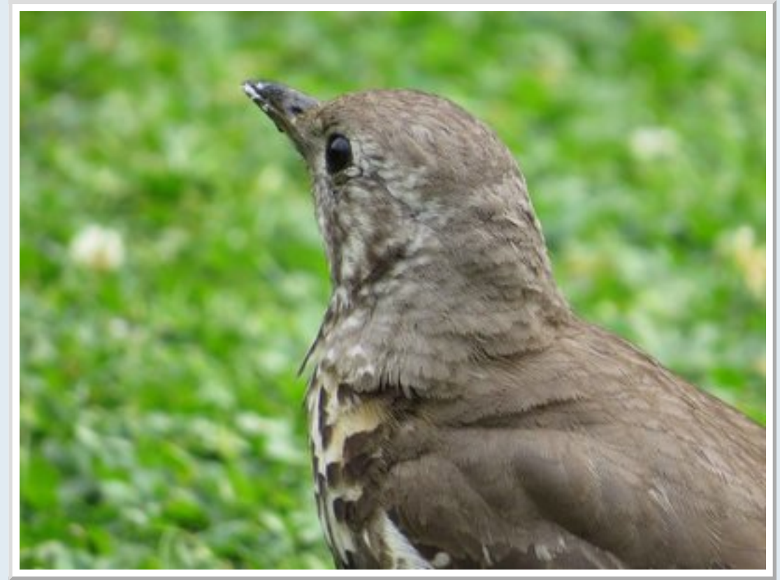
Mistle Thrush – currently a regular visitor in my garden