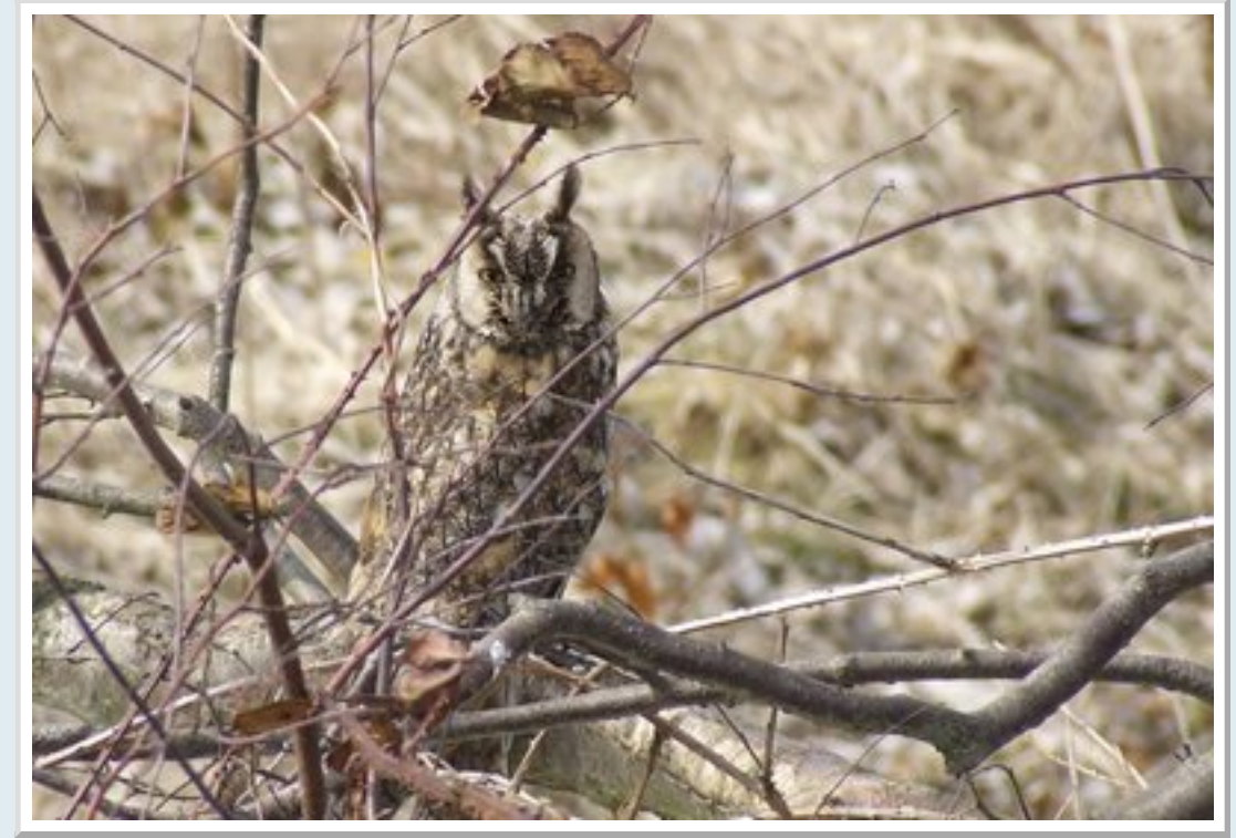
Long-eared Owl on Heights Lane