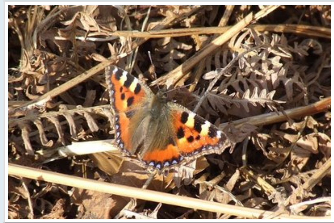
Small Tortoiseshell – my first butterfly picture for 2013

Back to the present day – if not for the wind it could have been summer today never mind spring – about 16 – 18 in parts of Yorkshire, first signs of Cherry Blossom this morning and more buds appearing by the day. I am in the latter part of using public transport at the moment till I replace my car – one benefit is on good days I can take a diversion on my way home, hence I am carrying my camera in my work bag at all times just in case. I did this tonight anf finished the trip home with a walk through Prince of Wales Park. I was rewarded with two more Small Tortoiseshells – one flew away but the the other decided to bask in a flattened sun-facing bracken bed, so managed to get a few shots, it was very skittish though so left it in peace. Hopefully this is the start of a good period