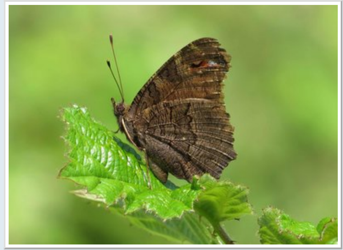
Peacock undersides – upperparts were quite worn