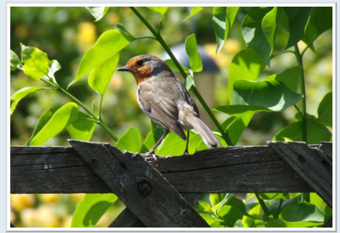
Study of a sun-dappled Robin in the garden