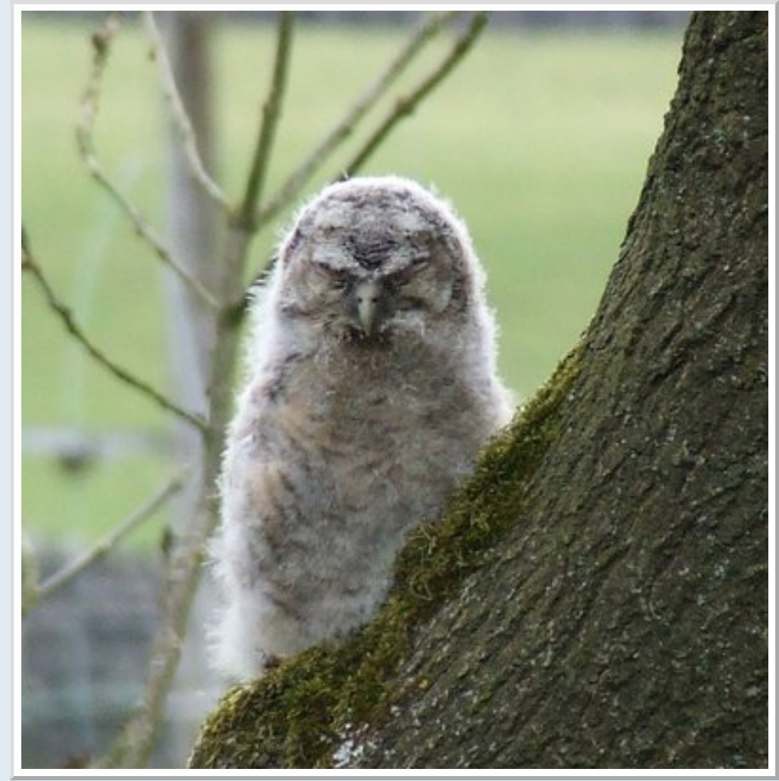
Young Tawny Owl

However the passerines seem to produce very cute youngsters