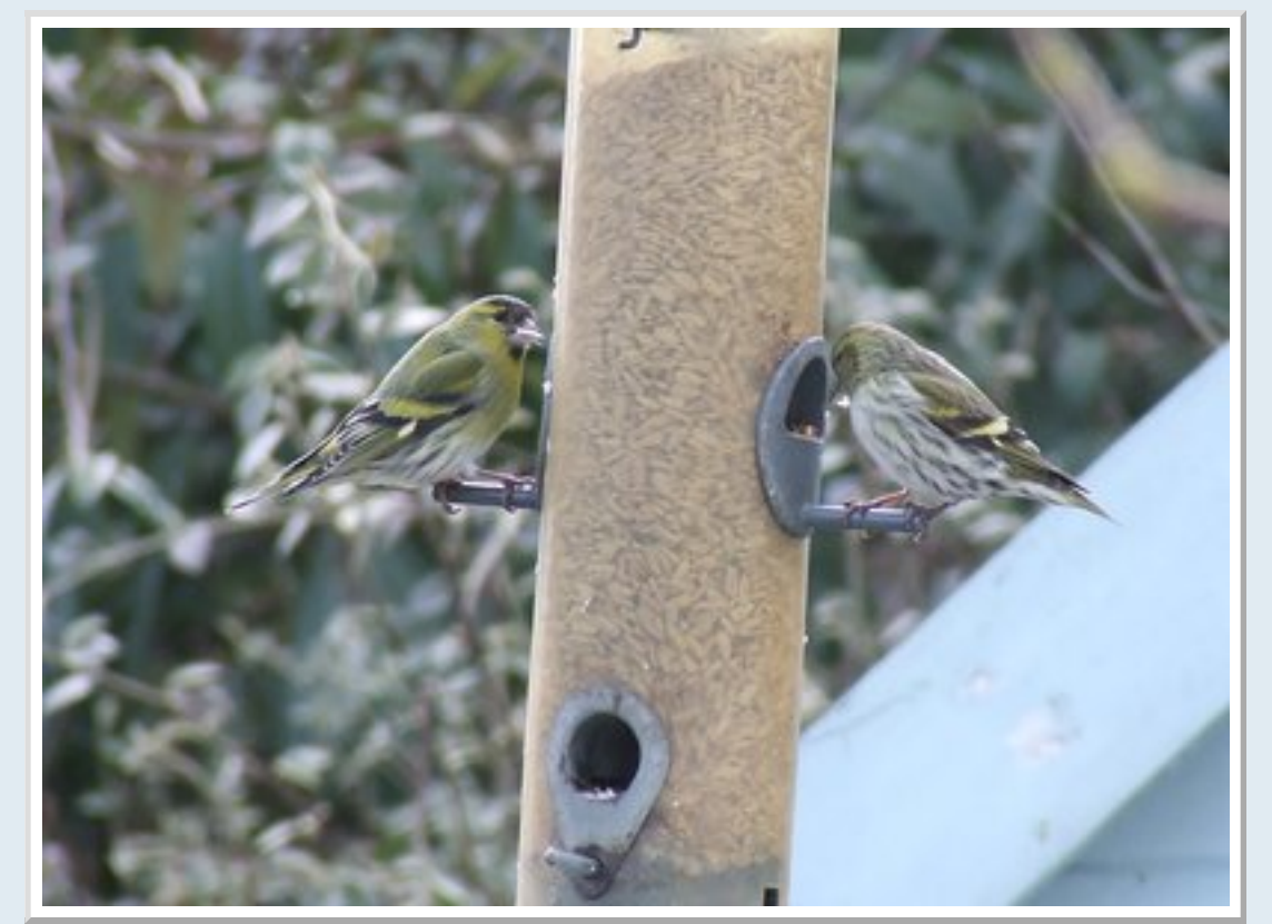
Male and female Siskin