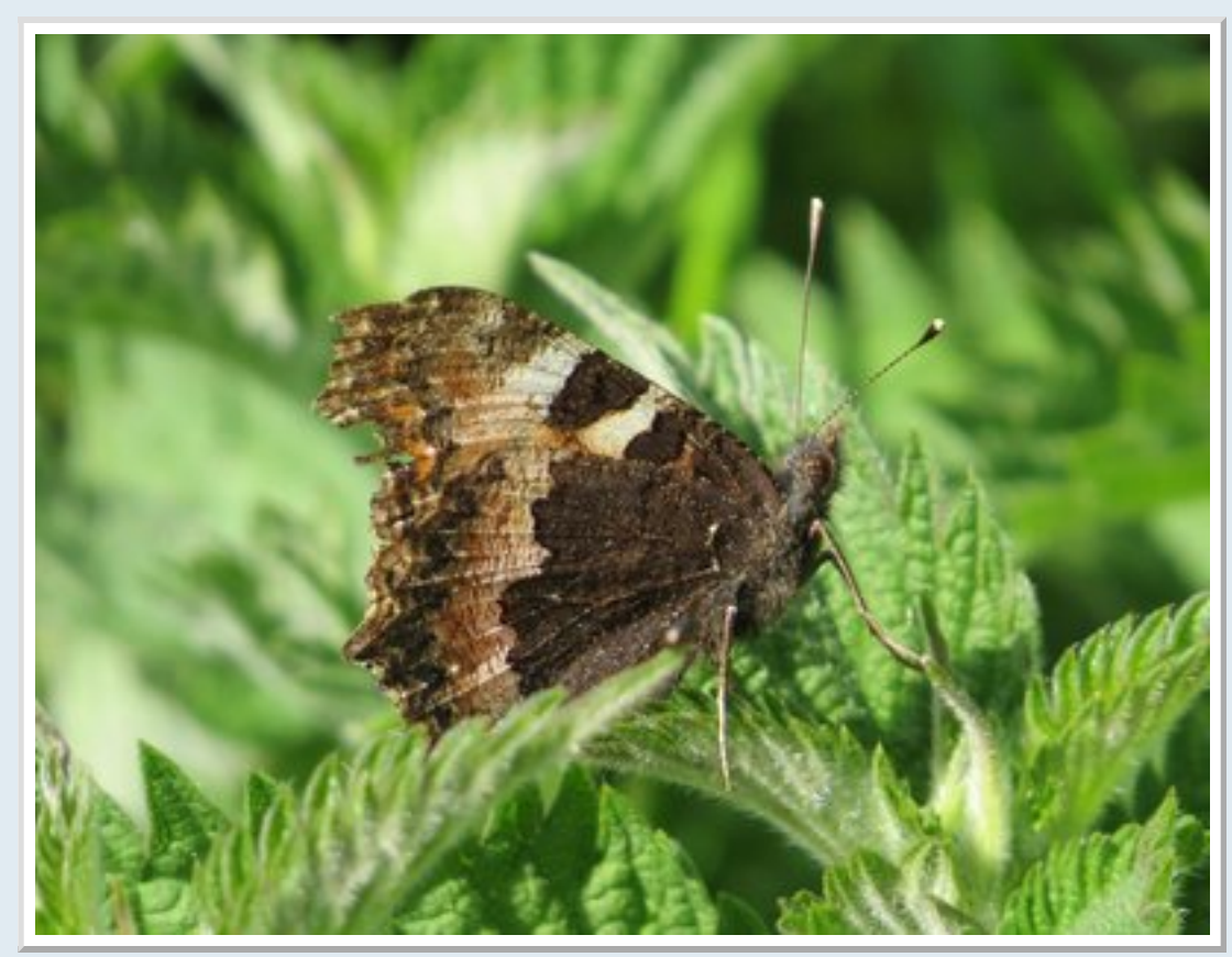
Small Tortoiseshell undersides

On he 8th made a very brief hobble up to see if the Little Owls were at home about a half mile from our house. Spotted a Small Tortoiseshell over a wall, shot from about 10 feet away and also found my Little Owl. It appears to have an unusual or defective right eye pupil.