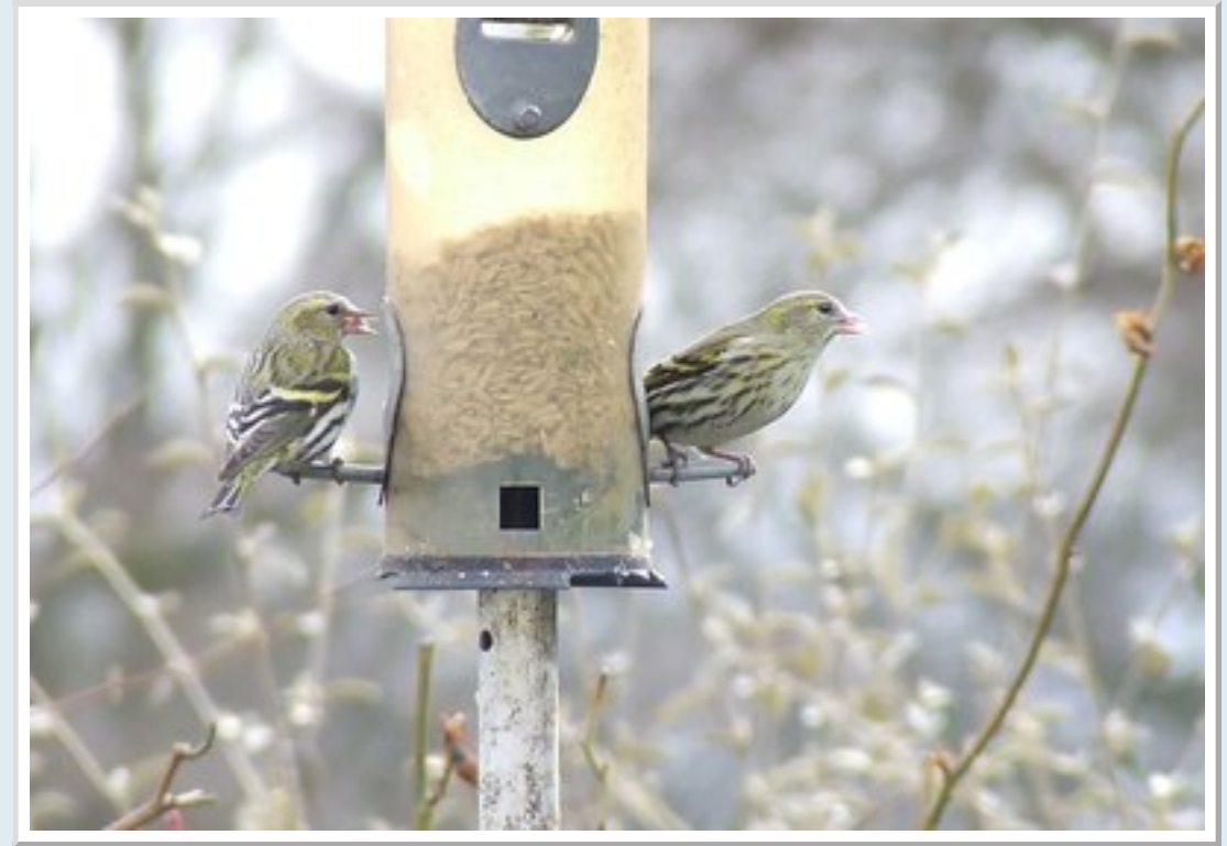
Siskins on the garden feeders