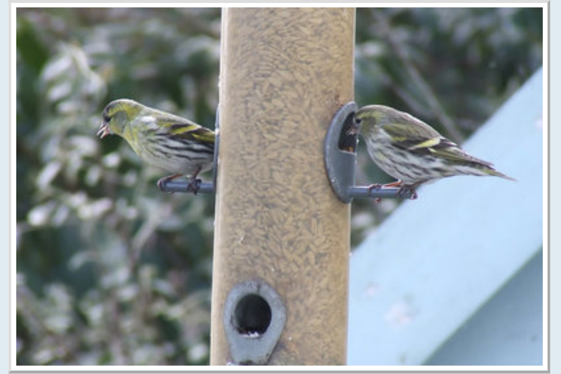
Male and female Siskin