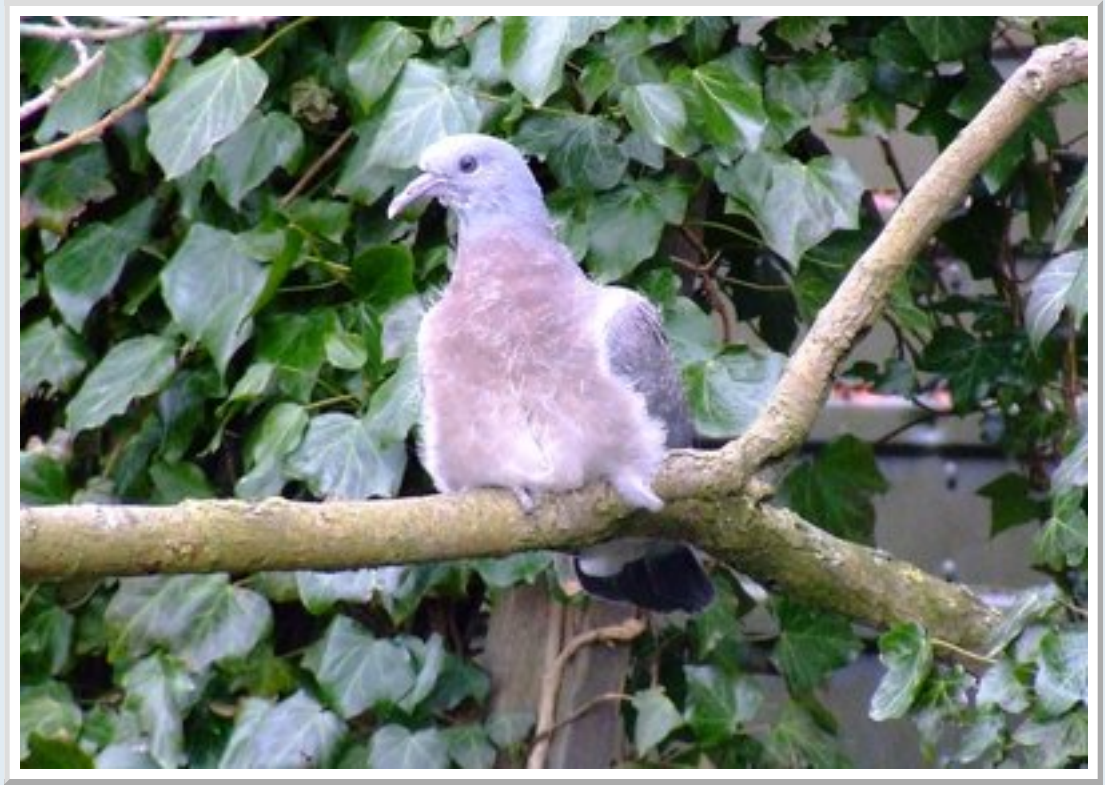
The young Wood Pigeon from Saturday