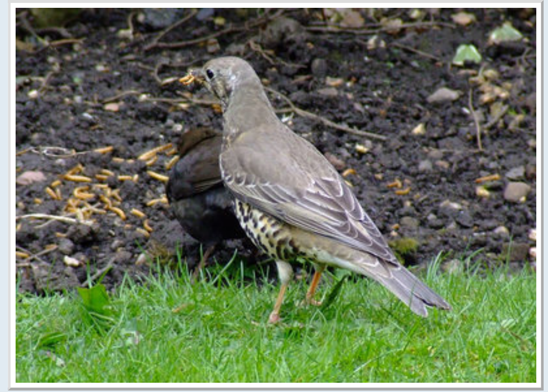
Mistle Thrush stocking up on mealworms

The finches continue to visit for the sunflower hearts next door with Chaffinch, Greenfinch, Goldfinch, Siskin and Bullfinch all seen regularly