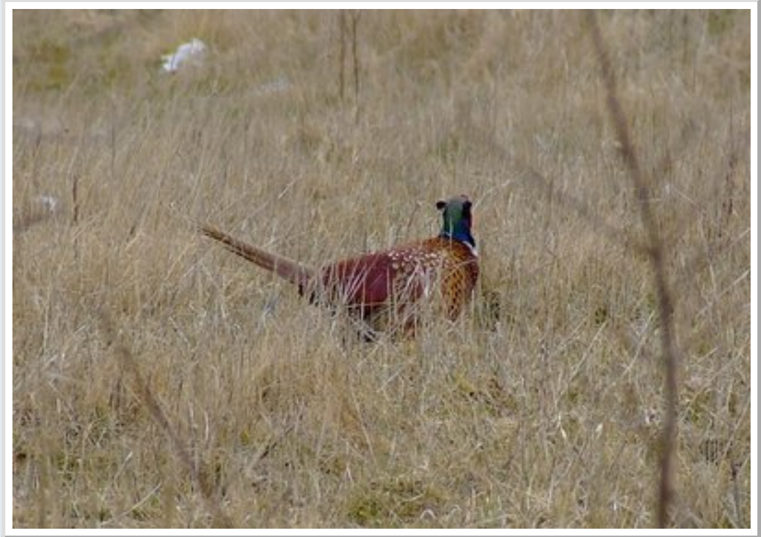
Most of the male Pheasants locally are of this gaudy type as opposed to being ring-necks

Well it is at least warmer, but still not ideal up here. Yesterday it was generally overcast with a very fresh wind and later becoming wet; today was warmer but extremely windy and changing from sun to overcast to wet in the space of a few minutes. Since the three tortoiseshells last Sat still no more butterflies seen, however yesterday I saw my first Swallow and today another. Also had a female Sparrowhawk hunting in the garden as I watched the feeders today but it didn't catch on the pass so didn't perch. The Long-eared Owl may have moved on as I failed to locate it yesterday, but compensation in two Little Owls together. It still does not feel like Spring up here yet, and there is still snow lying in places