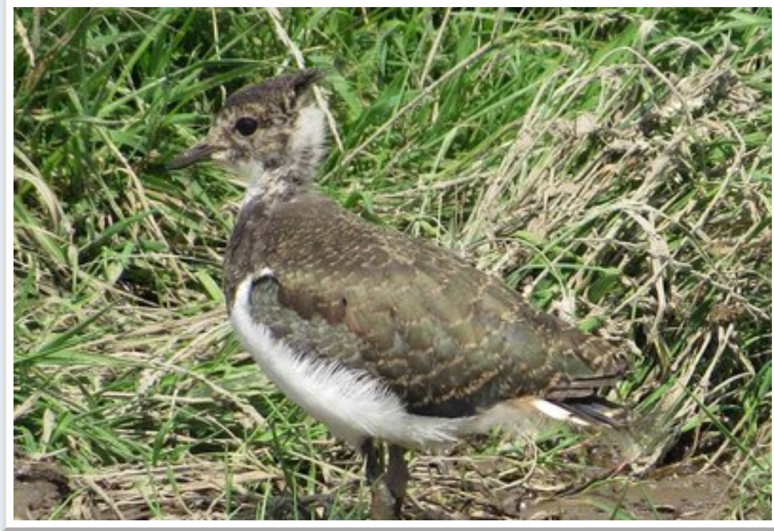
Lapwing chick (one of two) enjoying a mud patch which cattle had created near a seep in a field