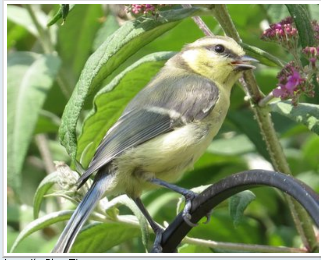
Juvenile Blue Tit