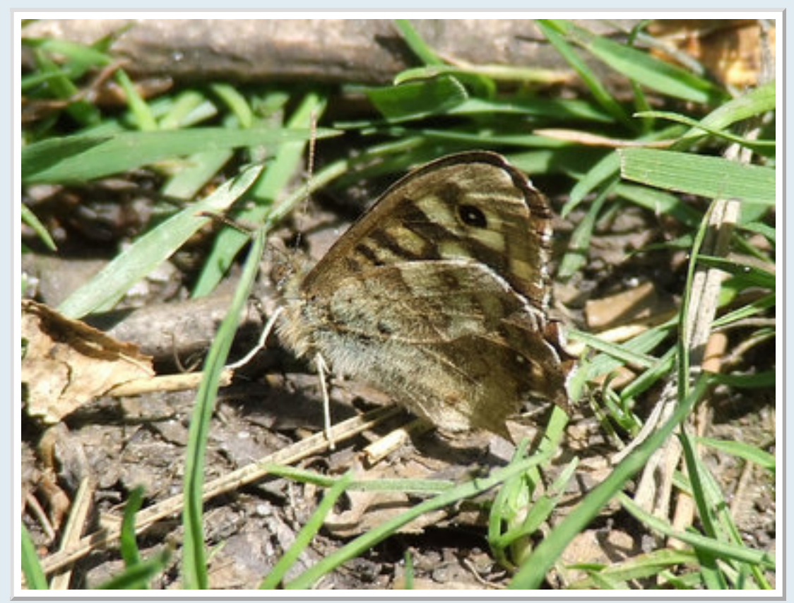
Speckled Wood undersides

By the last few days of May to early June I was limited to the usual common garden visitors and then in small numbers and sporadic visits except for a few species that appear to be feeding their chicks from what is on offer. On the 2nd June made another brief trip locally and found a small mixed flock of Grey and Red-legged Partridges then in Prince of Wales Park started turning up Speckled Woods. I had passed through the park on Friday evening coming home from work and saw none so expect these emerged on the 1st or 2nd, in addition a few more Green-veined Whites.