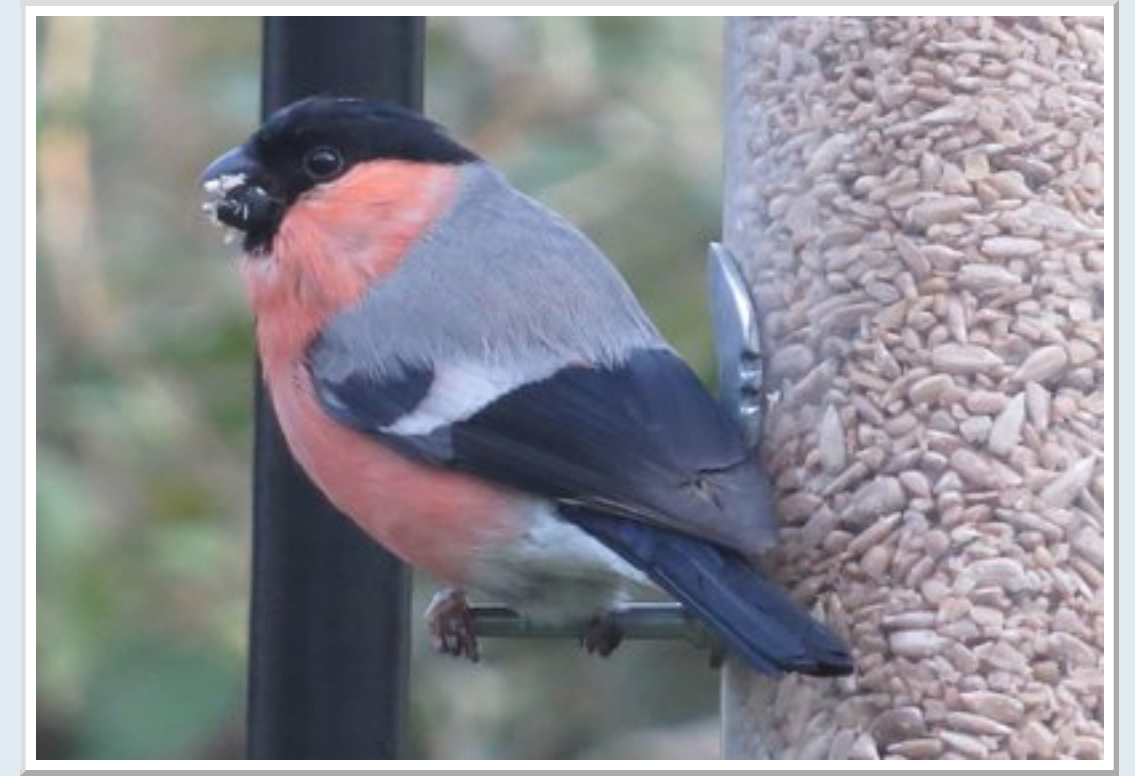
Bullfinch on my feeders