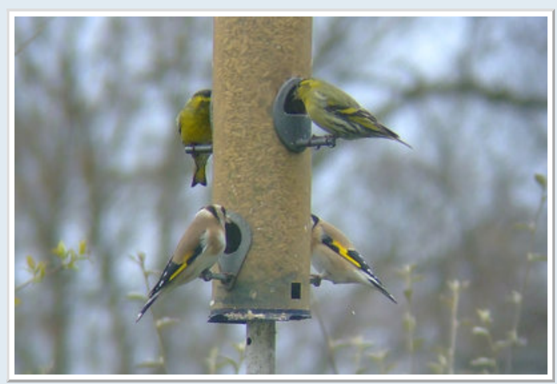
Siskin and Goldfinches, this image was digiscoped

The finches continue to visit for the sunflower hearts next door with Chaffinch, Greenfinch, Goldfinch, Siskin and Bullfinch all seen regularly