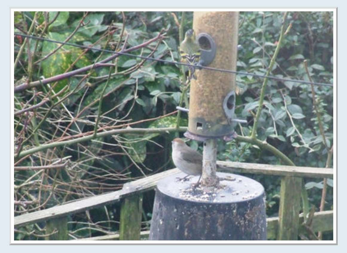
In January the garden also saw a Reed Bunting for a day or two

On the subject of overwintering warblers we were visited by a female Blackcap in February that was mixing with the large group of Siskins in the back gardens (this Siskin flock reached 30+ at one point)