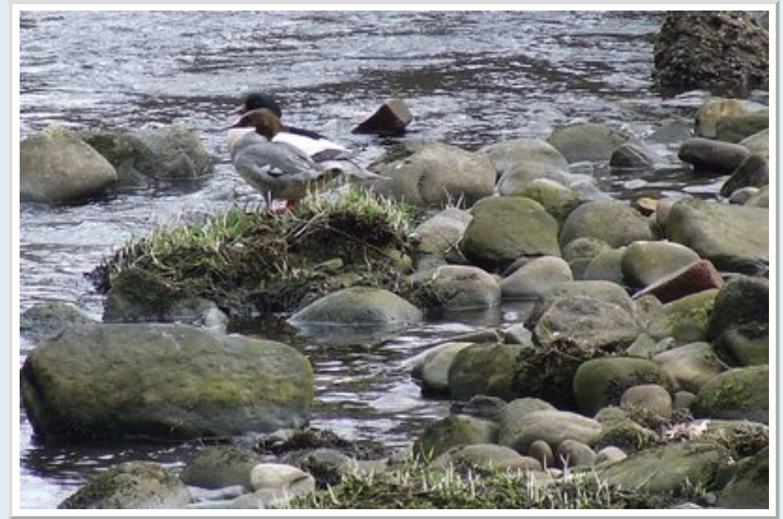
Pair of Goosanders on the River Aire just past Myrtle Park