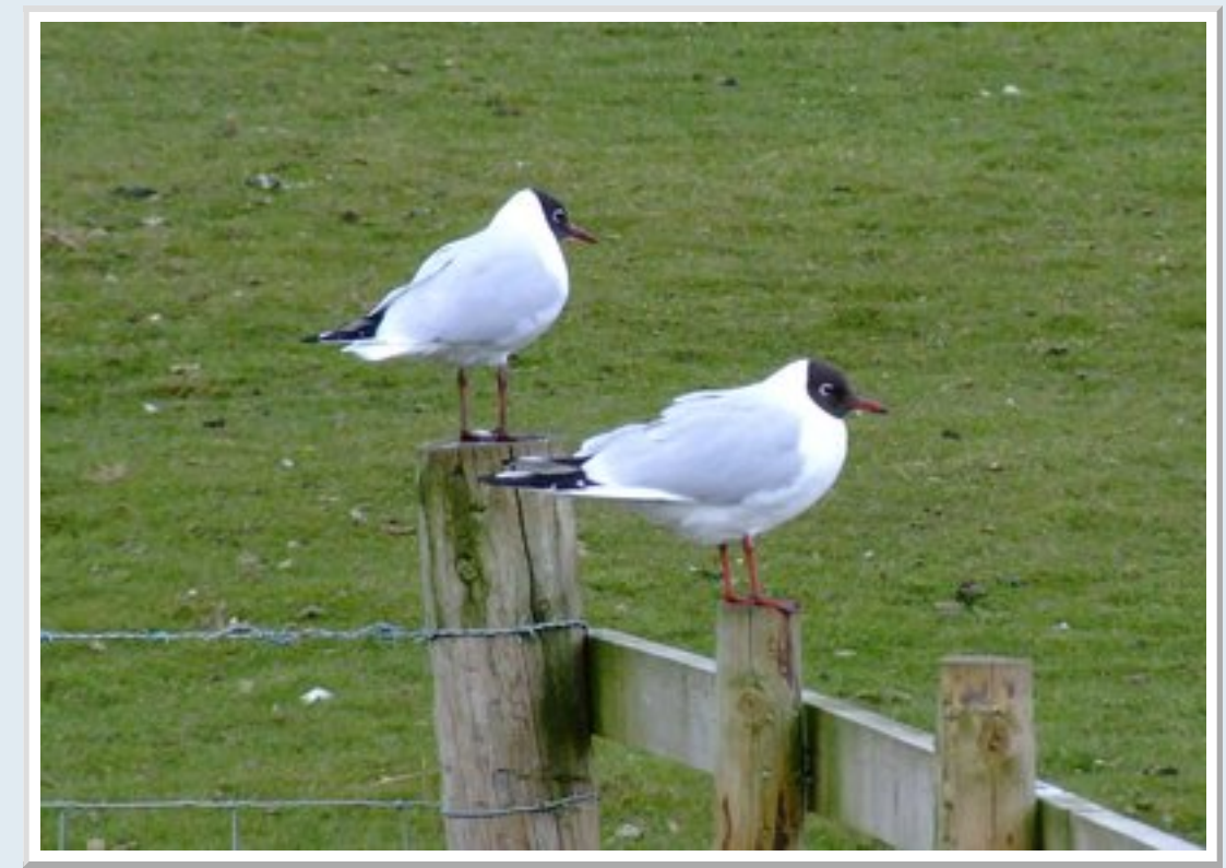
Black-headed Gulls - breeeding plumage