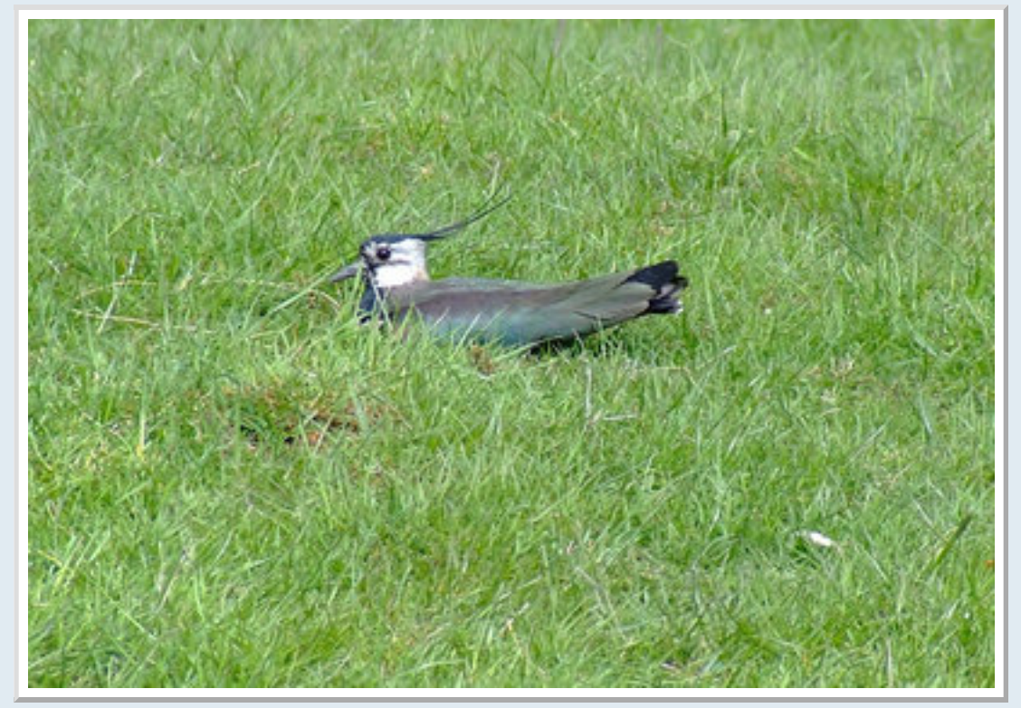
Lapwing near the breeding grounds

The birds visiting the garden later in May reduced but Bullfinch and Nuthatch put in good appearances and the first of the local songbird broods started