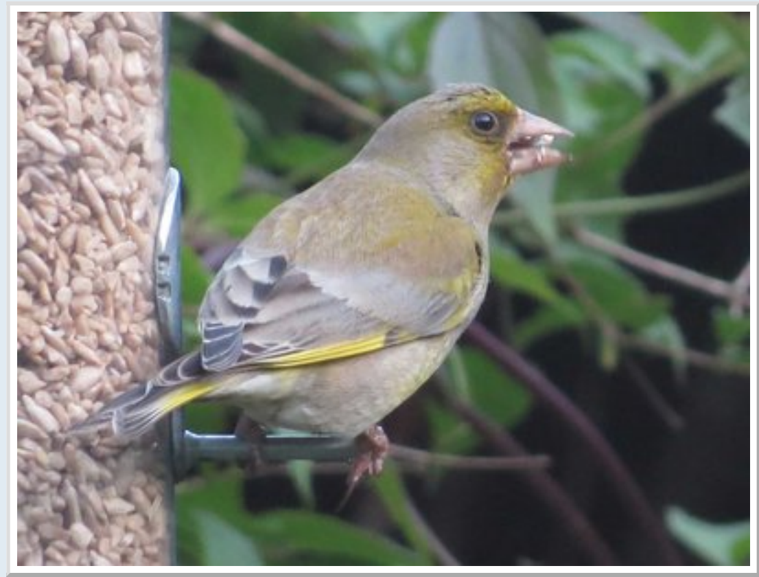
Greenfinch on the feeders

On he 8th made a very brief hobble up to see if the Little Owls were at home about a half mile from our house. Spotted a Small Tortoiseshell over a wall, shot from about 10 feet away and also found my Little Owl. It appears to have an unusual or defective right eye pupil.