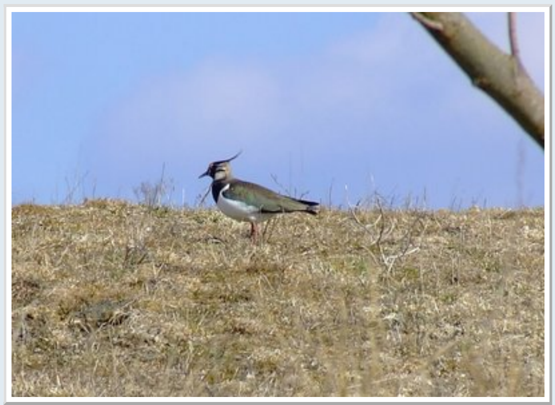
Lapwing on edge of breeding site on Saturday

Meadow Pipit in one of two small flocks on Heights Lane