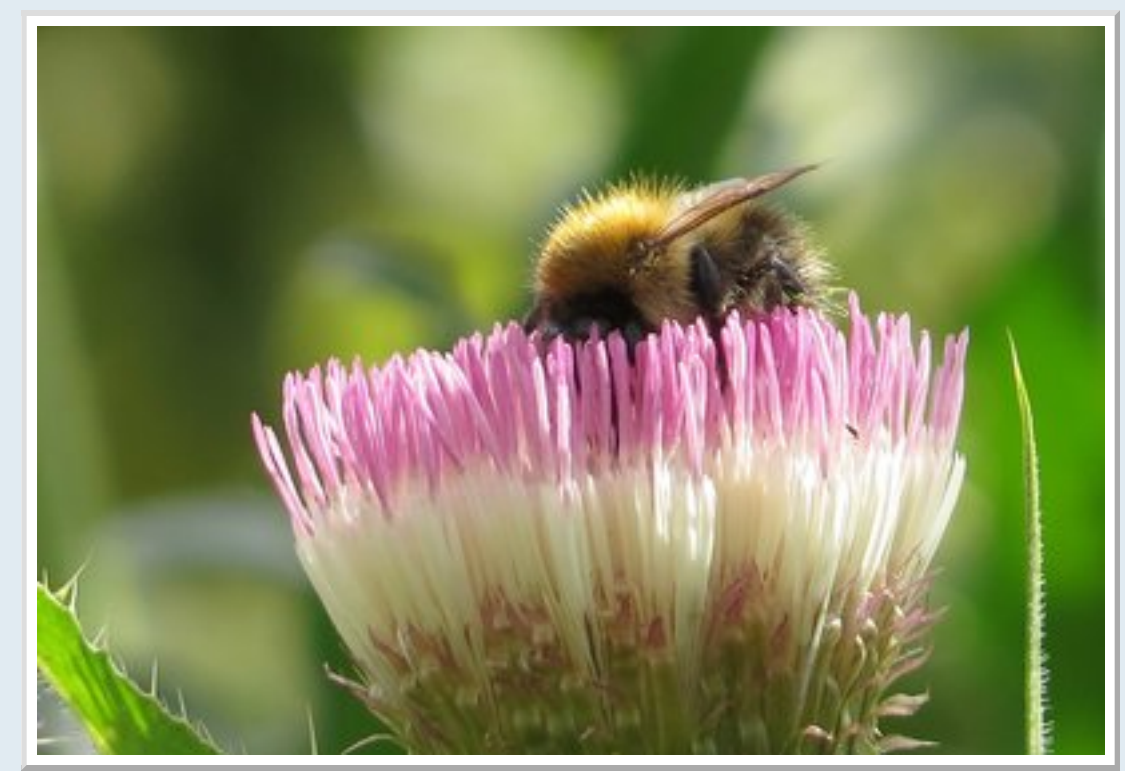
Bee in the garden