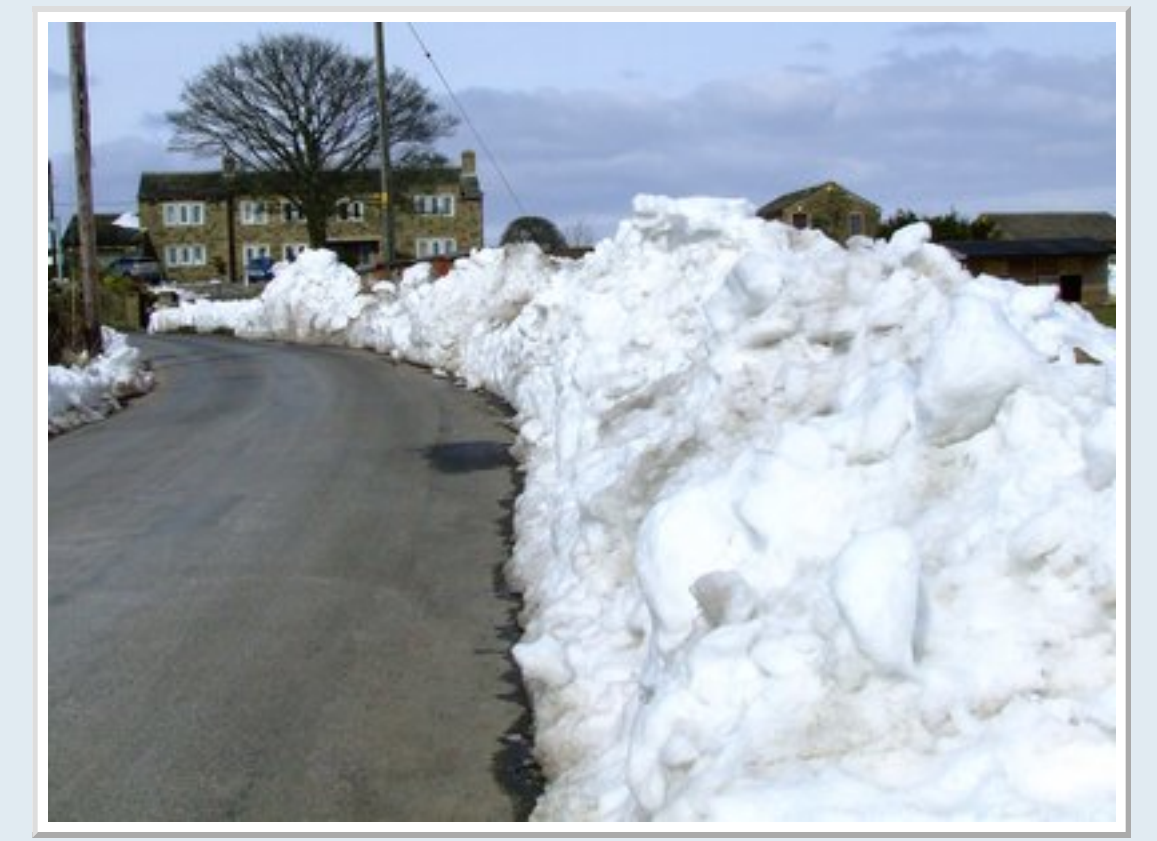
Snow still deep in places on Heights Lane

Looking back at my diaries I actually realise I saw very little of Butterflies till early May last year, although 2011 was better. Last year though, after a promising March, it did turn nasty in April