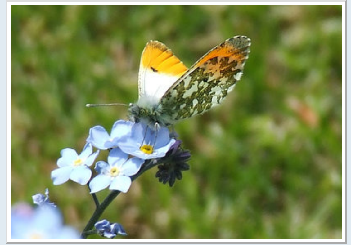
Male Orange Tip in the garden

By the last few days of May to early June I was limited to the usual common garden visitors and then in small numbers and sporadic visits except for a few species that appear to be feeding their chicks from what is on offer. On the 2nd June made another brief trip locally and found a small mixed flock of Grey and Red-legged Partridges then in Prince of Wales Park started turning up Speckled Woods. I had passed through the park on Friday evening coming home from work and saw none so expect these emerged on the 1st or 2nd, in addition a few more Green-veined Whites.