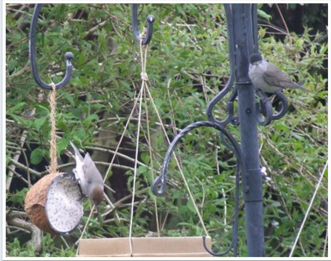
Male and female Blackcap in the garden