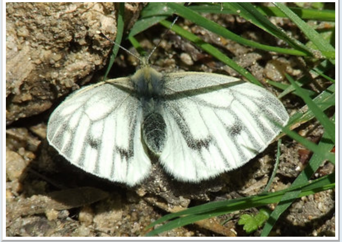
Female Green-veined White