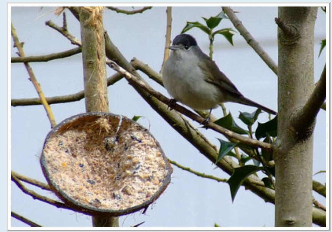
Male Blackcap gracing the garden for three days so far

So all my recent stuff has been from the trip to work or this weekend the garden. In two hours this morning I clocked 27 species including Jay and Sparrowhawk so I am not getting bored at least. Highlight of the weekend has been a male Blackcap which for three days (seen again this morning) now has been around the garden taking fat from the coconuts. Possibly it is from the copse on the main road and is struggling to find enough insects