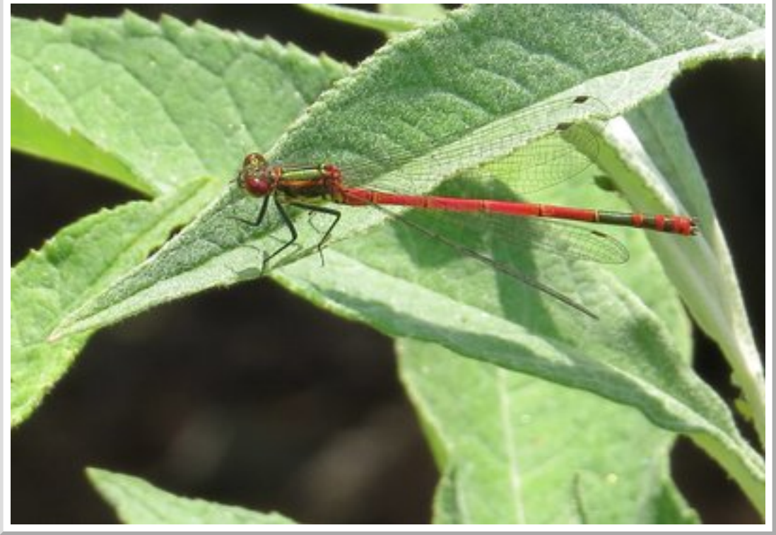
Large Red Damselfly in my garden – seen twice in one day but not since