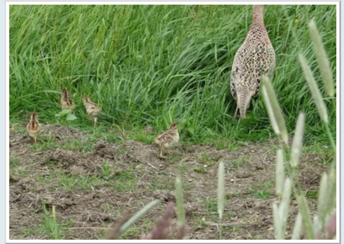
Pheasant – hen with chicks