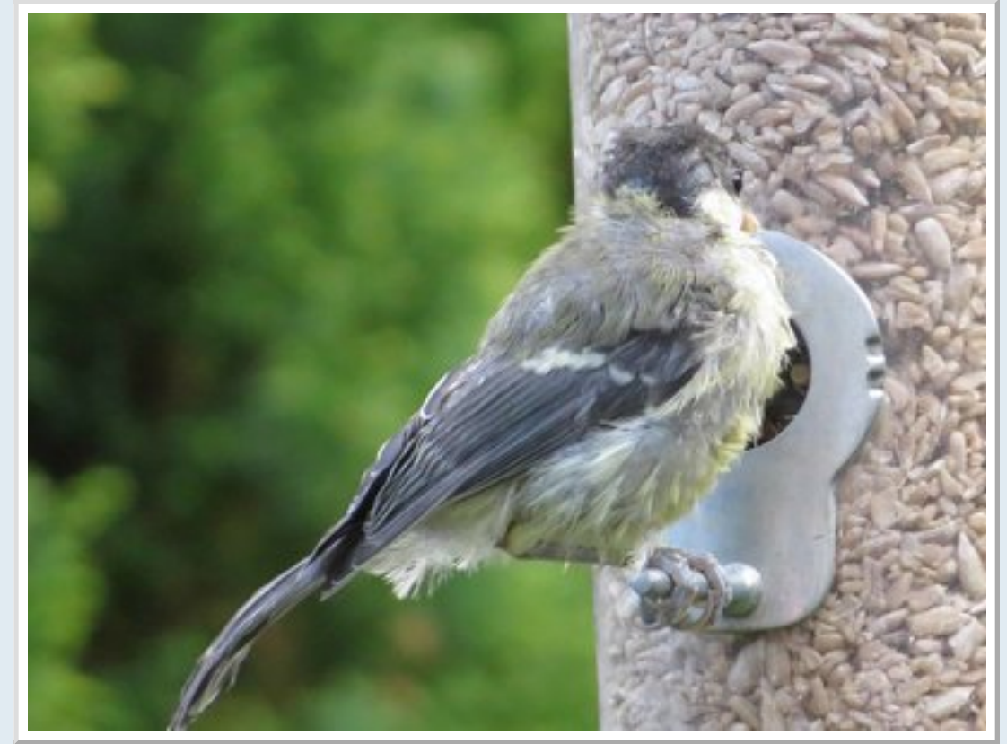
Great Tit – showing the cost of raising a family