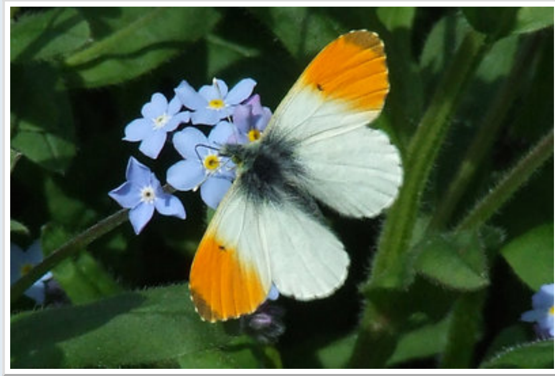
The male Orange Tip that paused next door

With Swifts appearing locally also over the past few days it appears spring is really here