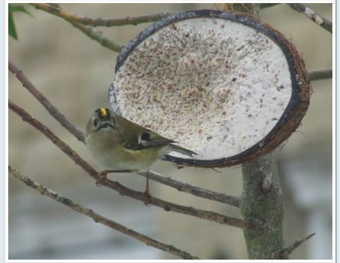
After a few days trying at last a decent shot of the front of the Goldcrest