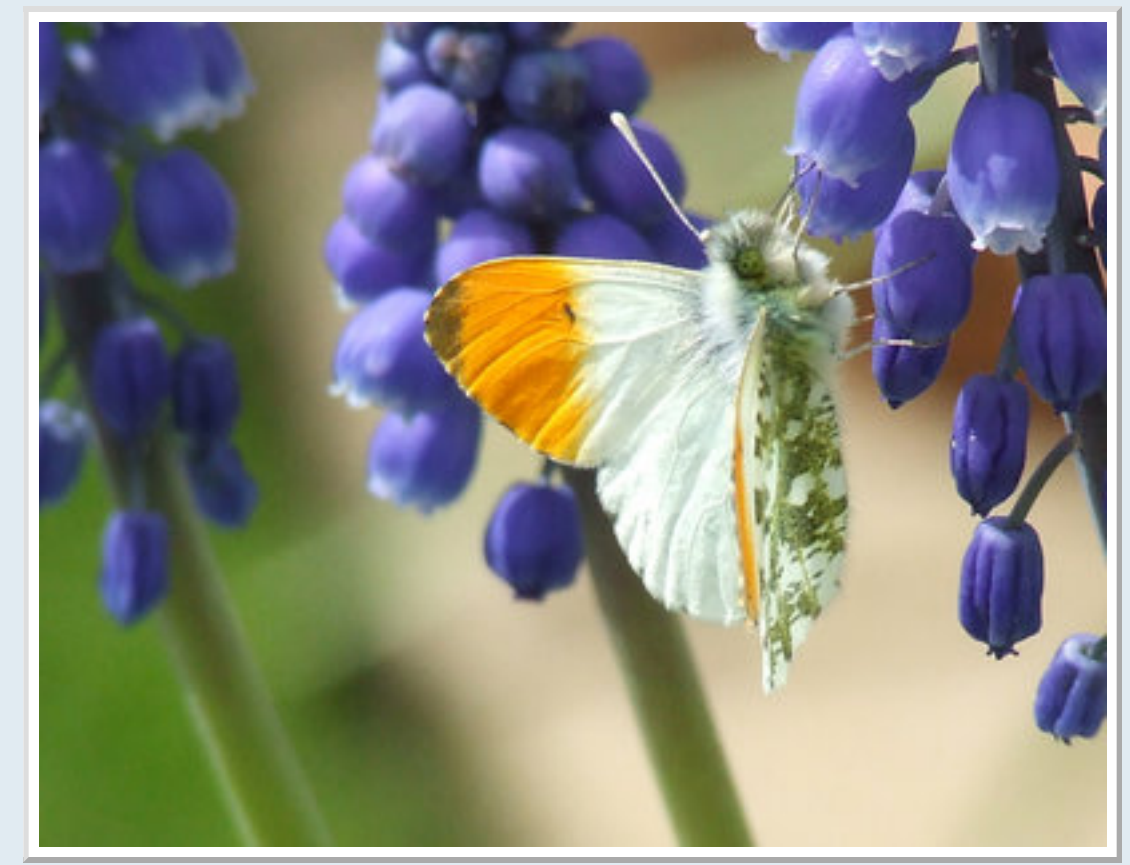
Partial undersides showing