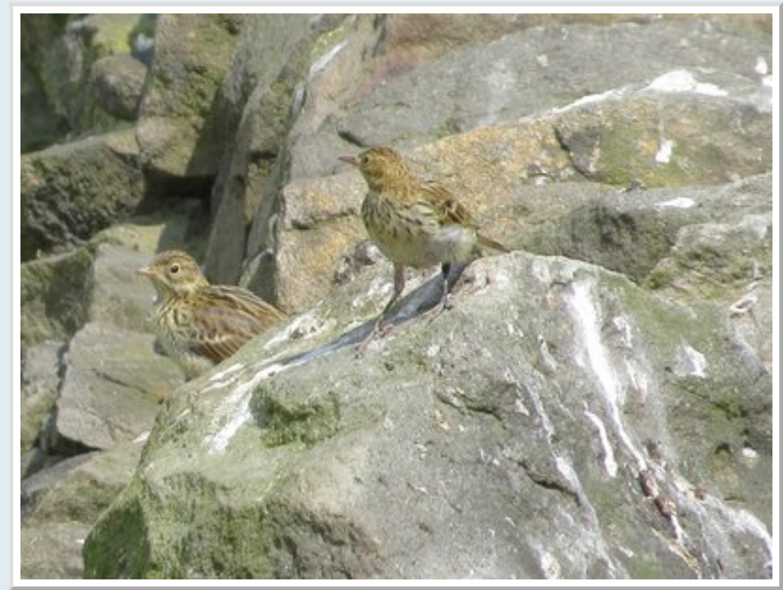
Two Meadow pipits on a wall nearby