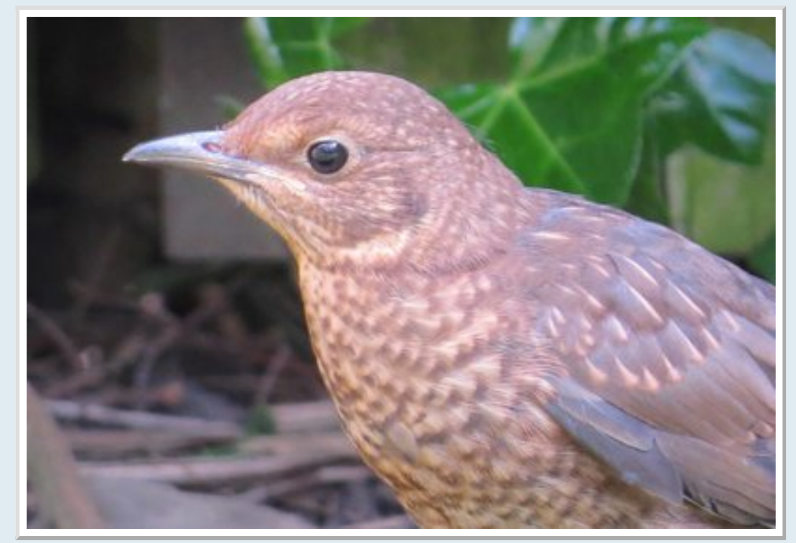
A bit more zoom applied