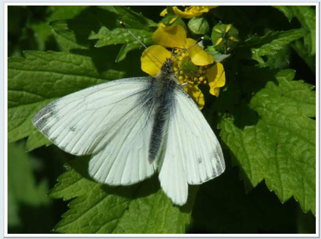
And a nearby male

From the 6th onwards I have been trying to get to grips with my new camera. I have stuck with getting another bridge camera but switched to the Canon SX50 which gives me a top magnification of 50 - 100x (35mm equiv of 1200 - 2400mm) which I am hoping will pull in those more distant birds for good shots, make closer ones more detailed and still gives a Macro facility down to zero. All the initial shots are in Auto as I get used to the functions