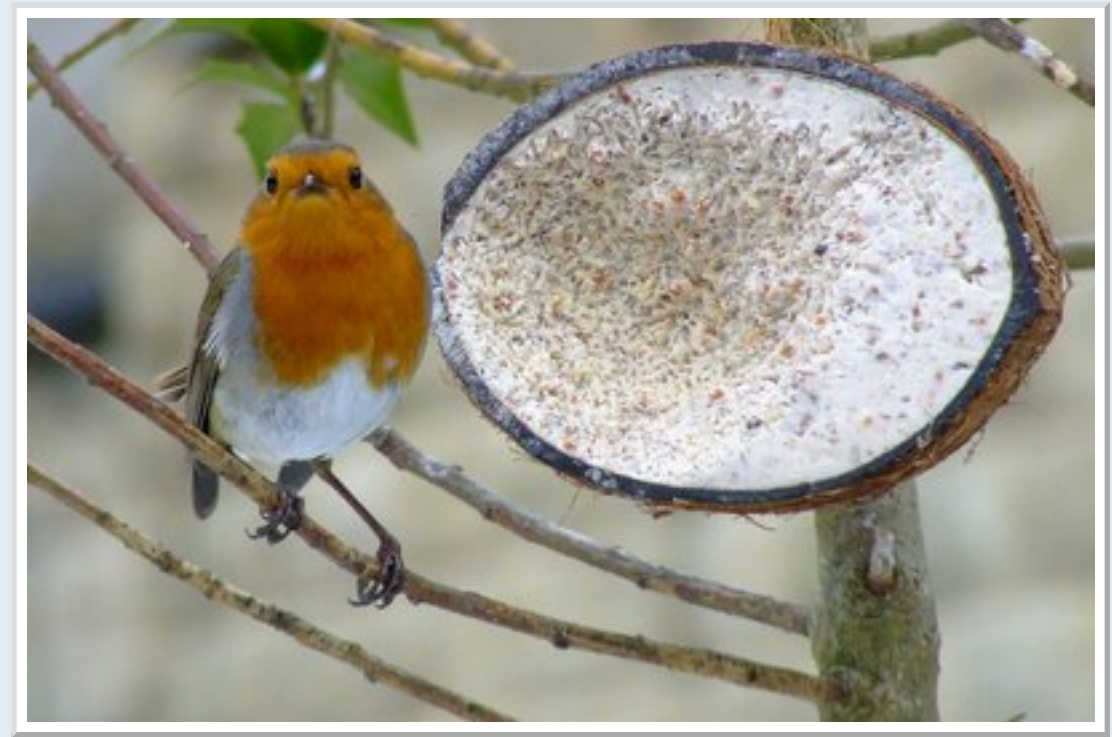
I am sure this Robin is now posing for the camera