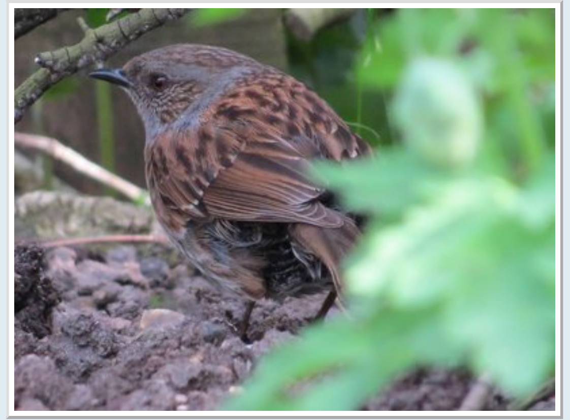
Dunock – pity about the plant

The day after I wanted to see how big a difference dragging the zoom up made, the shot below has been cropped absolutely minimal and was shot from about 6 yards. The Image Stabilisation system is very good even at the top end of magnification. I made a train journey later down to the Butterfly Conservation reserve at Shipley station not too far from me; hoping to see Common Blue but to no avail, the plaque and info there stated June – July so may try again later. The females here are very blue so it says. The reserve itself is actually a quite small fenced off area sitting between platforms and car parks but still has a list of about a dozen species