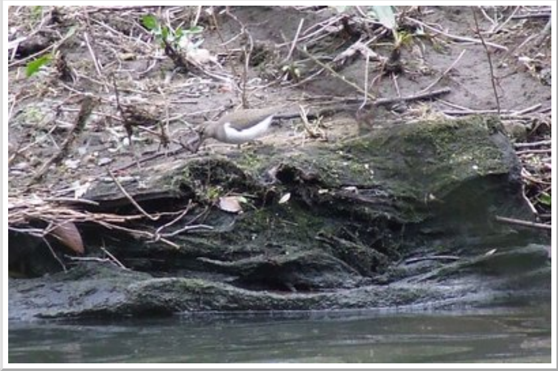
One of the Common Sandpipers but on the wrong bank from my point of view