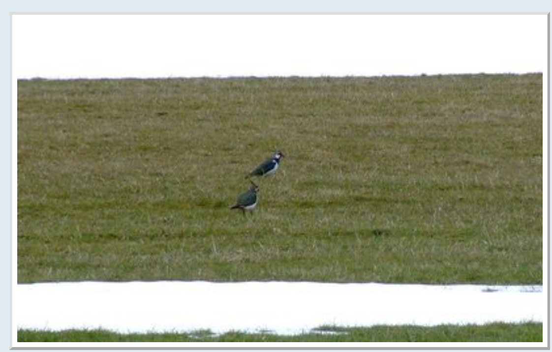
Lapwings gathering near the local breeding site

Spent part of the day taking shots from the house