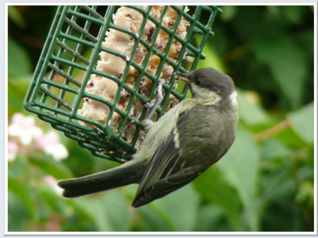
Young Great Tit

However the passerines seem to produce very cute youngsters