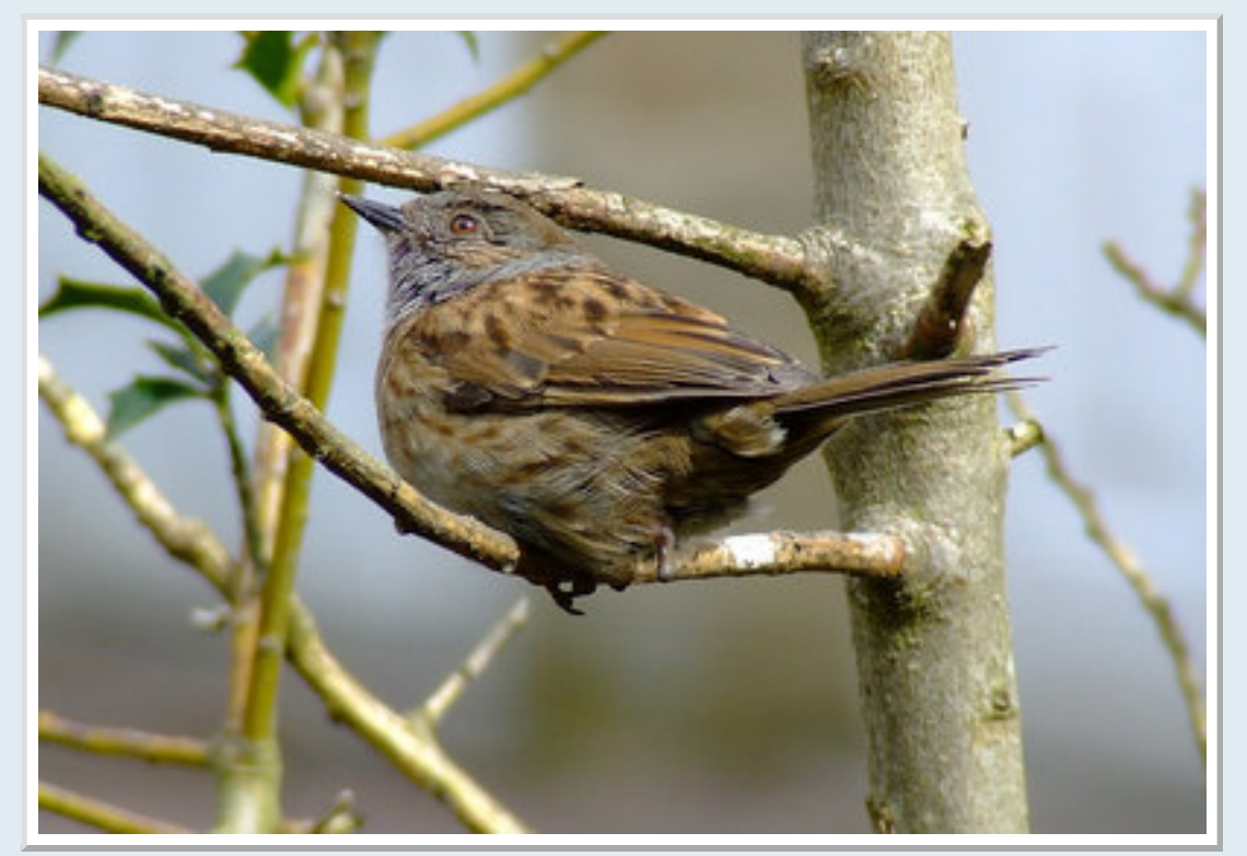
My friend the one-footed Dunnock

Lastly I would like to introduce you to an old friend of mine – a Dunnock. I first saw this individual back in early 2011 he (I believe it is a male) was obvious as he had a leg problem and was trailing one foot he wouldn't use. Despite this he sang in the spring, mated and I believe actually raised a brood that year. During 2011 at some point the actual foot itself fell off leaving just a stump. I permanently have two fat coconuts out front of the house in a holly (seen above on the Blackcap) and this is where I see him most often. Then last year I saw him not at all for a long period and presumed his missing leg had left him as easy prey for one of the local cats or the Sparrowhawks that use the gardens here as a take-away. But no, he re-appeared. Now in 2013 he is still around and I took the picture below yesterday in the usual spot I see him. If you look at branch he is on forward of the white mark you can see the stump of his leg hanging down. This shows how remarkably stubborn life can be in adverse conditions I think