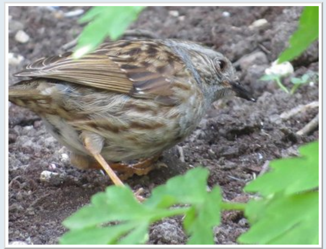
Dunnock after upping the zoom a bit more

The day after I wanted to see how big a difference dragging the zoom up made, the shot below has been cropped absolutely minimal and was shot from about 6 yards. The Image Stabilisation system is very good even at the top end of magnification. I made a train journey later down to the Butterfly Conservation reserve at Shipley station not too far from me; hoping to see Common Blue but to no avail, the plaque and info there stated June – July so may try again later. The females here are very blue so it says. The reserve itself is actually a quite small fenced off area sitting between platforms and car parks but still has a list of about a dozen species