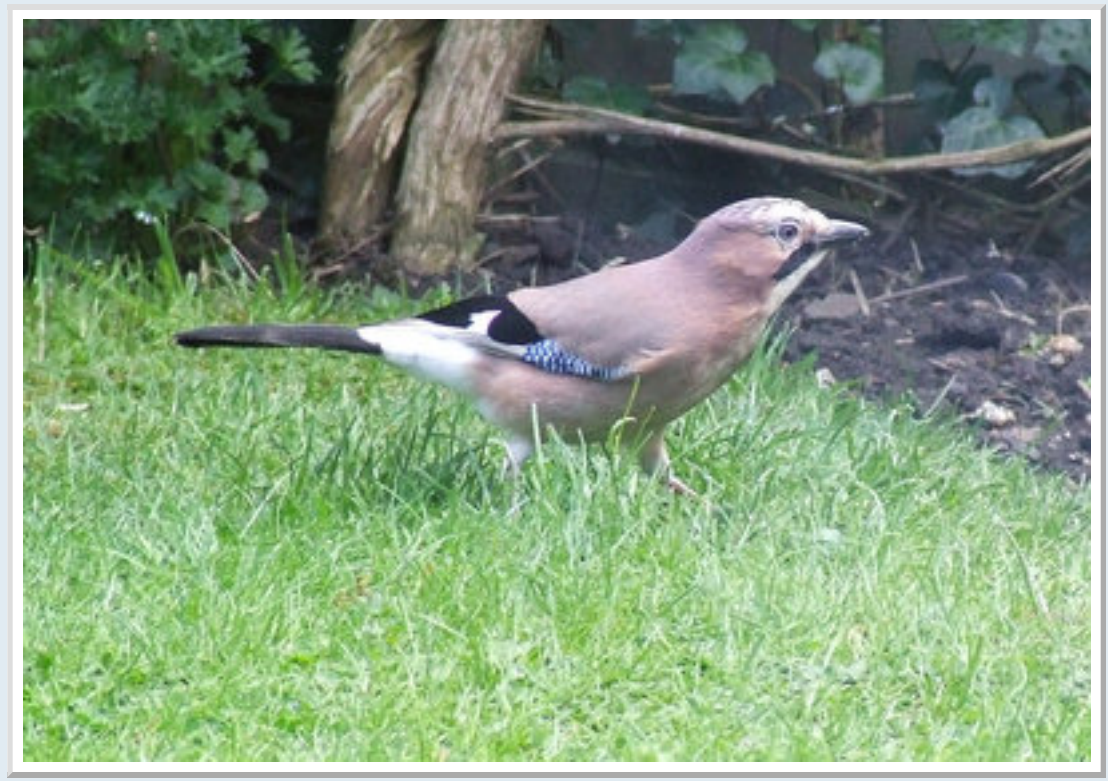
Jay on the lawn

The Blackcaps stopped visiting around the 11 – 12 May, but that coincided with the start of visits from a pair of Great Spotted Woodpeckers and an occasional visit by a Jay. Funnily enough the Siskins stopped calling around the same time.