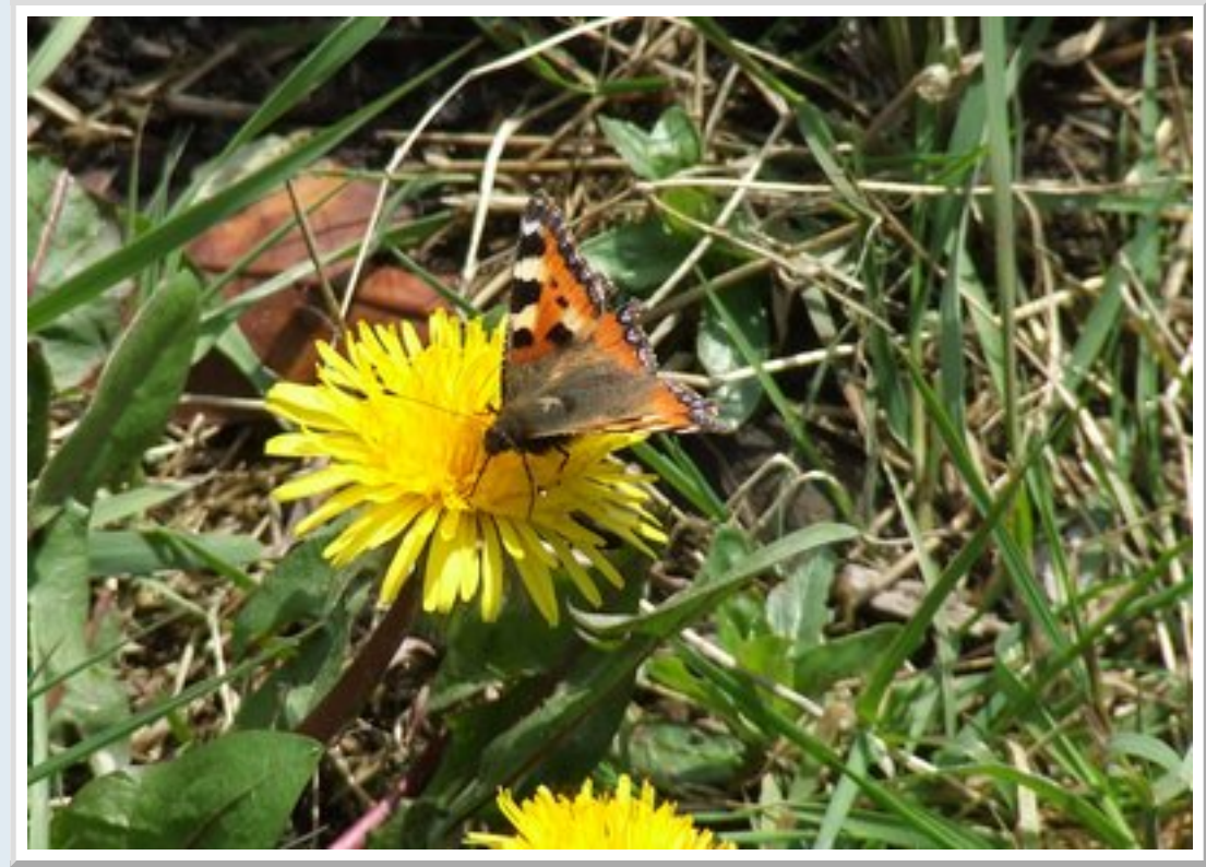
One of the shots of todays ST feeding on dandelions

Passing the allotments near 5-rise Locks on my way home saw my only butterfly of the day a Small Tortoiseshell feeding on dandelions. Still the only species I have seen yet.