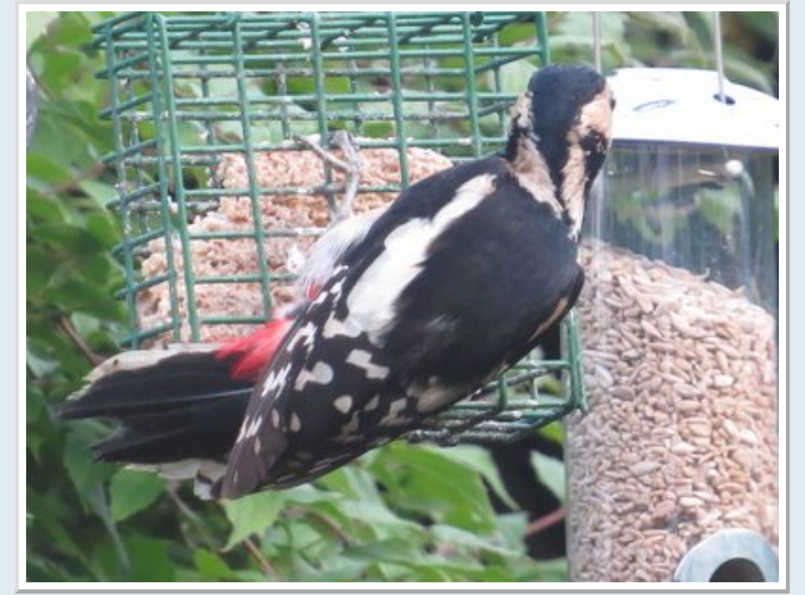
Great Spotted Woodpecker on the feeders