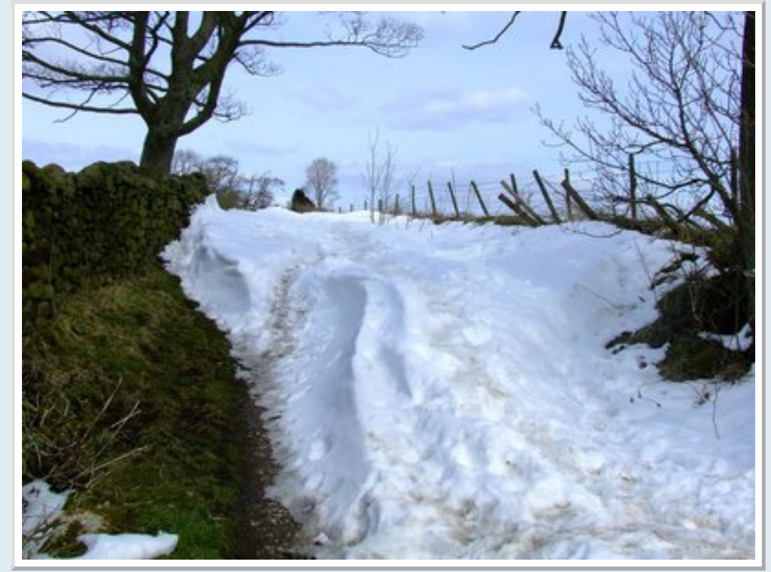
The track past Eldwick Reservoir came to an abrupt halt