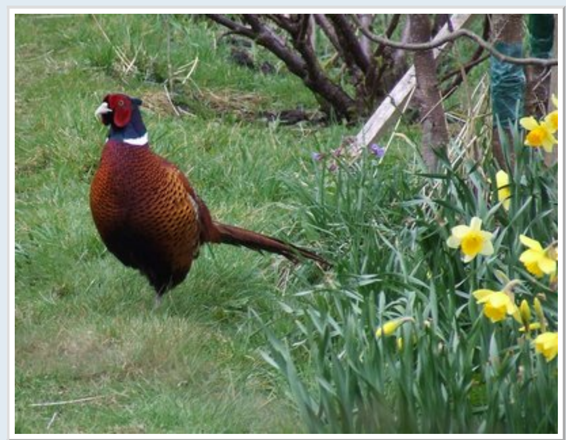
A spot of colour with a gaudy male Pheasant in the allotments near Myrtle Park