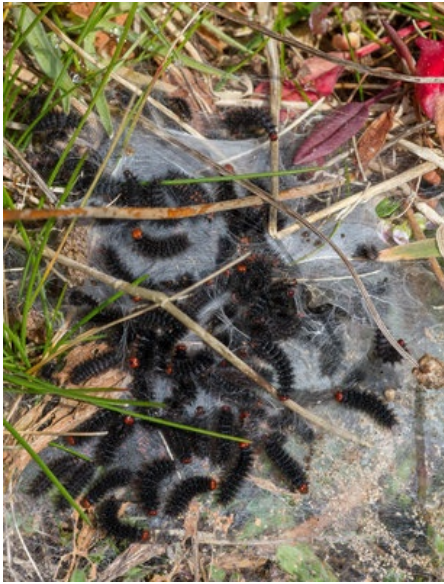
6th instar larva (mostly!) having built a new dense web