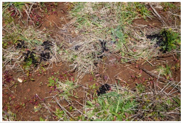
A shot to provide some context