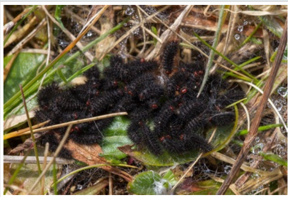
5th instar larvae