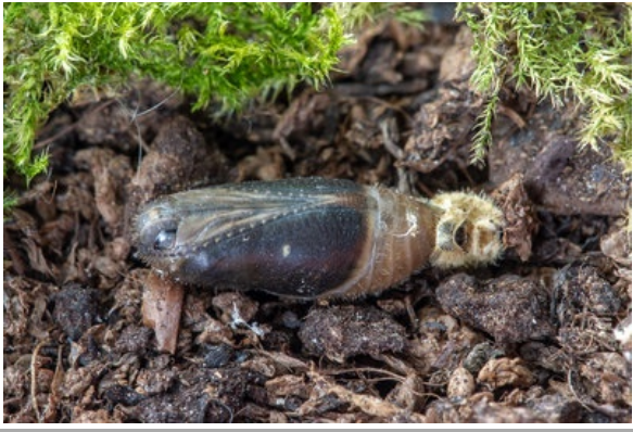
Northern Brown Argus – you can see the white dot!