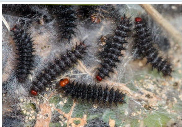
5th instar larvae with a 6th instar – easily distinguished based on the size of the head