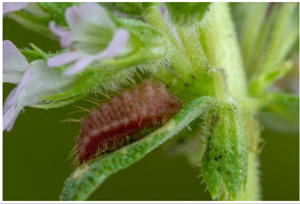
Large Blue – final instar