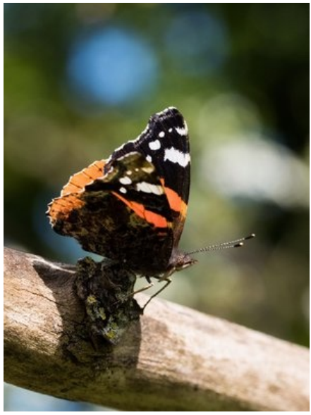
This Dingy looked very fresh!