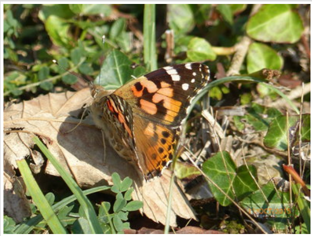
Painted Lady at Beeding.