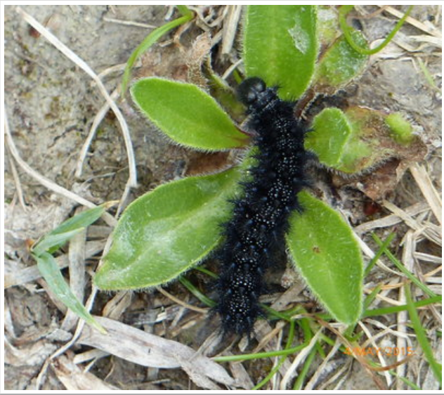
Marsh Fritillary larva