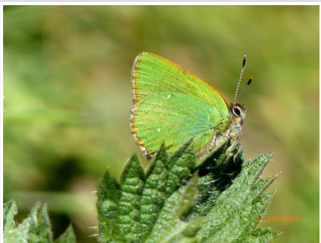
Green Hairstreak, Hengistbury Head.