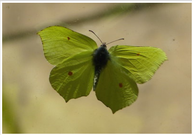
Brimstone in conservatory.