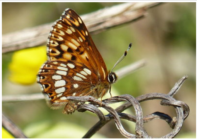
Duke of Burgundy, one of many.