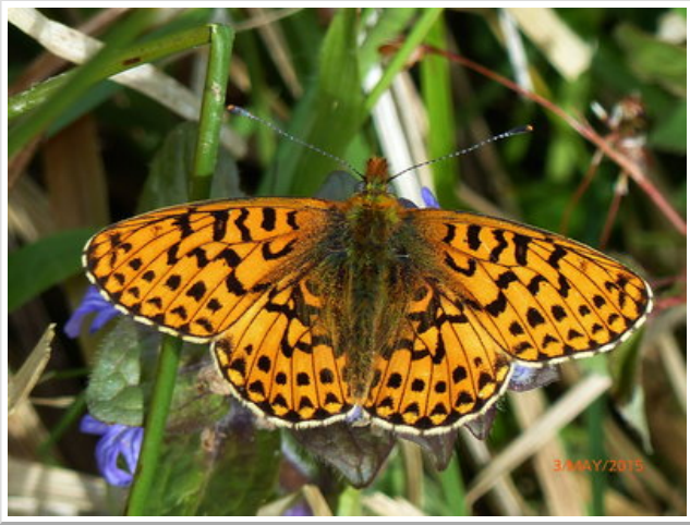
Pearl-bordered Fritillary, Bentley Wood.