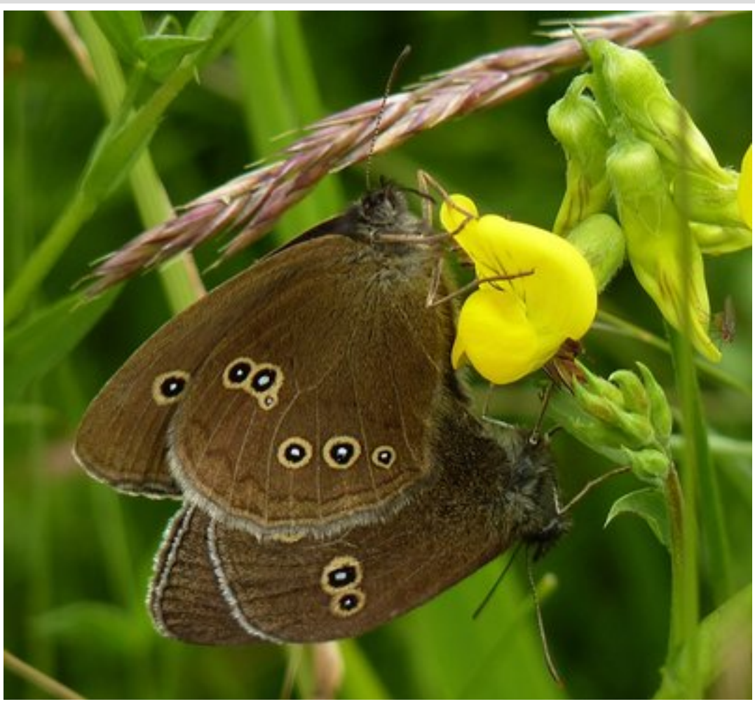
Mating pair of Ringlet