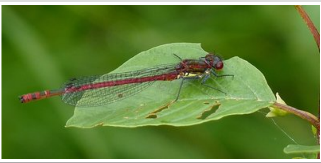
Large red Damselfly