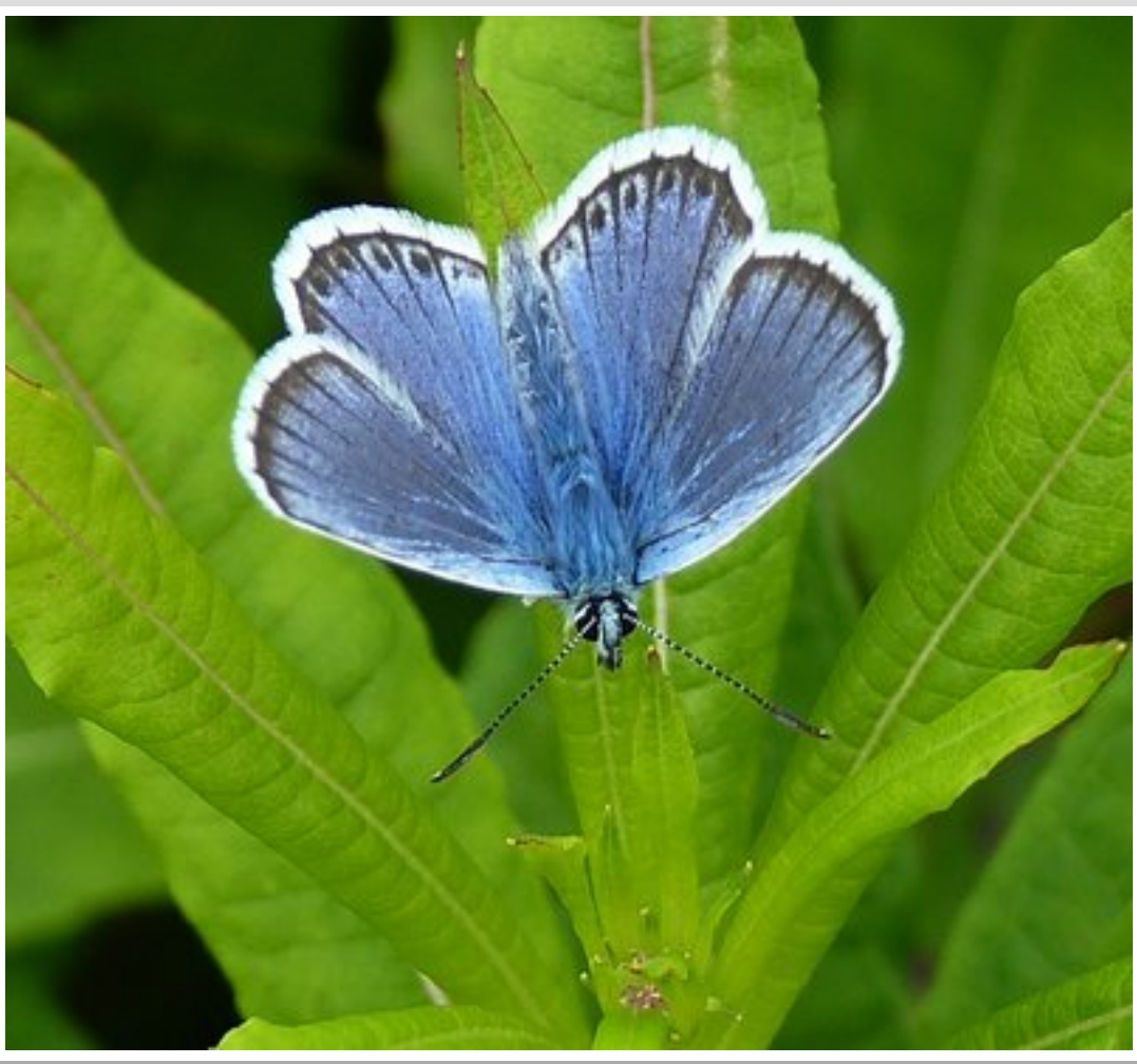
Male Silver-Studded Blue