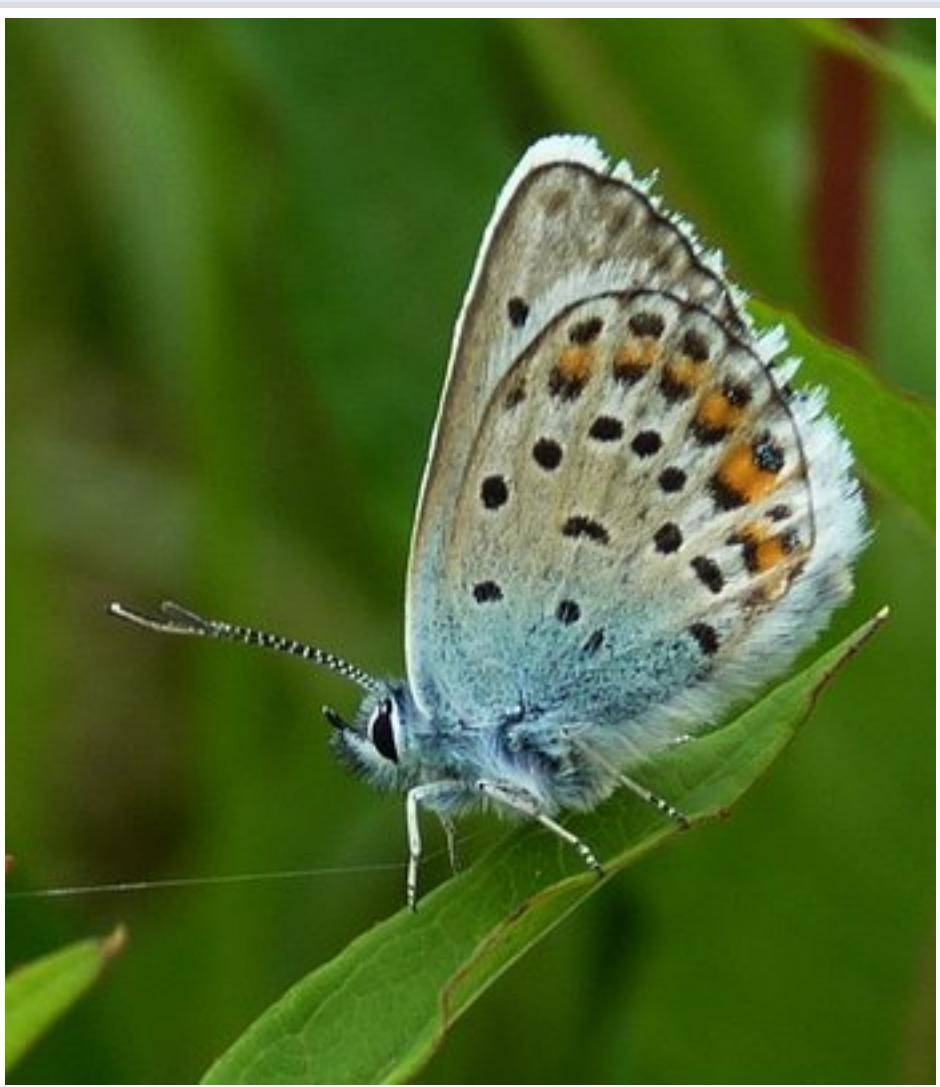
Underside Male Silver-Studded Blue