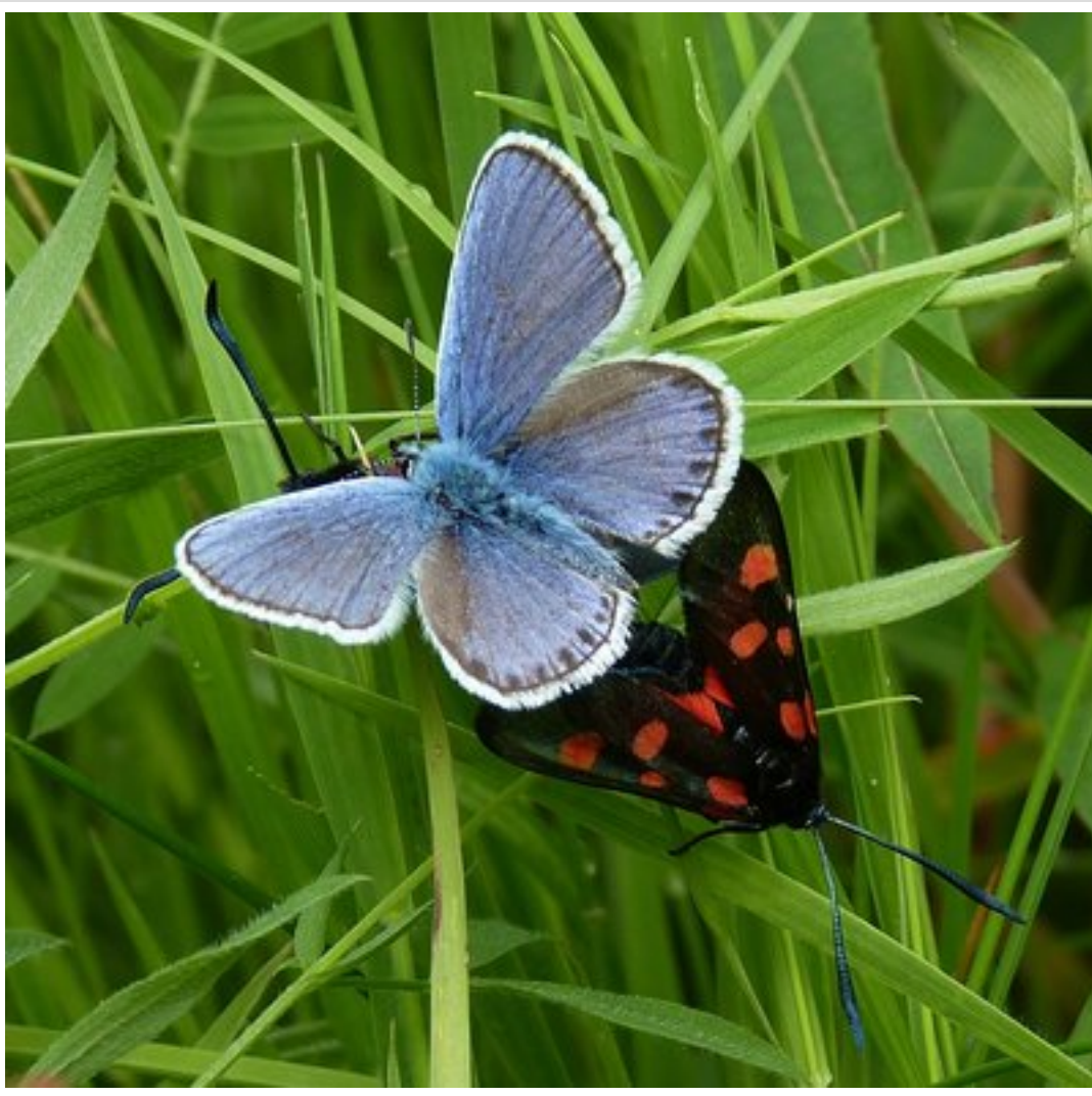
Male Silver-Studded blue invading a mating pair of Burnet Moths