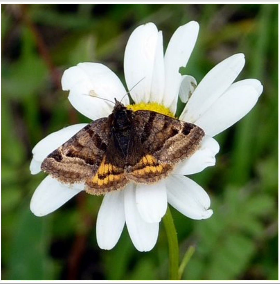
Burnet Companion moth