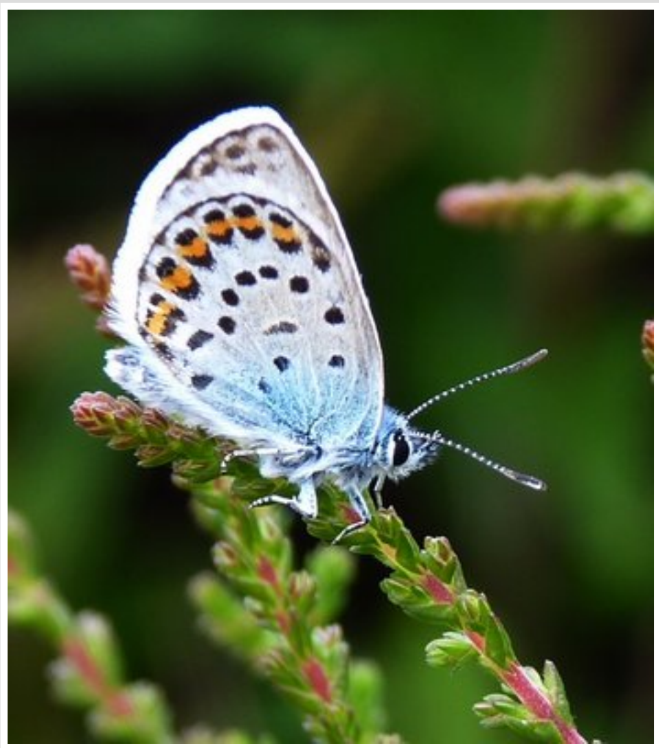
Underside – Male Silver–Studded Blue

I will start with photos from the 2 visits to Prees Heath