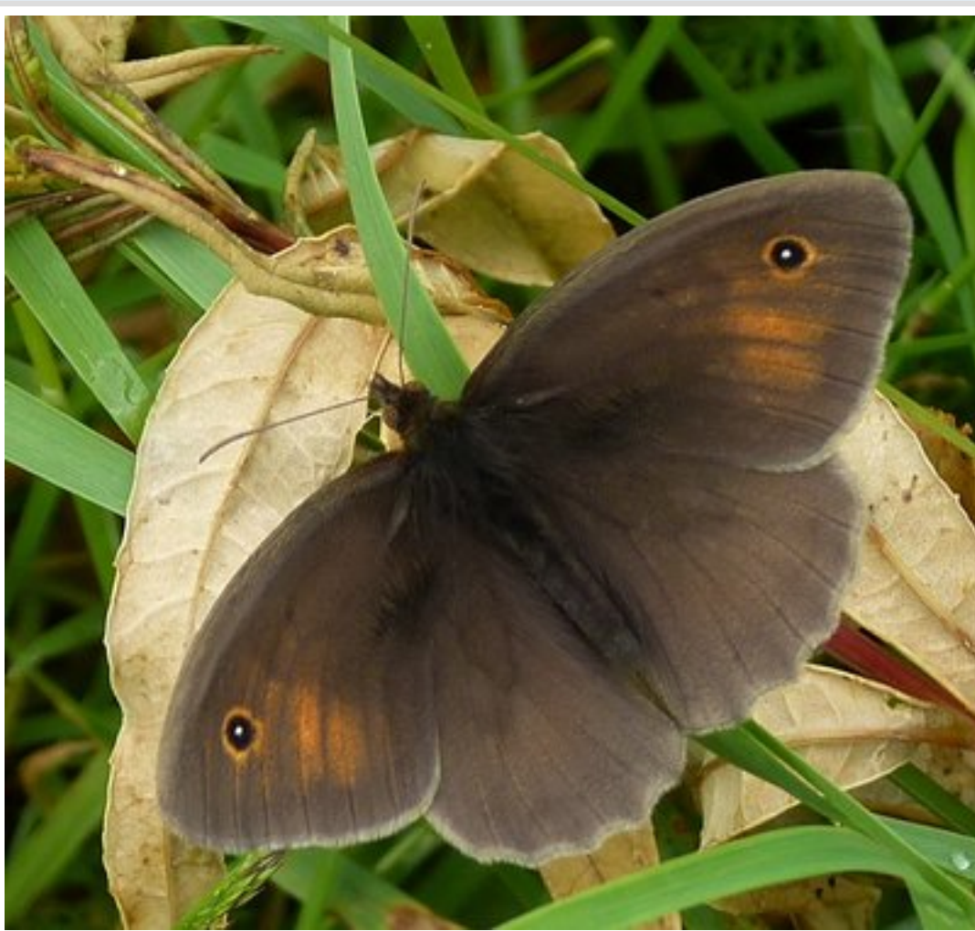
Male Meadow Brown