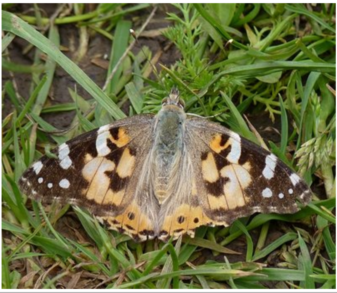
Faded Painted Lady

The place looked a lovely area and definitely a place worth checking again when the weather has improved.