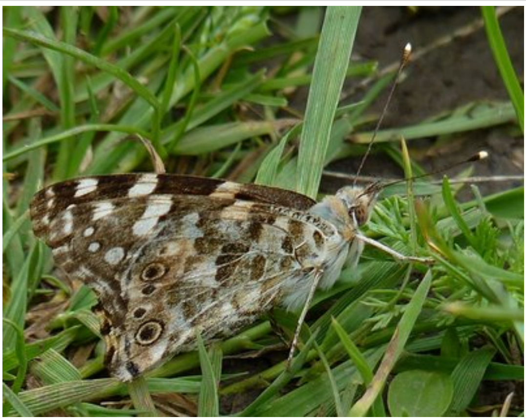
Faded Painted Lady closed wings