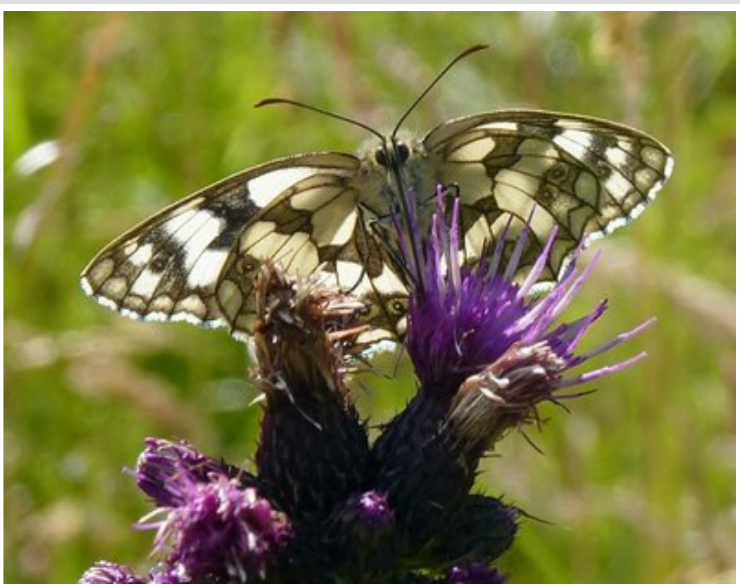
Marbled White having a feed