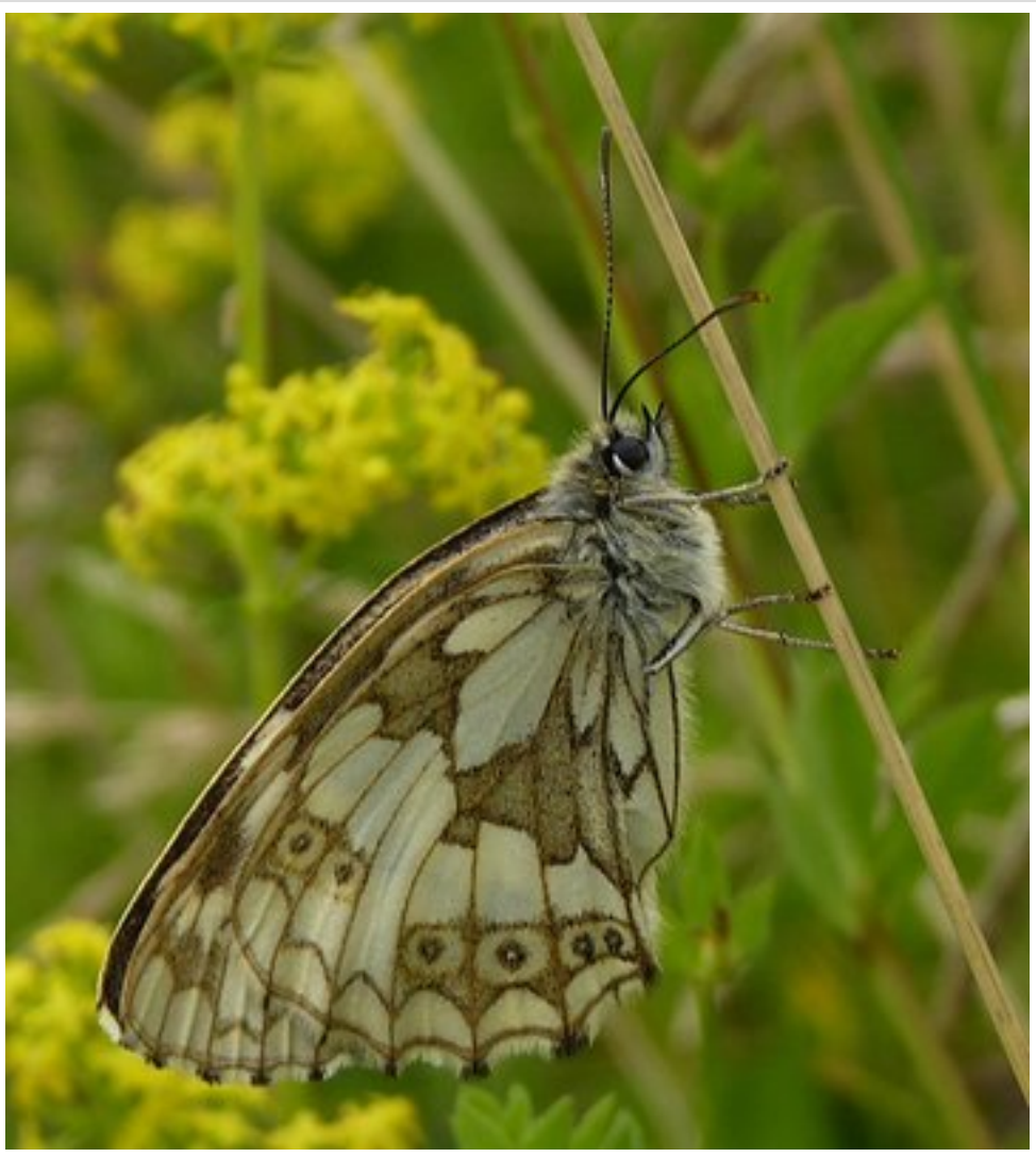
Underside – Marbled White