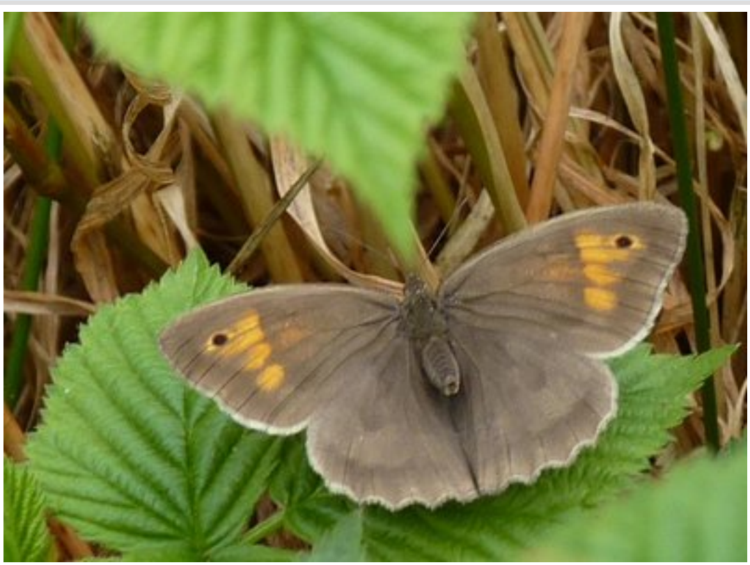
Female Meadow Brown