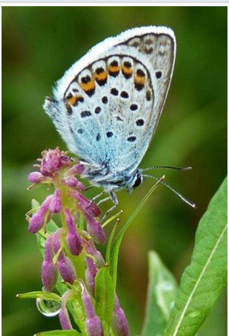
Underside - Male Silver-Studded Blue