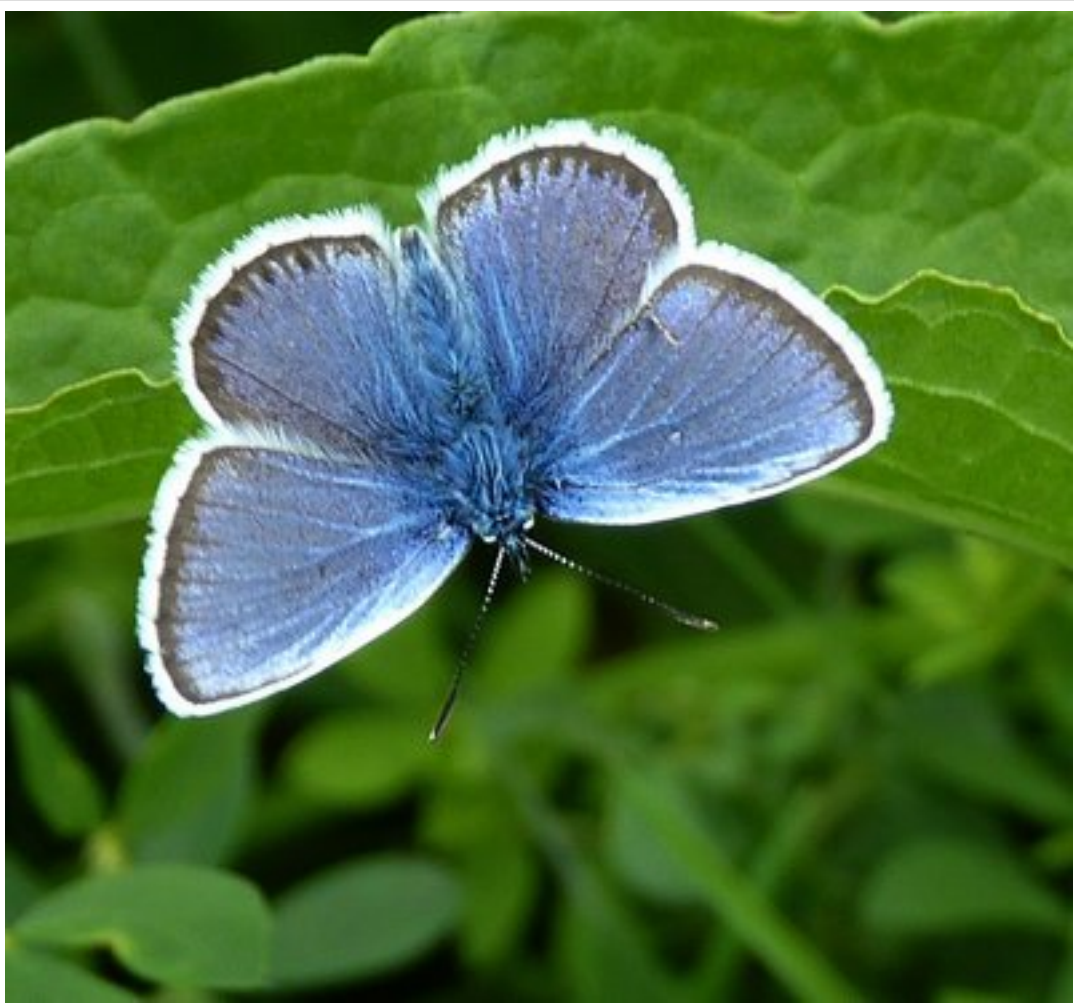
Male Silver-Studded Blue