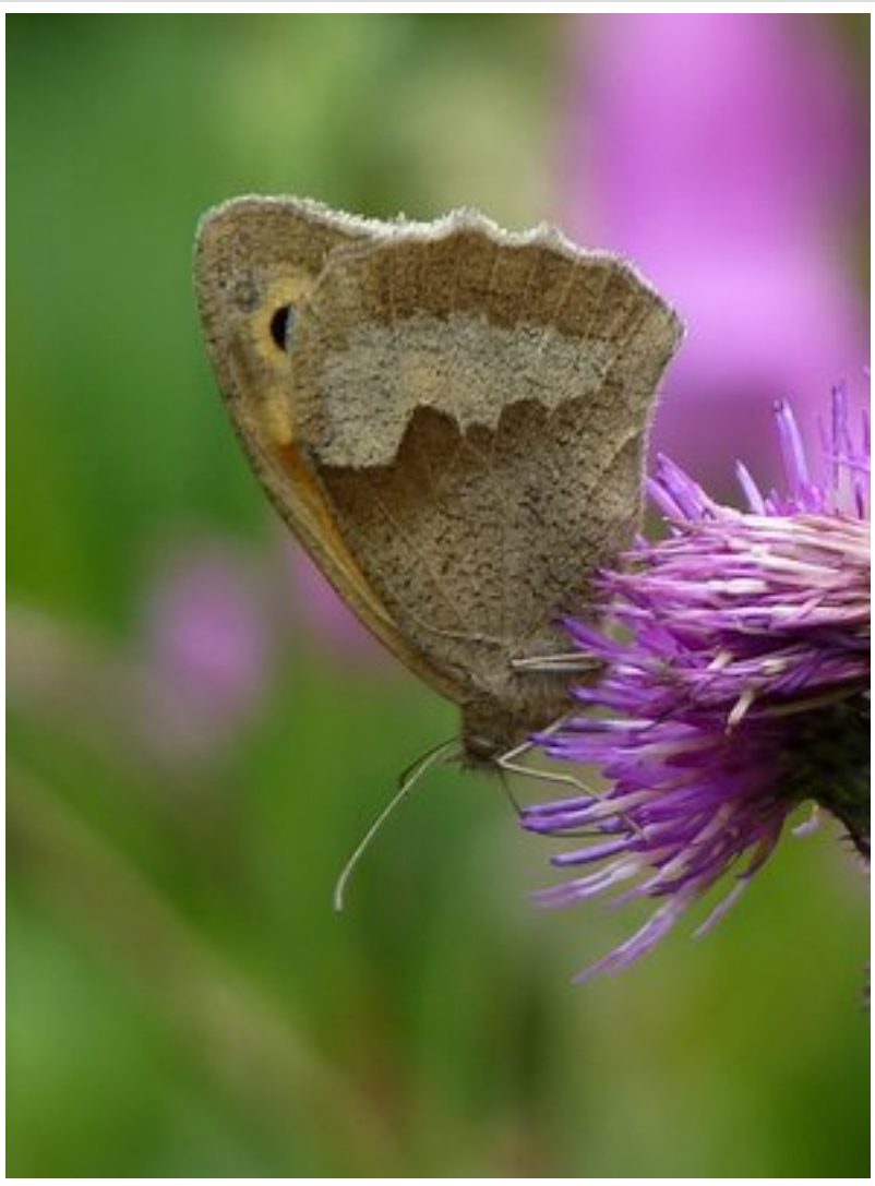
Meadow Brown underside