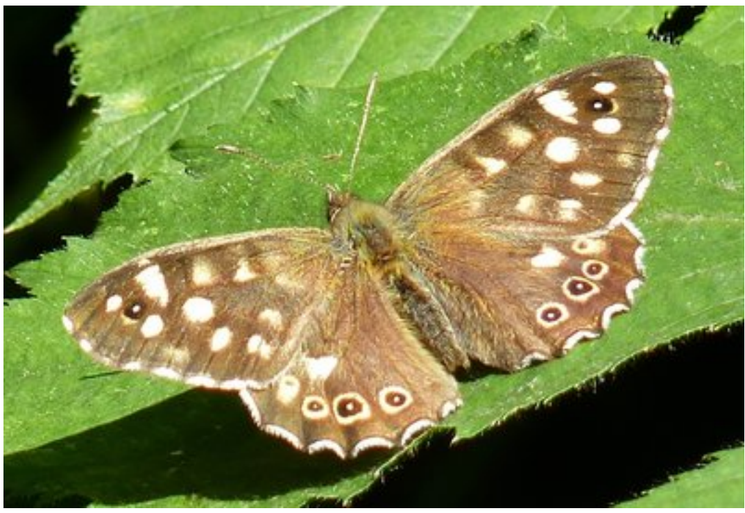
Male Speckled Wood