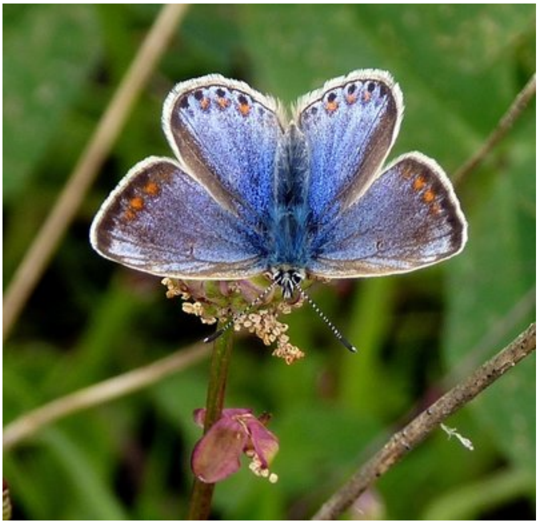
Common Blue female