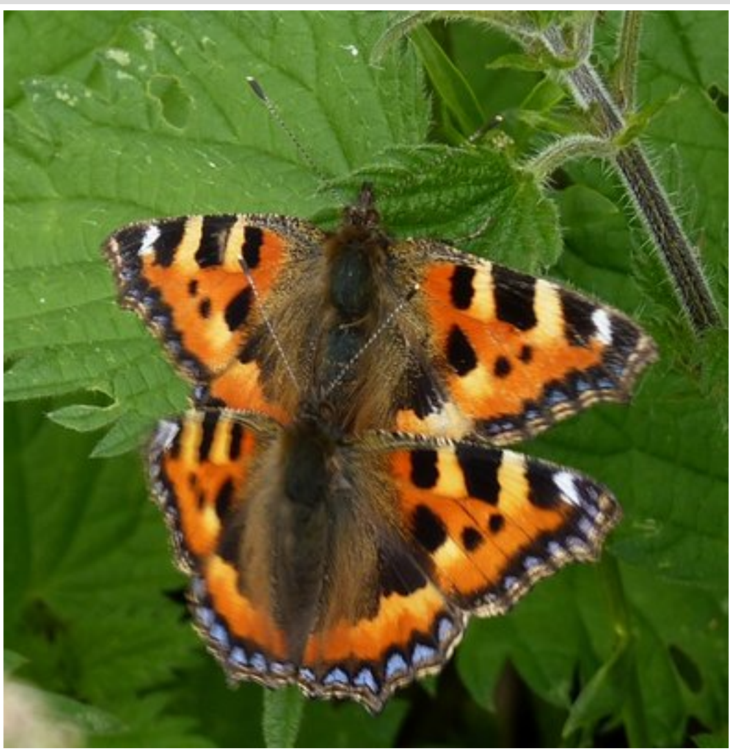
Mating pair Small Tortoiseshell 1 (little blurry round the edges due to fluttering wings)