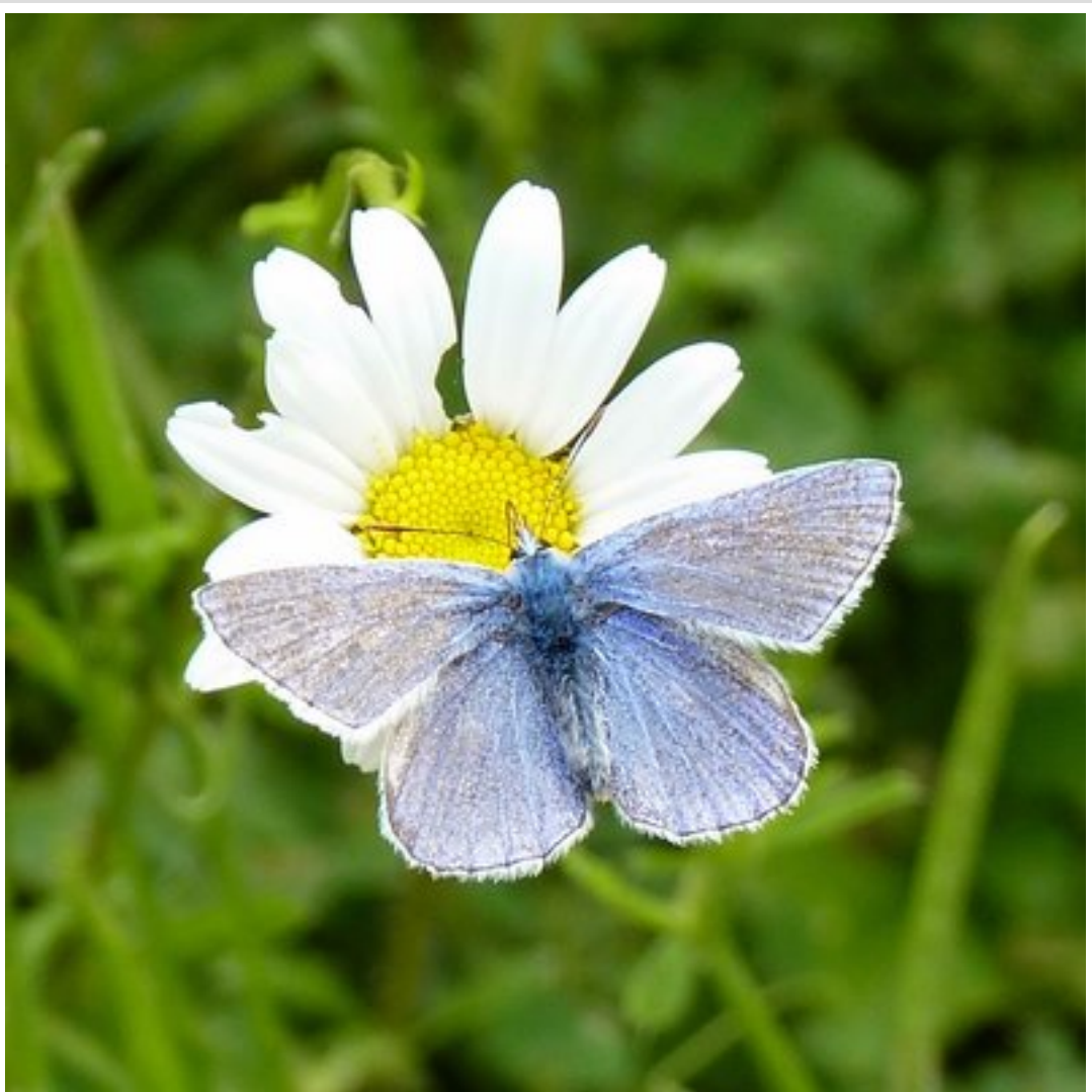
Common Blue male