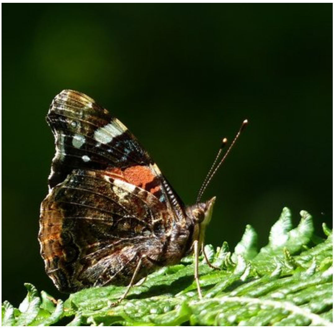
Underside - Red Admiral