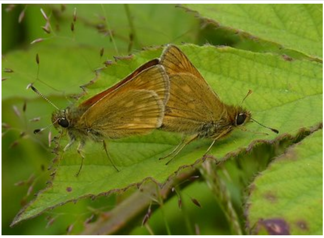
Mating pair of Large Skipper