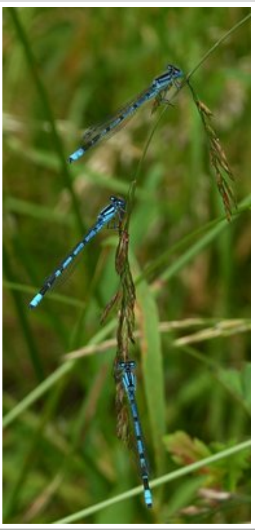
Damselfly tree :)

A very enjoyable afternoons walk and nice to see plenty about in the rare good weather 😊