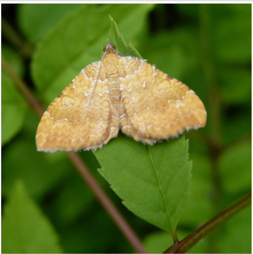
Yellow Shell moth - not great quality