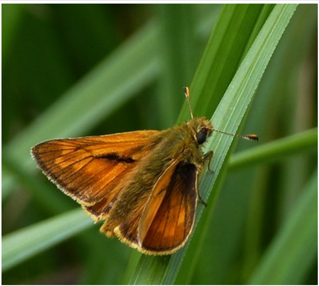
Male Large Skipper