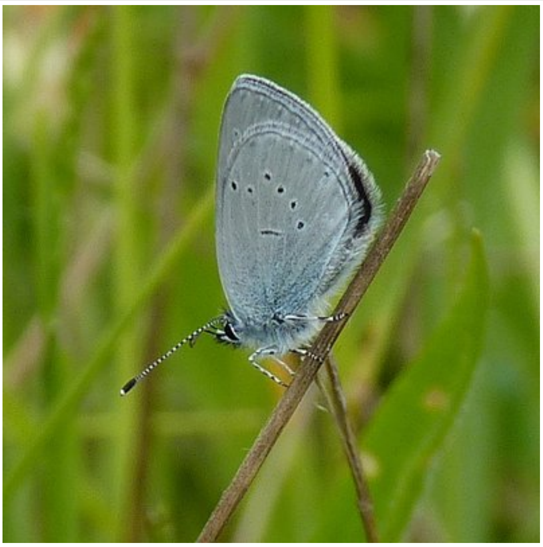
Small Blue underside