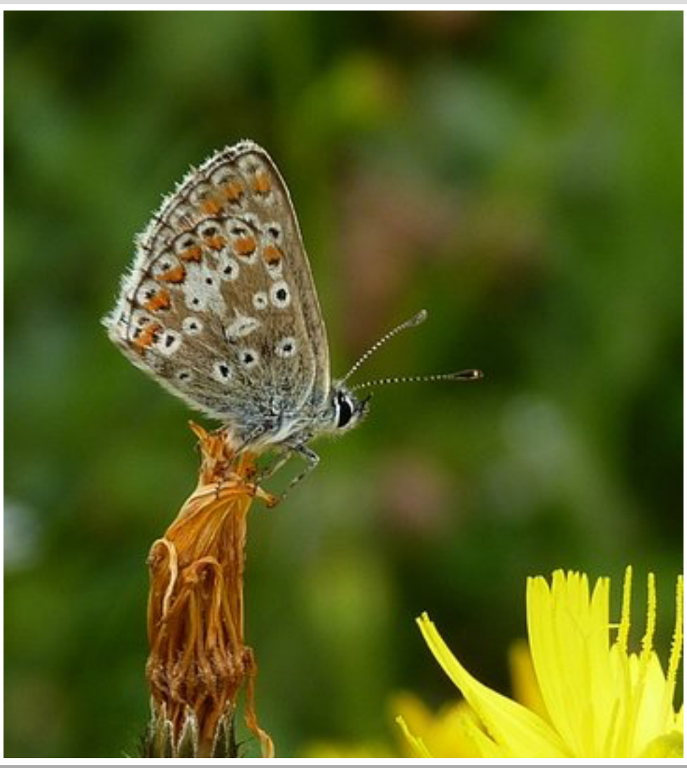
Brown Argus underside