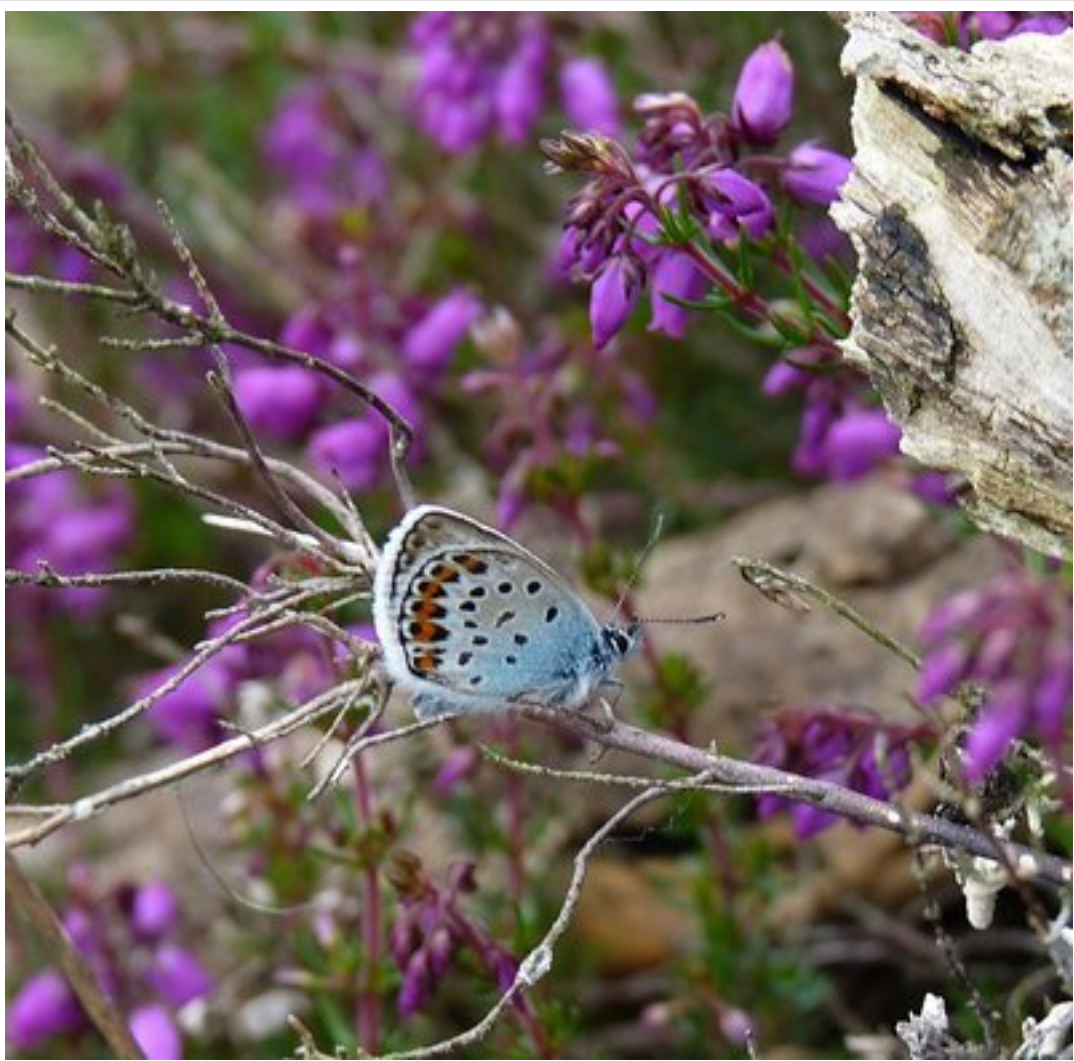
Male Silver-Studded Blue