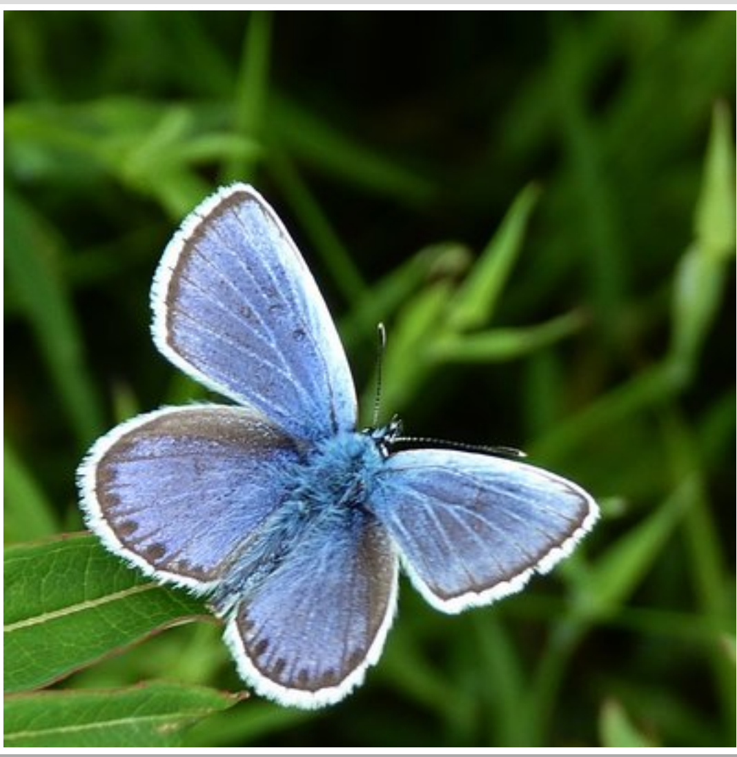
Male Silver-Studded Blue