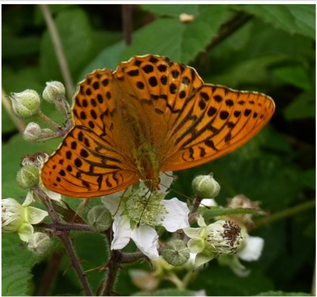
Male Silver-washed Fritillary