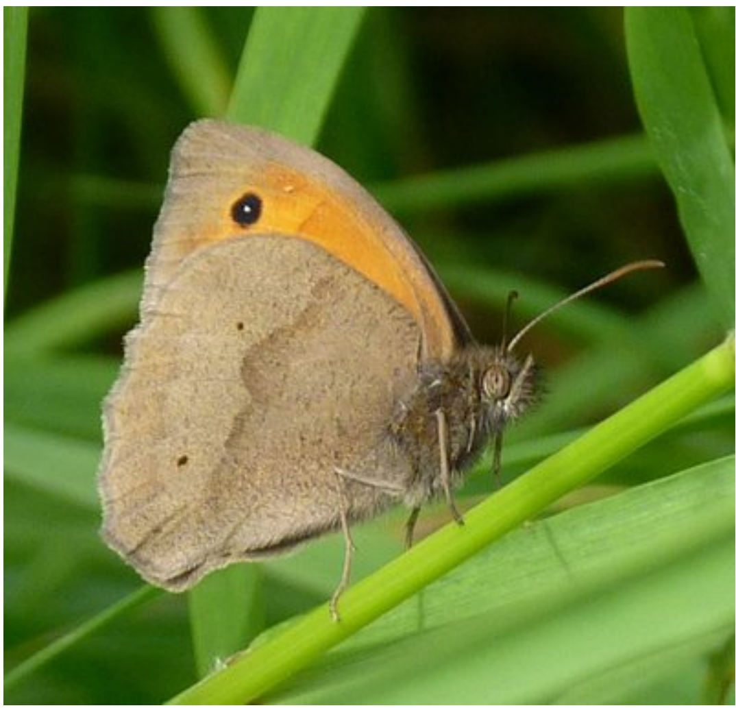
Male Meadow Brown underside