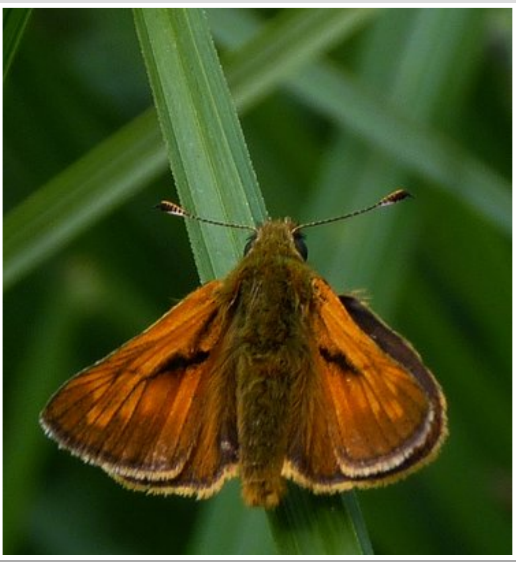
Male Large Skipper