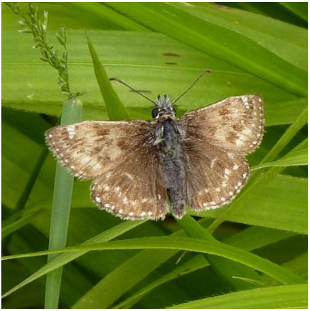
Faded Dingy Skipper