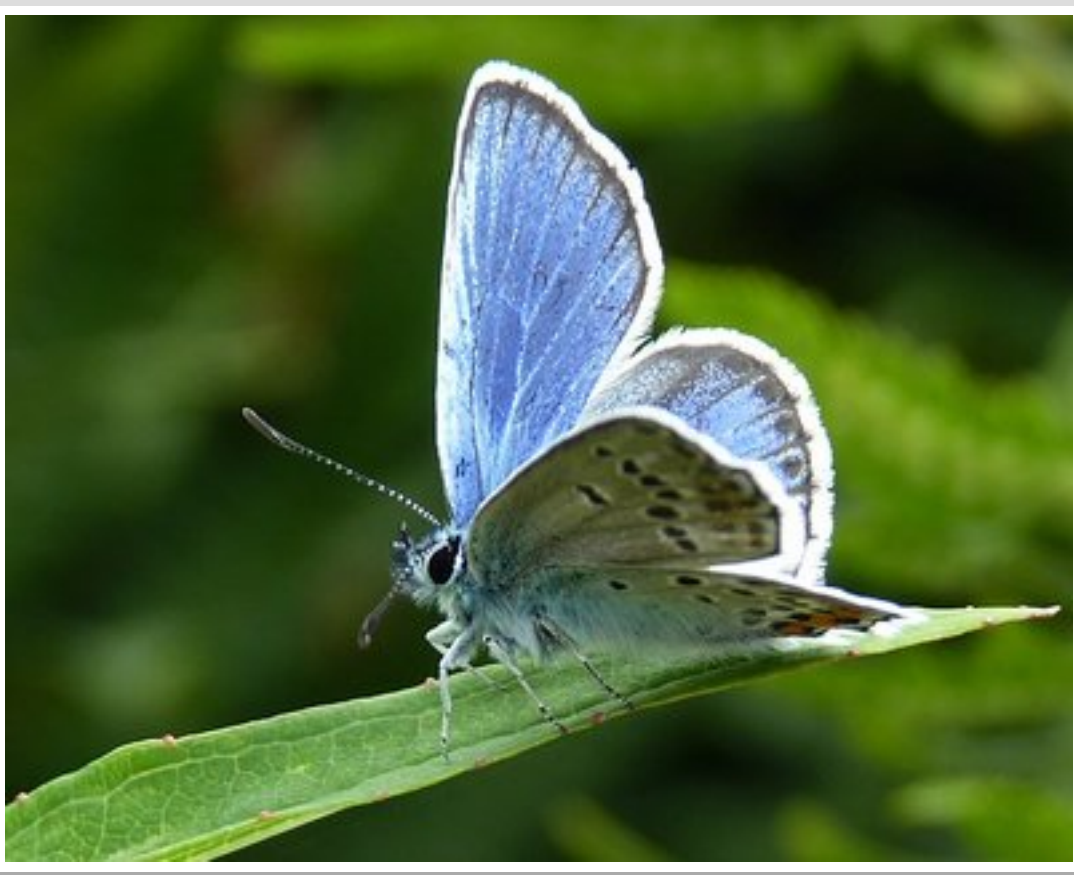
Male Silver-Studded Blue