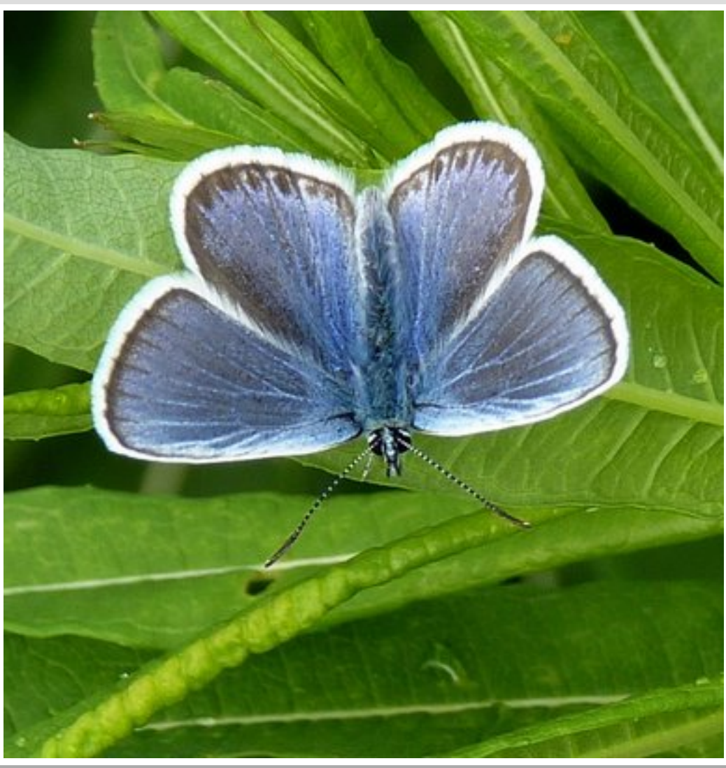
Male Silver-Studded Blue