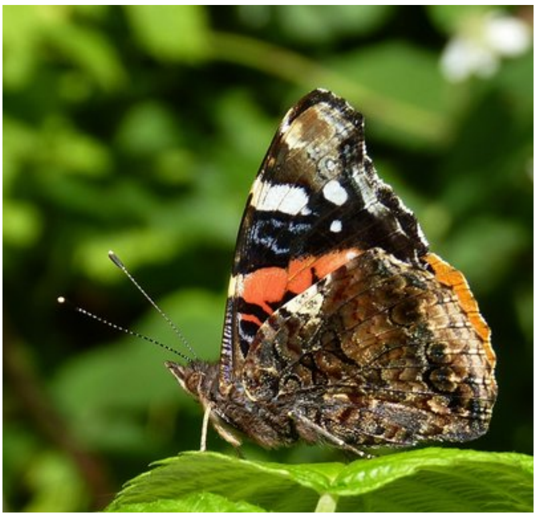
Underside – Red Admiral