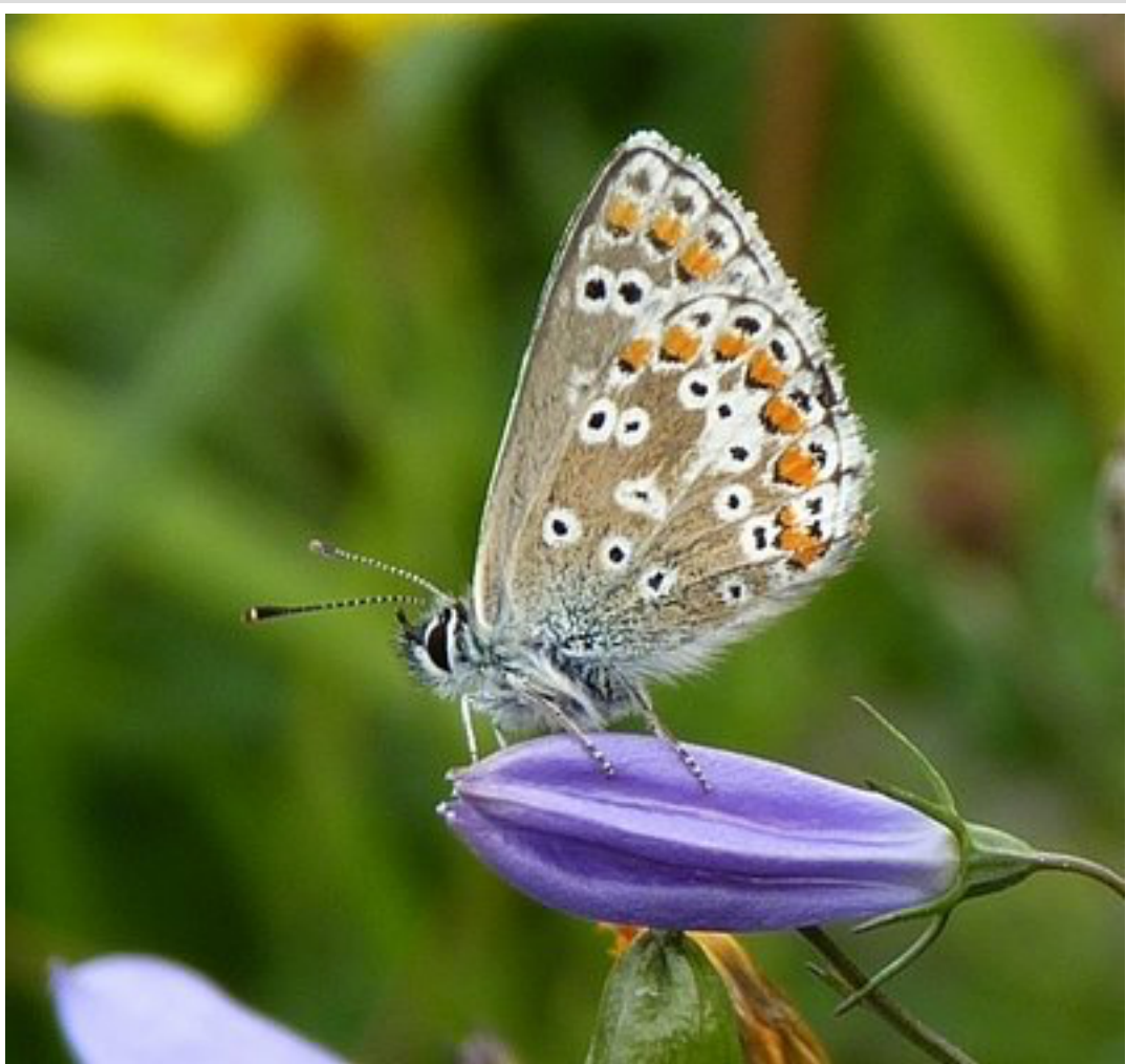
Brown Argus underside