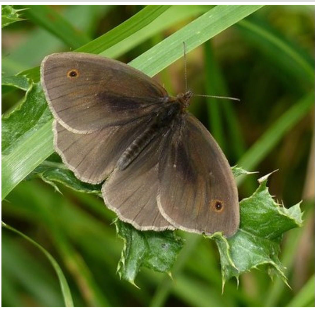
Male Meadow Brown