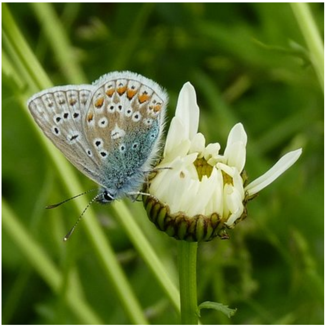
Common Blue underside