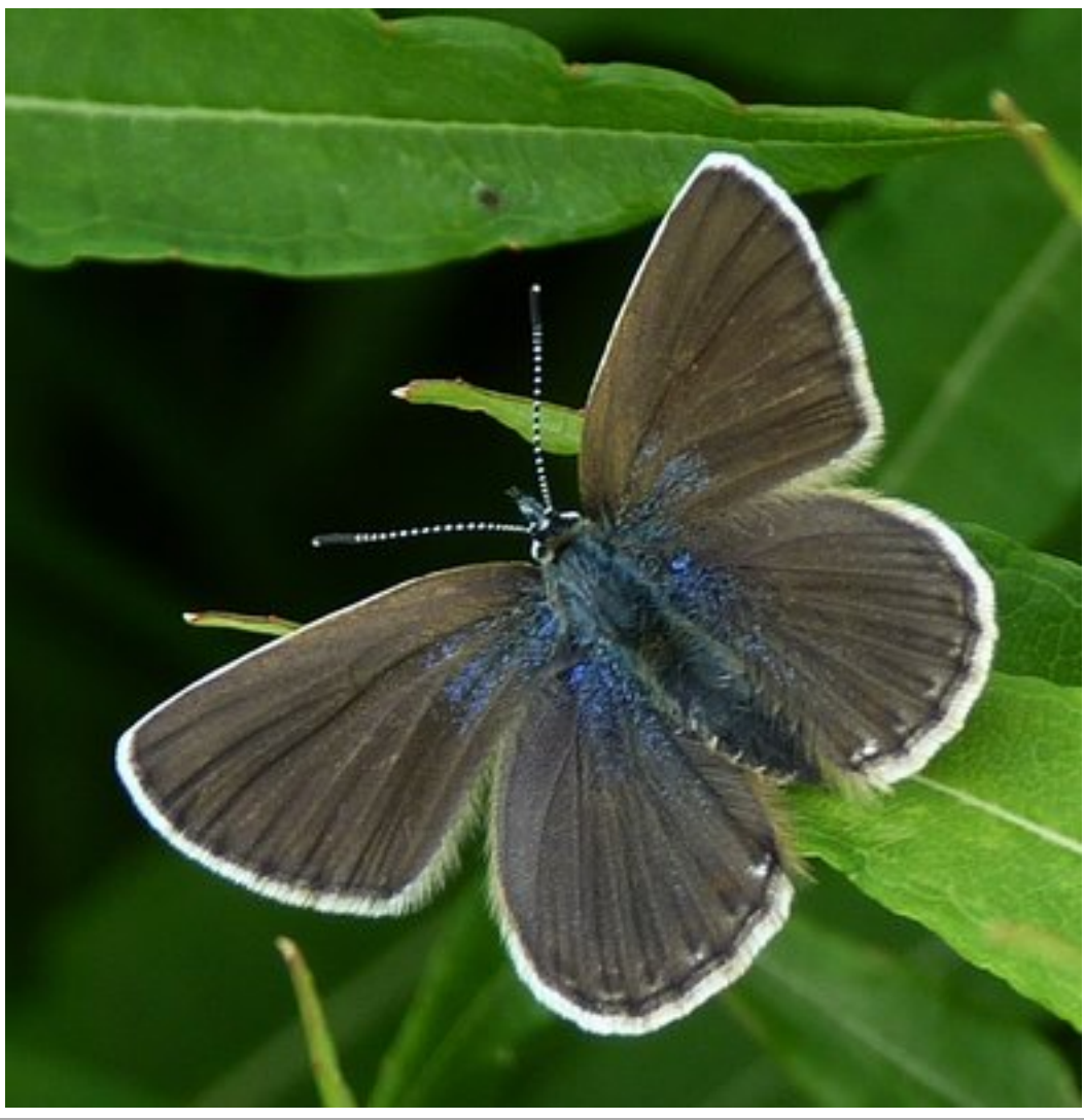
Female Silver-Studded Blue