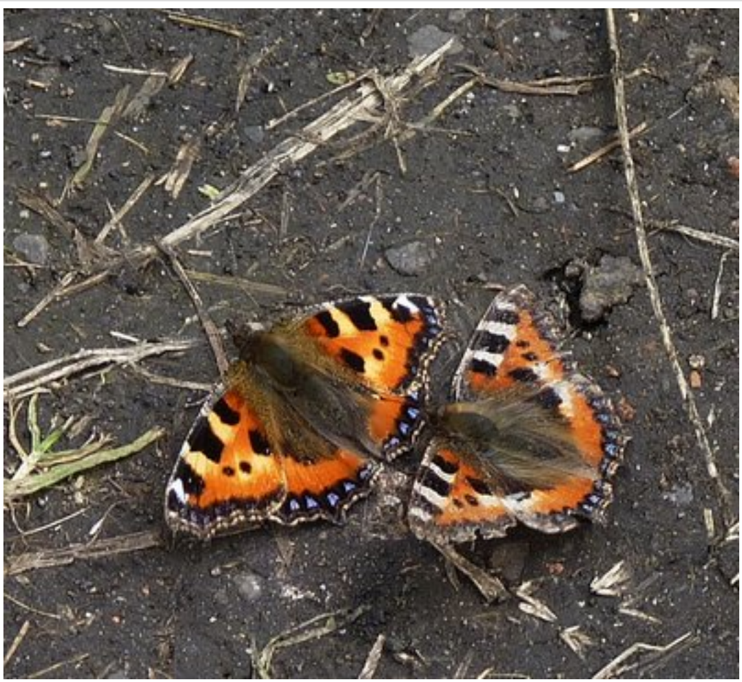
Mating pair Small Tortoiseshell 2