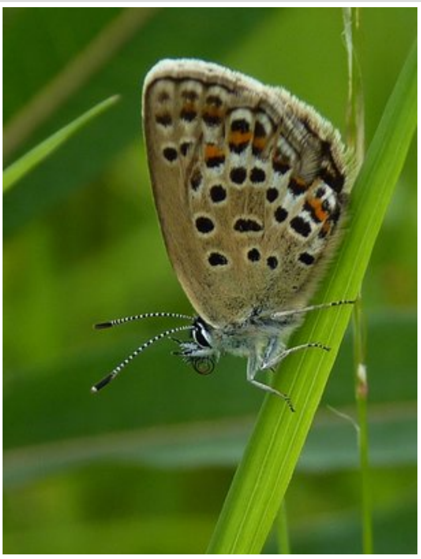
Underside - Female Silver-Studded Blue