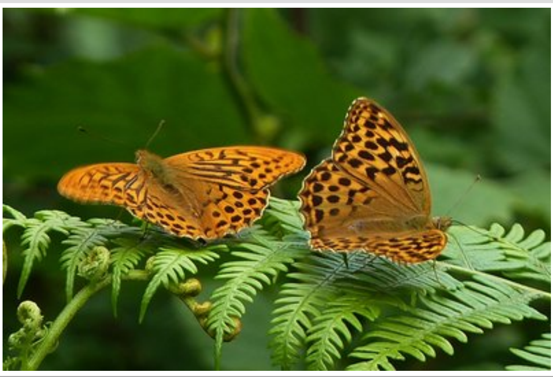
Pair of Silver-washed Fritillary (fluttering wings)