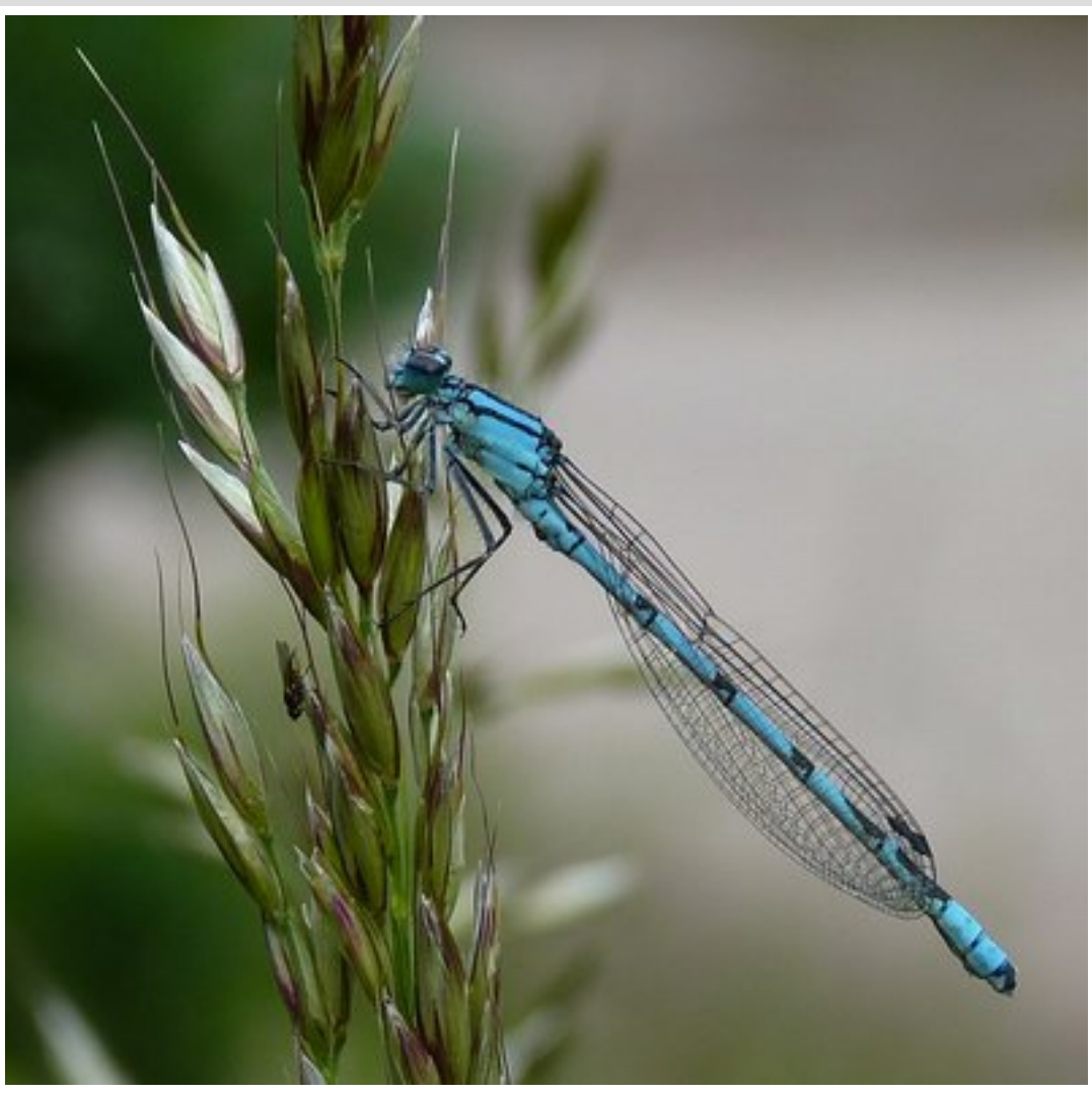
Common Blue Damselfly