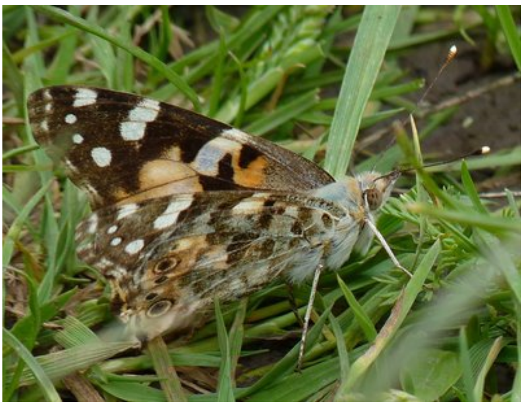
Faded Painted Lady half open wings