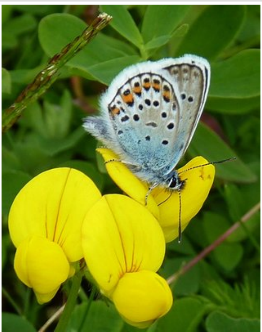
Underside - Male Silver-Studded Blue