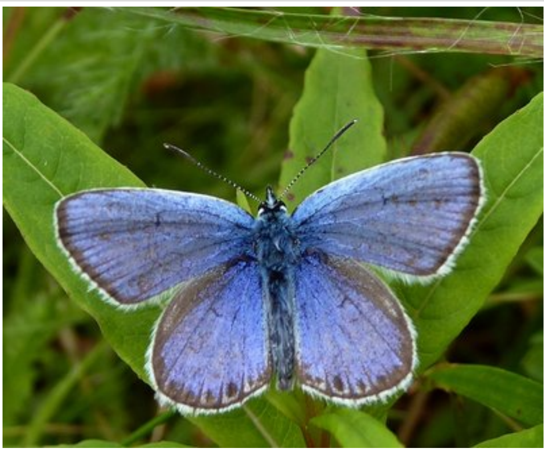
Male Silver-Studded Blue