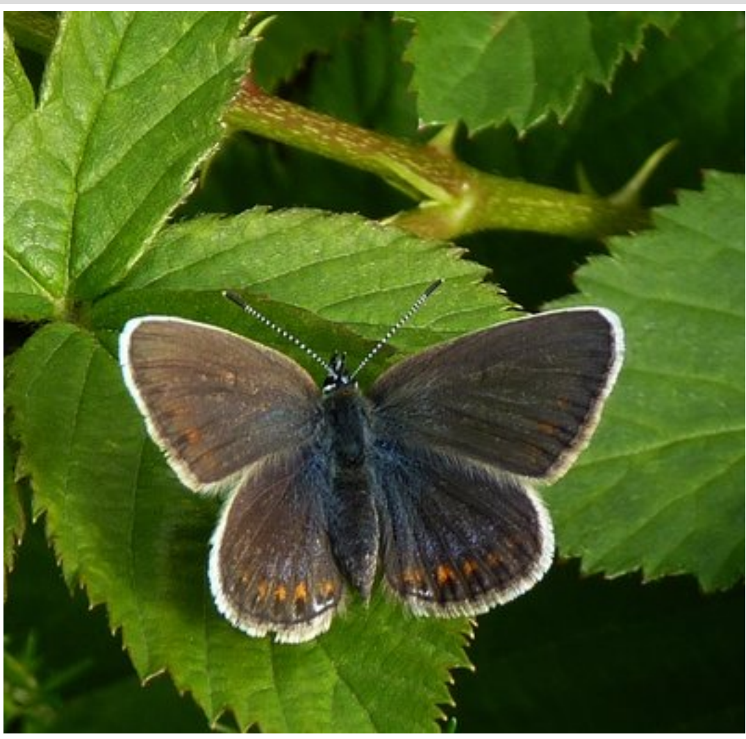
Female Silver-Studded Blue