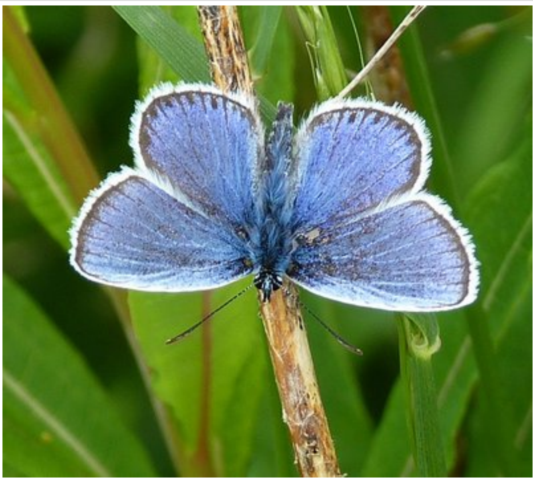
Male Silver-Studded Blue