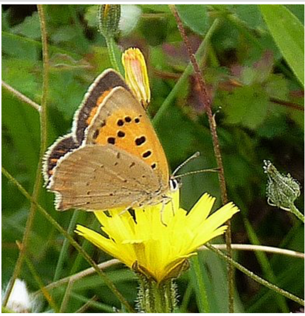
Small Copper underside (photo went a little funky)