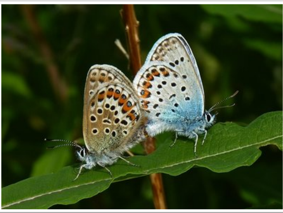
Mating pair of Silver-Studded Blue