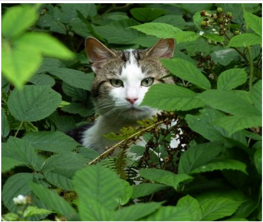
Cat spying on me in the woods

Also spotted was a Banded Demoiselle and many Damselfly.