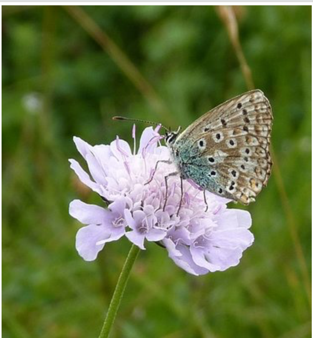
Chalkhill Blue underside