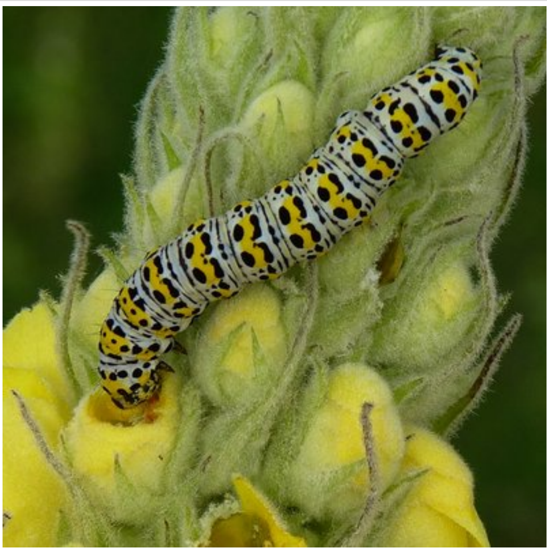
Mullein moth caterpillar