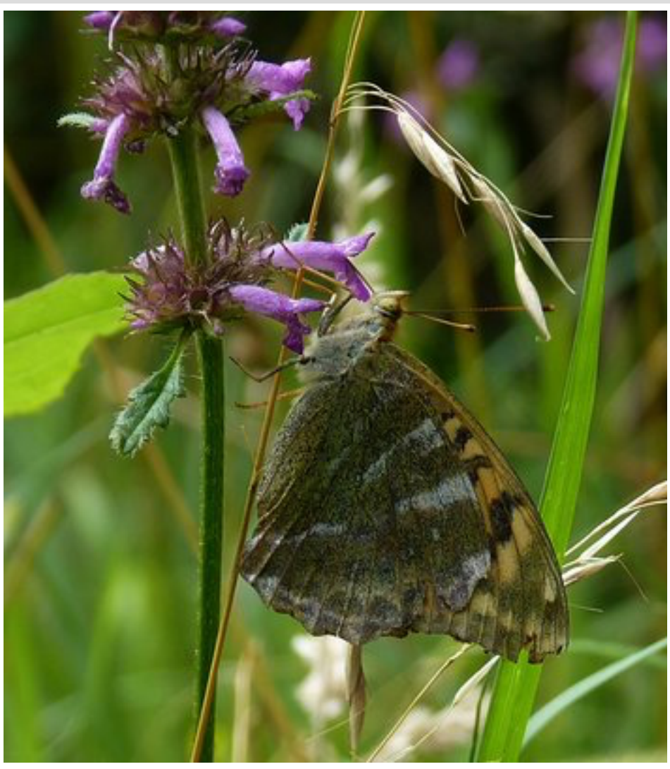
Silver-Washed Fritillarie underside

An enjoyable day and lovely to finally get a day away from work 😊