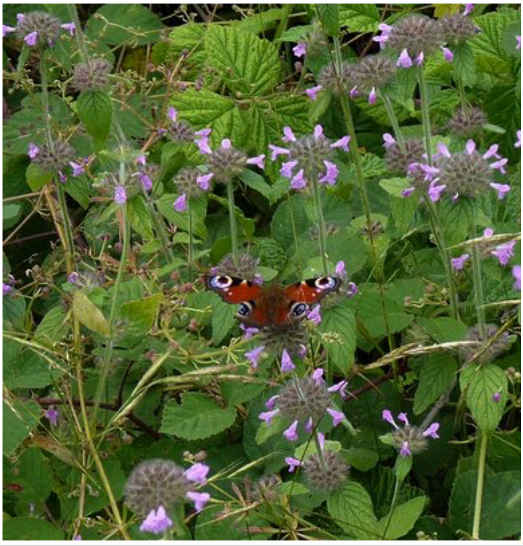
Peacock (because i liked the flowers :-)