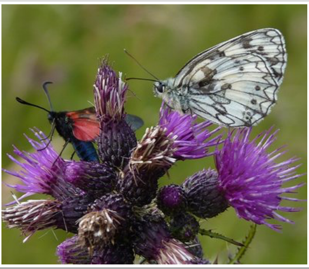
Marbled White watching a Burnet Moth