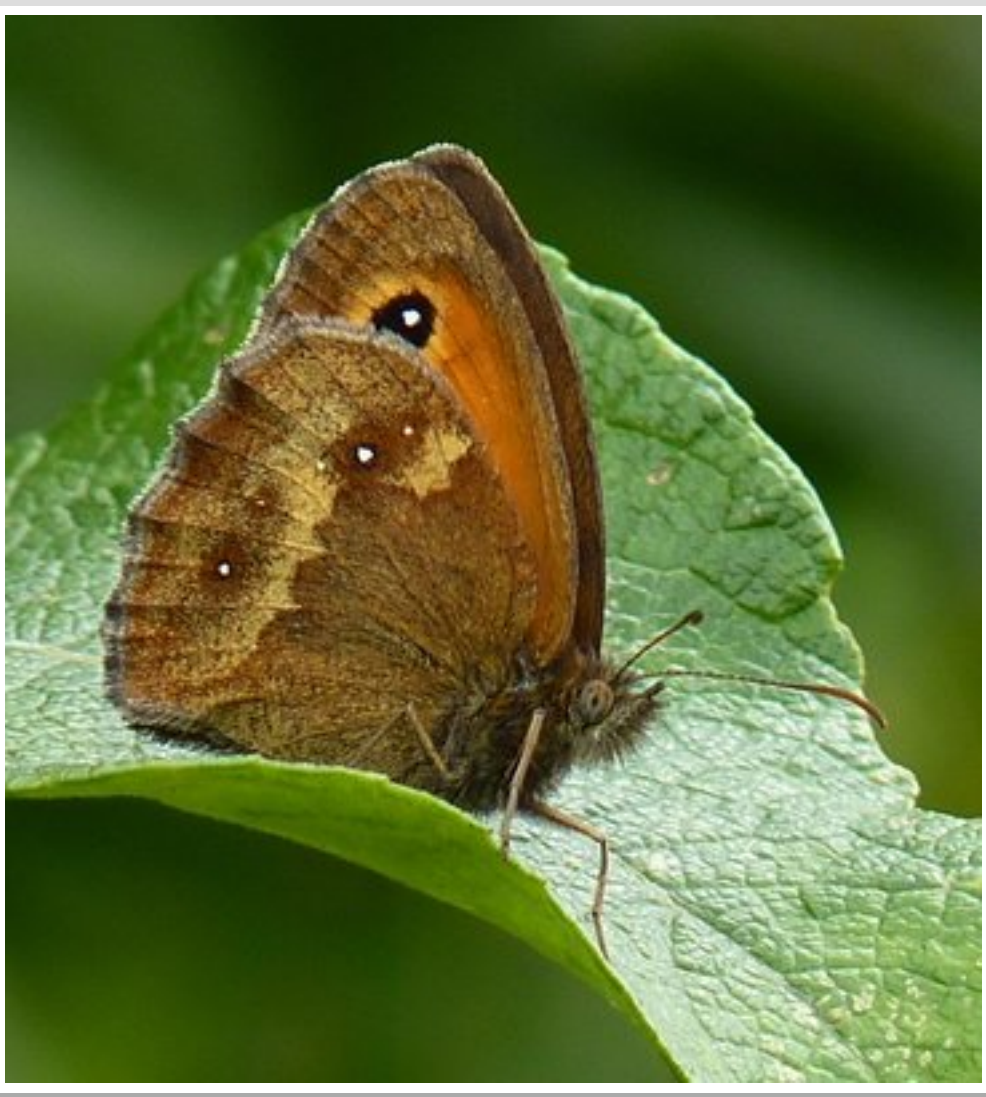
Underside – Gatekeeper