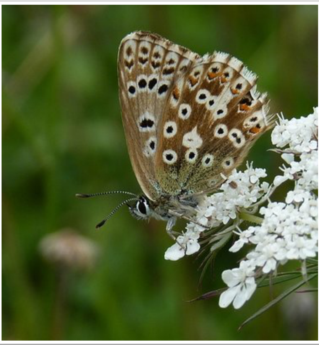
Chalkhill Blue underside