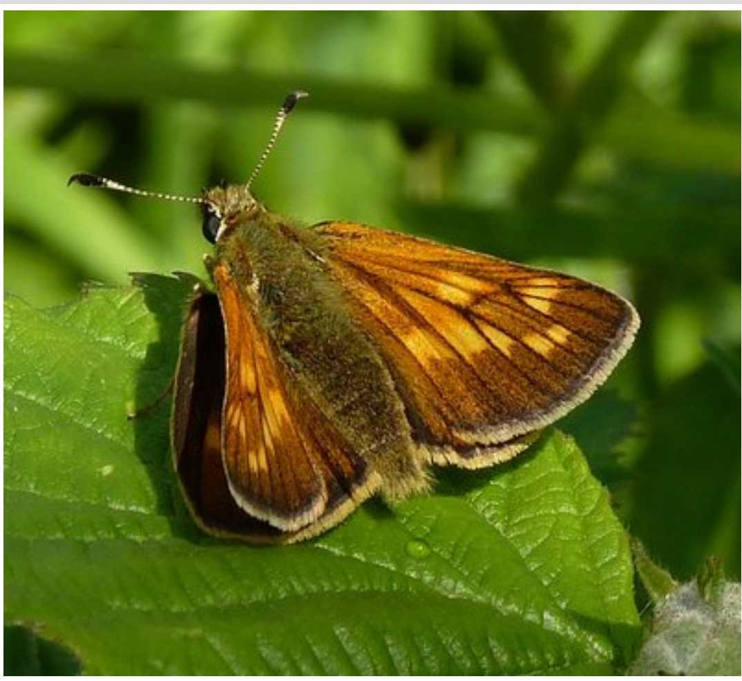
Female Large Skipper