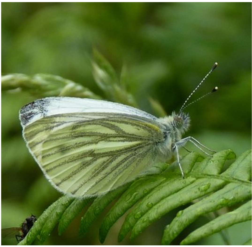
Green Veined White