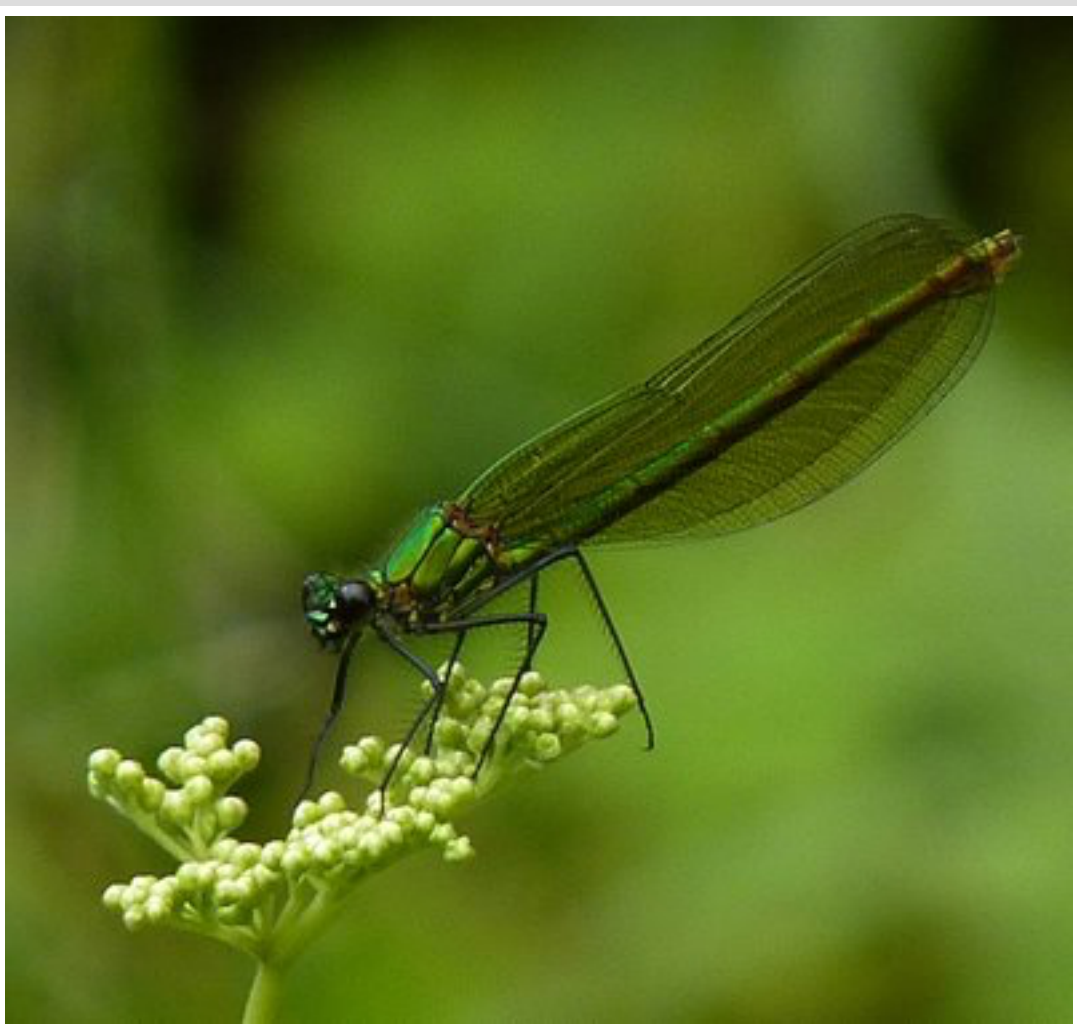
Female Beautiful Demoiselle (i think)

A worthwhile trip despite the bad weather 😊