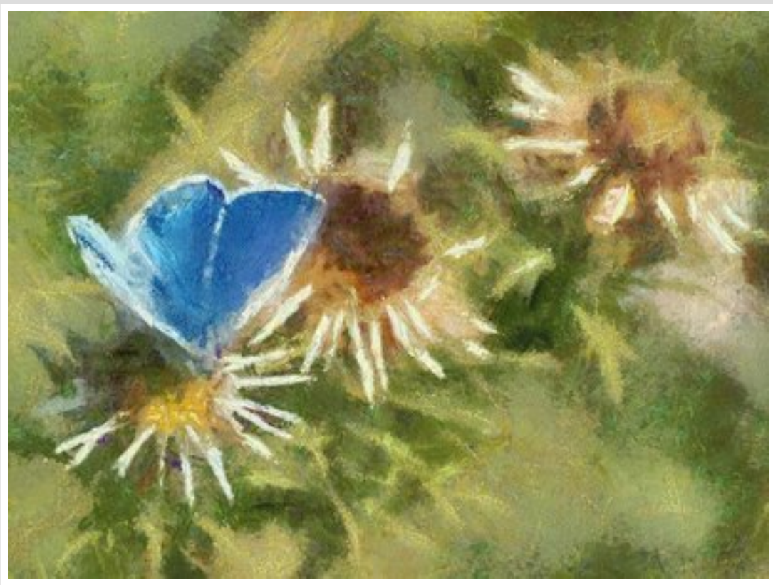
Dynamic Auto Painter (Monet)

I also looked at your art collection. I wonder if you know the photo-painting program by Mediachance called 'Dynamic Auto Painter: see http://www.mediachance.com/dap/ (there's a free trial download available) It's fun just watching it working and the results can be quite good. Here's an example of an Adonis Blue photo 'painted' in the style of Monet: