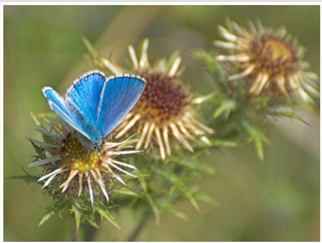
Lough Down, Berks - 19 August 2009