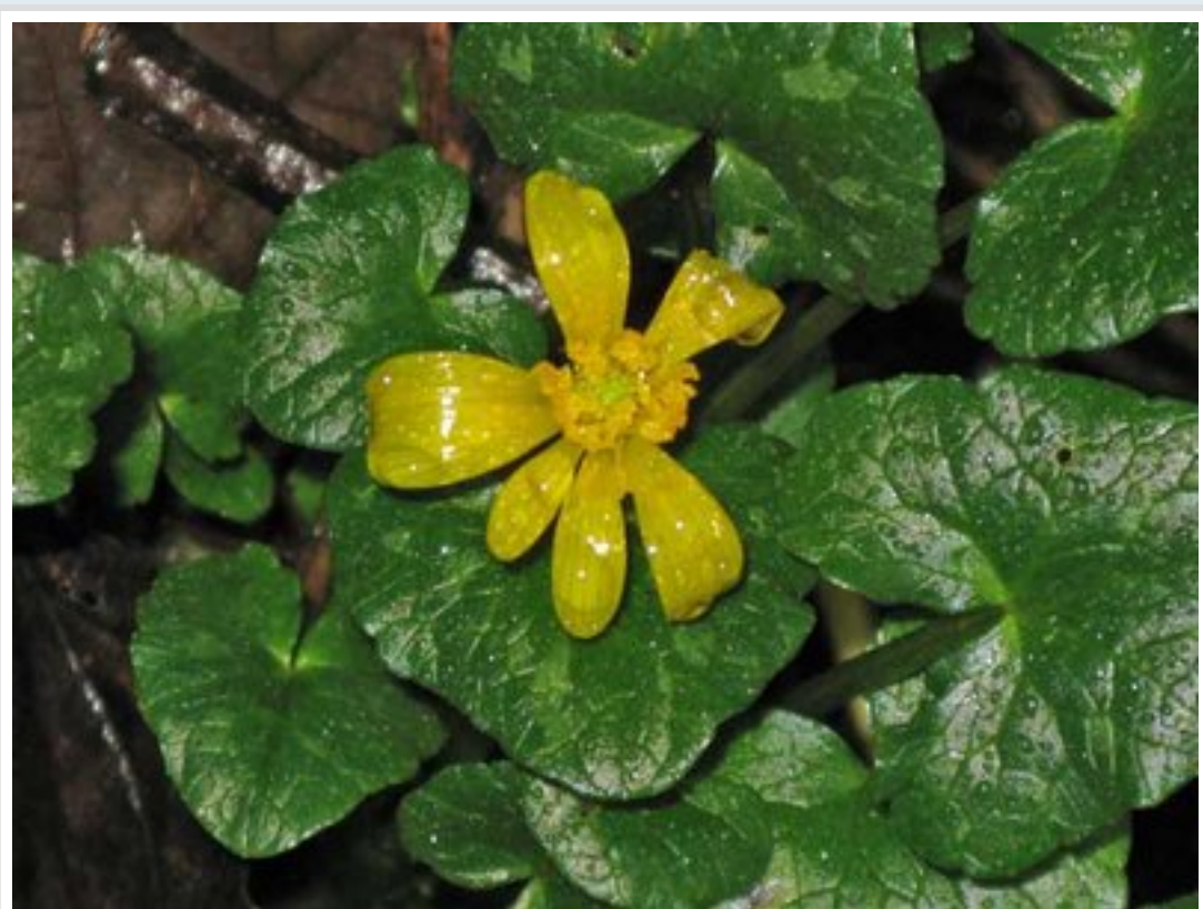
Lesser Celandine in flower Tobermory 28th December (not in a garden and seemingly genuinely wild on woodland path). But very mild (11C), although dull, so had to use flash.

by Jack Harrison, 28-Dec-12 09:18 PM GMT