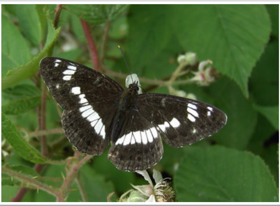
White Admiral in Binsted Wood.