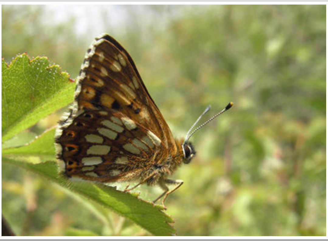
Male Duke of Burgundy