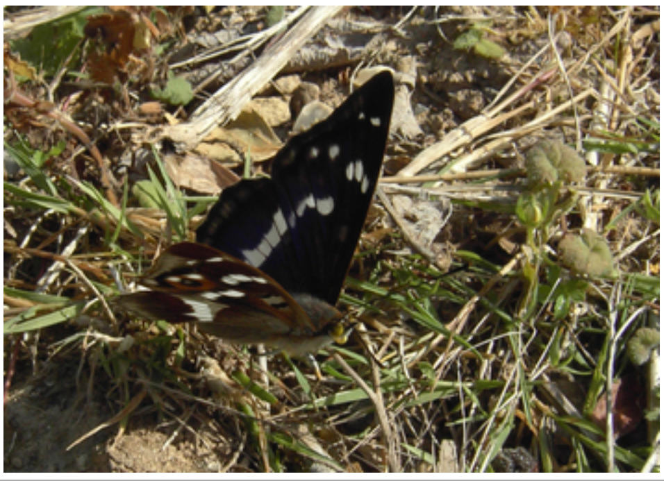
Purple Emperor (male)

A trip back down to the South and I decided to visit Botany Bay in Chiddingfold Forest. It's a well known spot, but one which I hadn't been to before. My aim was to see male iris on the ground, which I succeeded in doing, previously I had only seen them up high or on sap runs. There was a really good show of butterflies including good numbers of White Admirals and a few 1st brood Wood Whites .