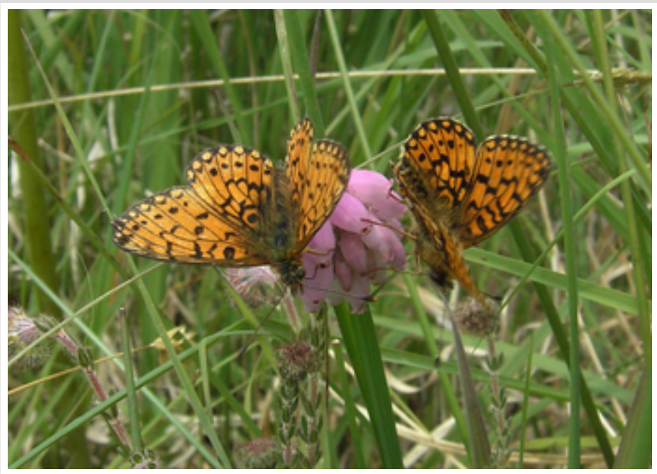
Small Pearl-bordered Fritillaries nectaring on Cross-leaved Heath.

In a sandy area of heath I found a Meadow Brown with deformed wings which could not fly. I watched it for around 20 minutes but could not see any noticeable improvement in this time. Whether or not it would have completed the wing development process I do not know.