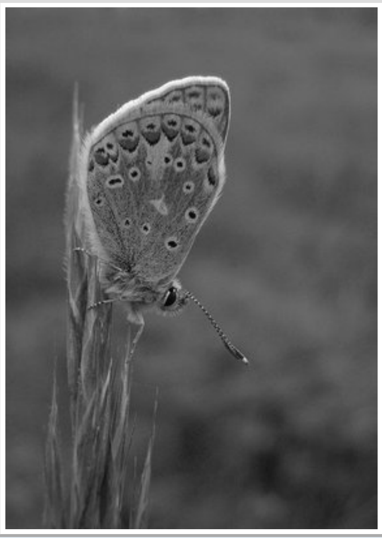
Male Common Blue