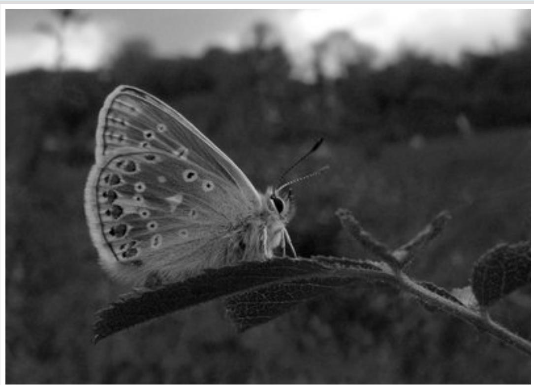
Male Common Blue

This will be my last day of Sussex butterfly watching for a while, but oh what a day! Walking over the Downs taking in some little visited sections, 13 species were seen. This included freshly emerged Small and Adonis Blues , a Duke and Dingy Skippers everywhere on the warm side of the downland valleys. Flora included Fly Honeysuckle and an uncommon form of the Early Purple Orchid .