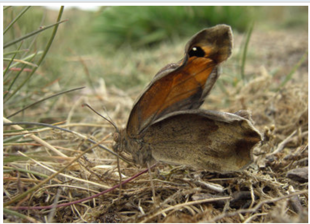
Developing Meadow Brown.