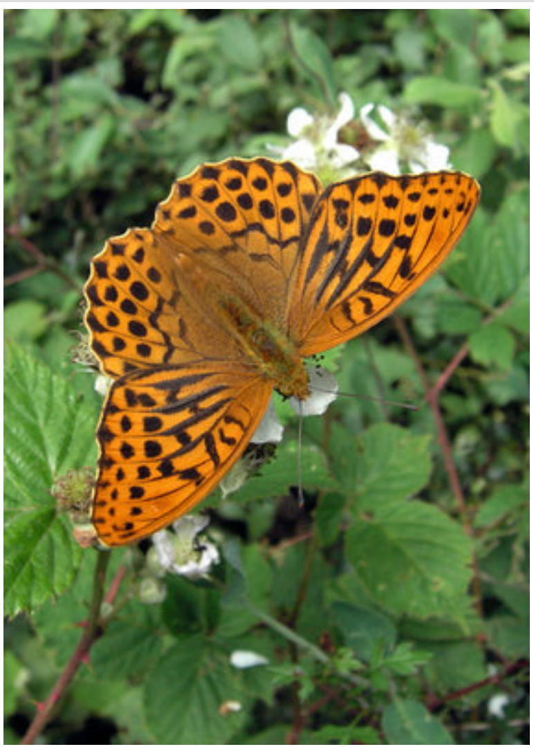
Silver-washed Fritillary (male)