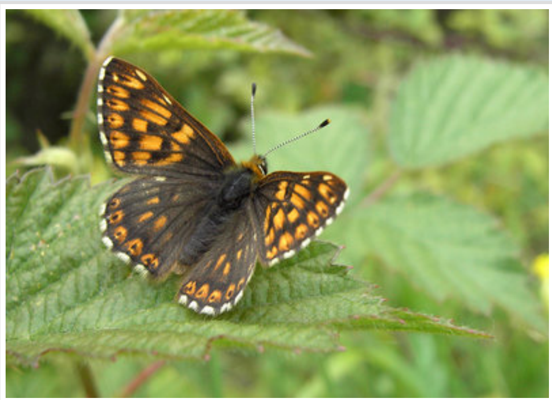
Male Duke of Burgundy