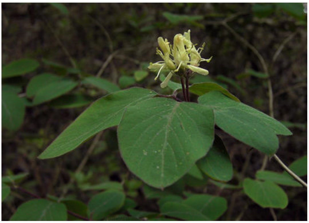
Fly Honeysuckle, rarely seen as a native plant.