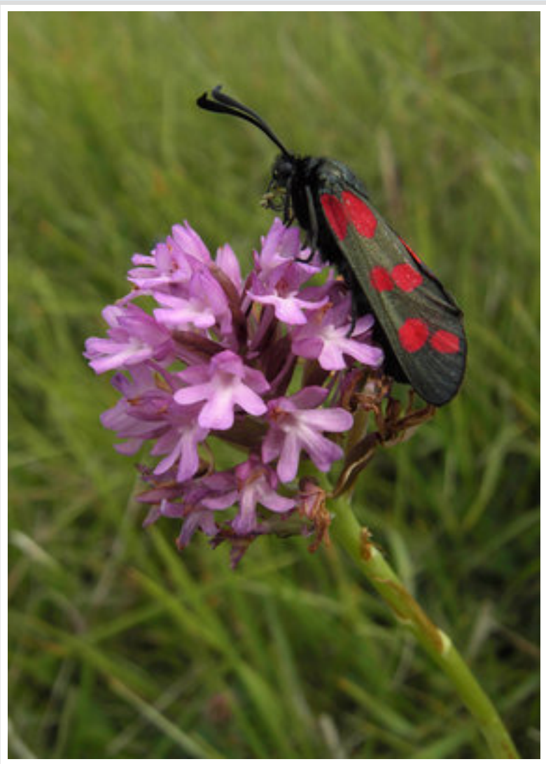
Six-spot Burnet and Pyramidal Orchid

A very hot day and I found myself at Broadway, Worcestershire. With no particular plan I had a look at the hill behind the village which turned out to be rather rich downland. Notable finds were Bee Orchid var. trolli , Prickly Restharrow and Pyramidal Orchids with a large variety of lip forms.