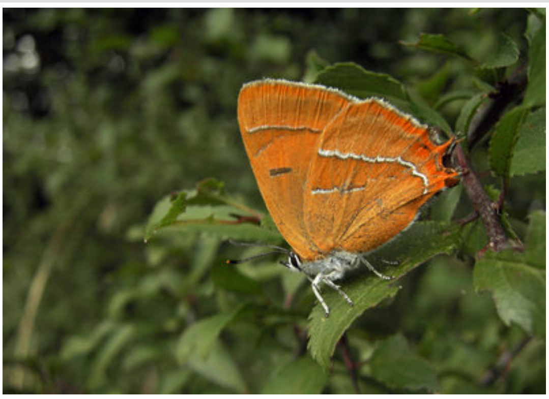
Brown Hairstreak female

In search of Brown Hairstreaks I had a look around Grafton Wood in Worcestershire. The Orchard appeared Hairstreak free due to the direction of the wind but the sheltered side of the woods allowed brilliant views of the females. At one point I had three together on a bramble bush and observed a few eggs being laid for the first time. All of the eggs were laid between about 1' and 1.5' from the ground after the adult had 'done the hairstreak walk' and tested potential sites. I also found two females which were crawling around deep in the brown grasses almost out of sight. I'm not sure what they were up to. A good accompanying cast was present too, with Common Blues , Brown Argus and a lone and battered Silver-washed Fritillary still on the wing.