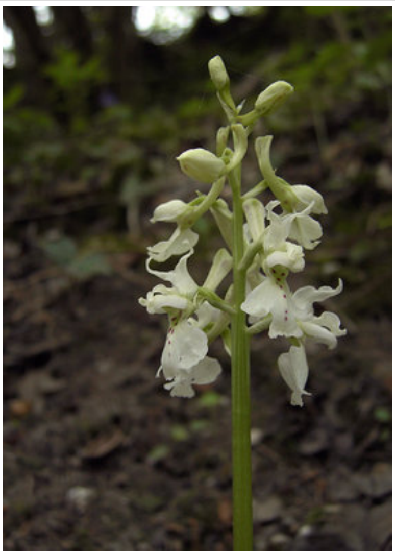
Pale form of Early Purple Orchid – note the purple spots.