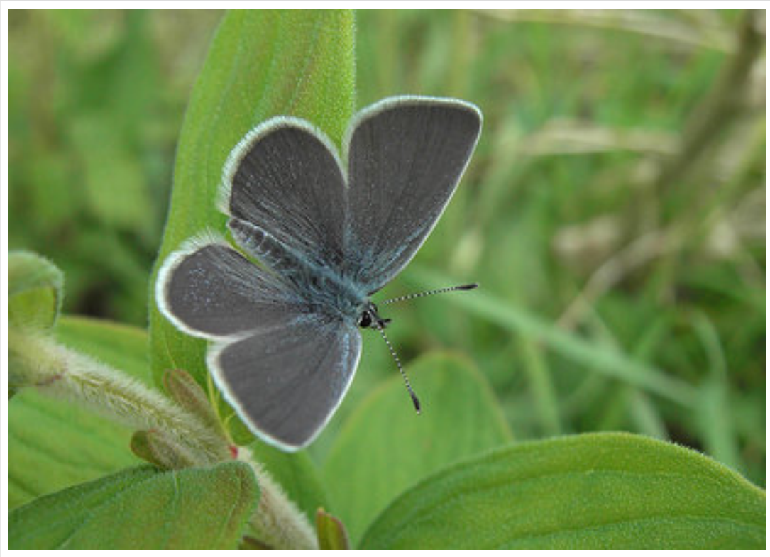
Male Small Blue